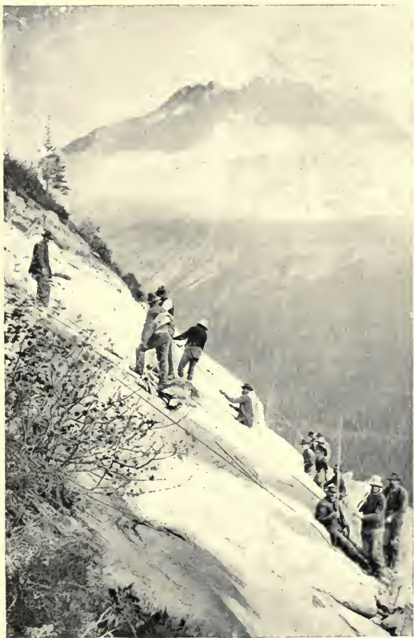
CONSTRUCTING THE WHITE PASS RAILWAY.