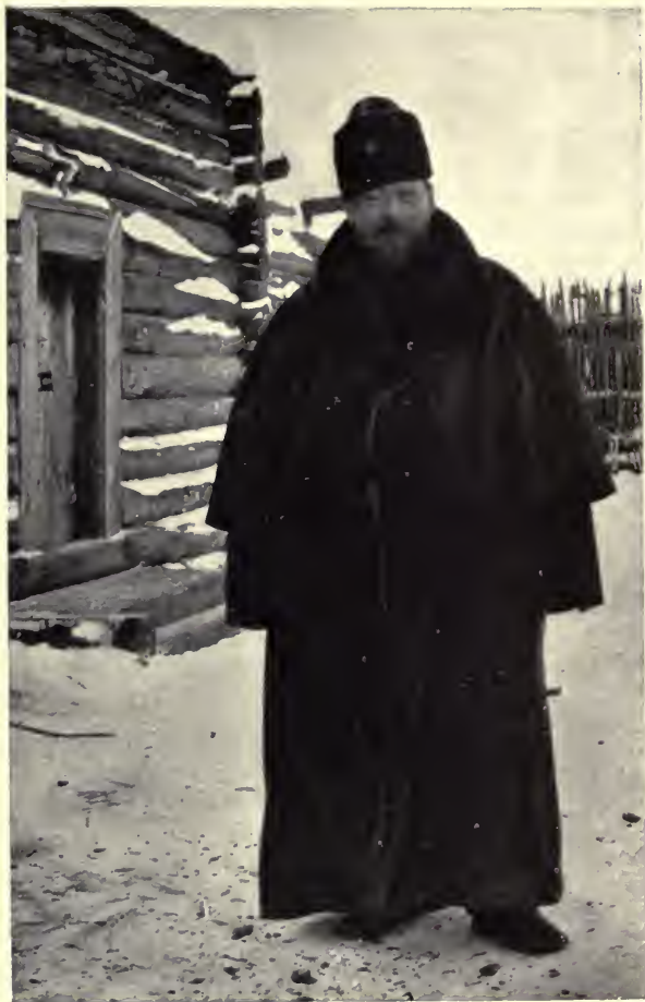
THE CHIEF OF POLICE, VERKHOYANSK.