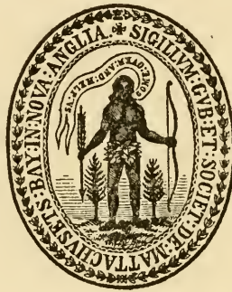
THE FIRST SEAL OF MASSACHUSETTS.

knowledge of the true God; and to conserve the planters, and others coming hither, in the same knowledge and fear of God." On the earliest seal of the Massachusetts Colony, over the figure of the Indian that still stands there, instead of the present Latin legend quoted fitly from Algernon Sidney, was blazoned that stirring Macedonian cry which Paul had heard amid the ruins of Troy, on the night that followed that memorable day when his eye first caught the summits of Europe, "Come over and help us!"