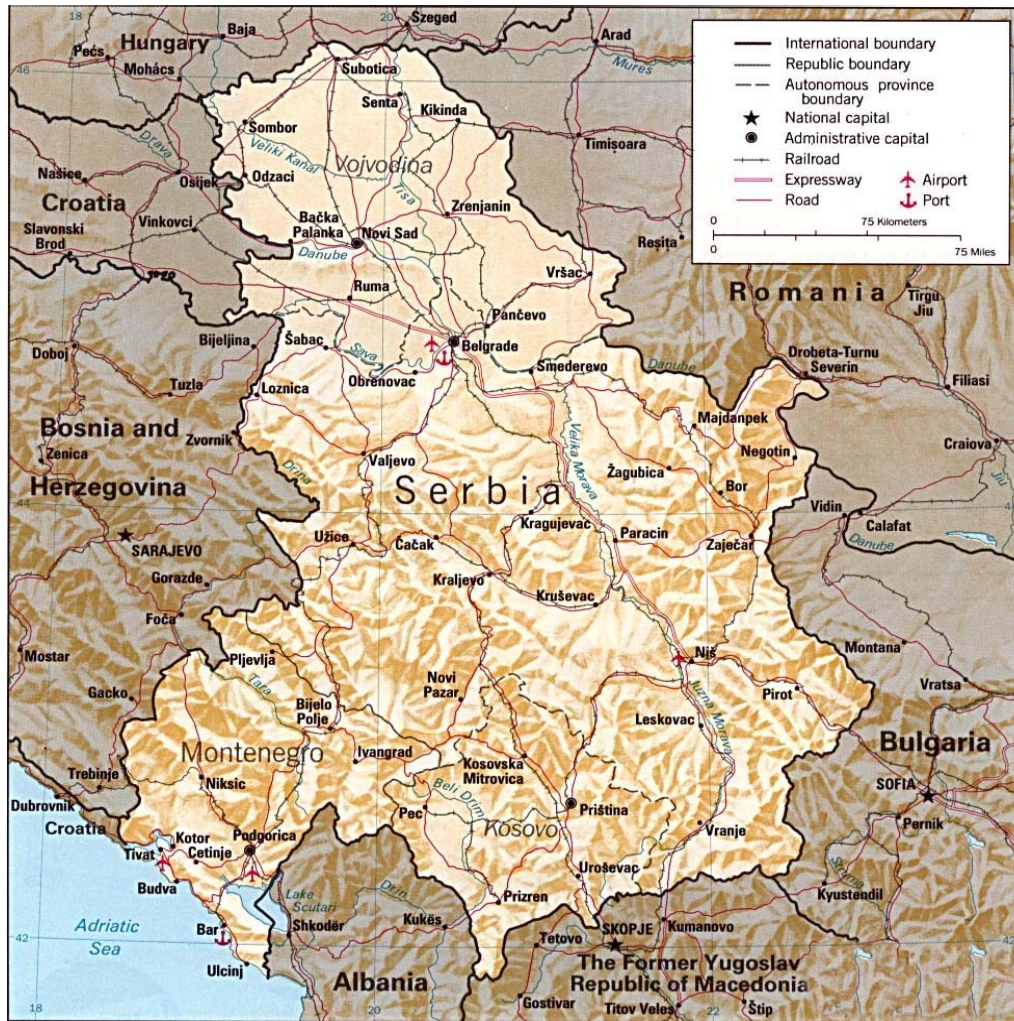
Figure 1. Map of Serbia and Montenegro 1