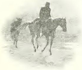
Illustration by Marold and Mittis