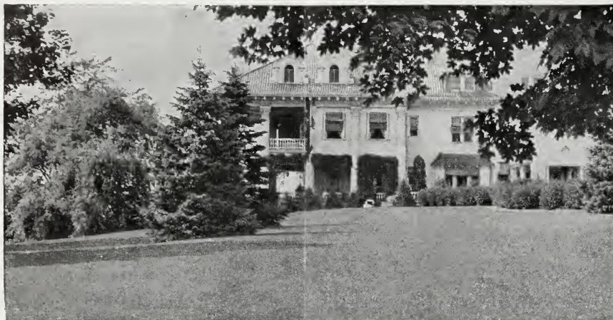
Pierson's Perfection Lawn Seed