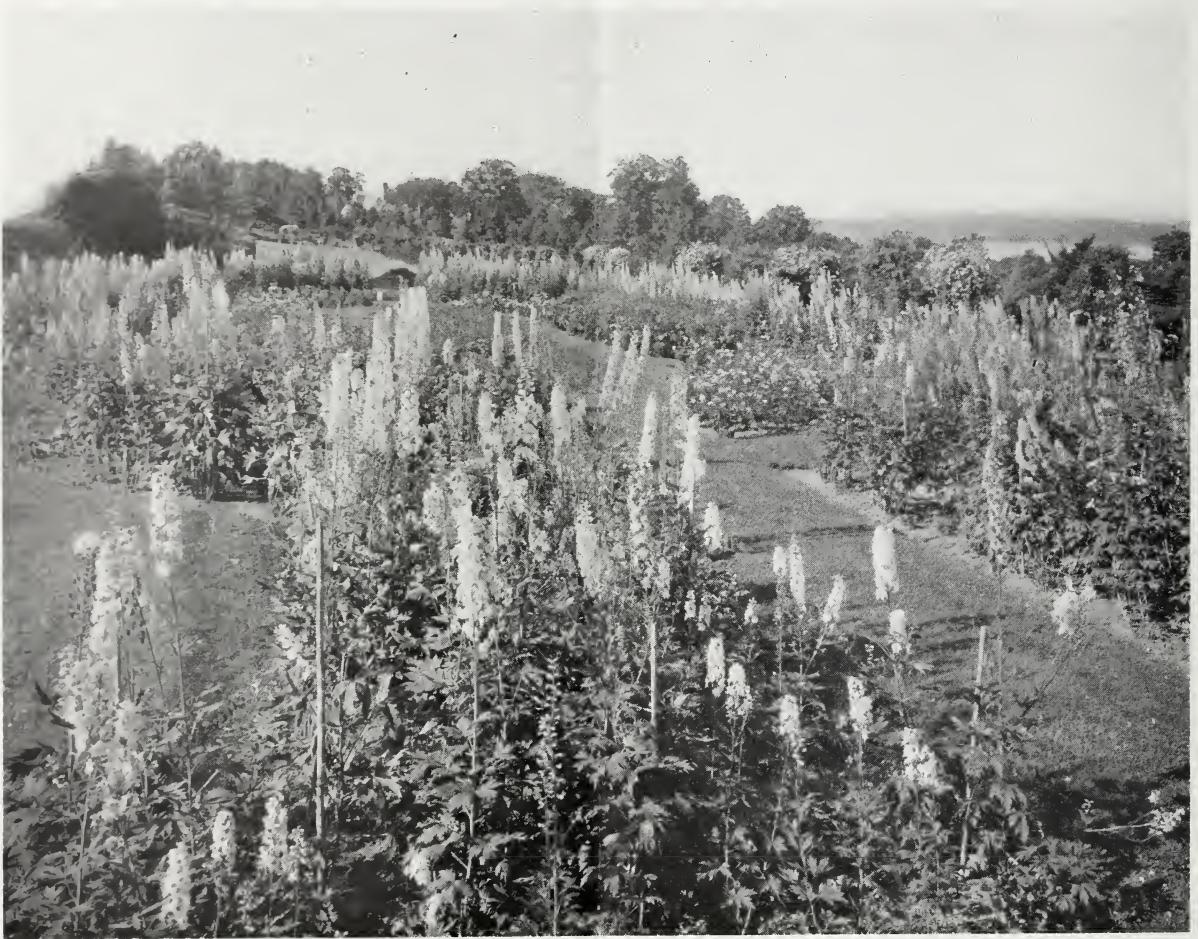
Photograph showing Hybrid Delphiniums in bloom in our nursery at Scarborough, New York.