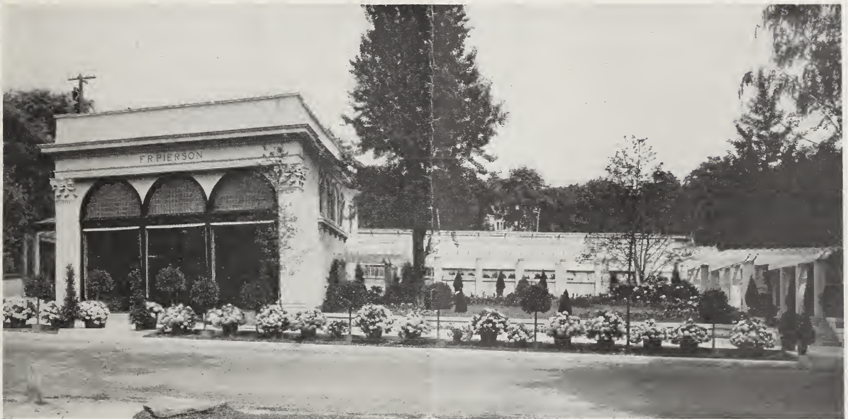
View of our Office and Flower Shop at Tarrytown, N. Y.

BEDDING, DECORATIVE, FLOWERING PLANTS, FERNS, Etc.