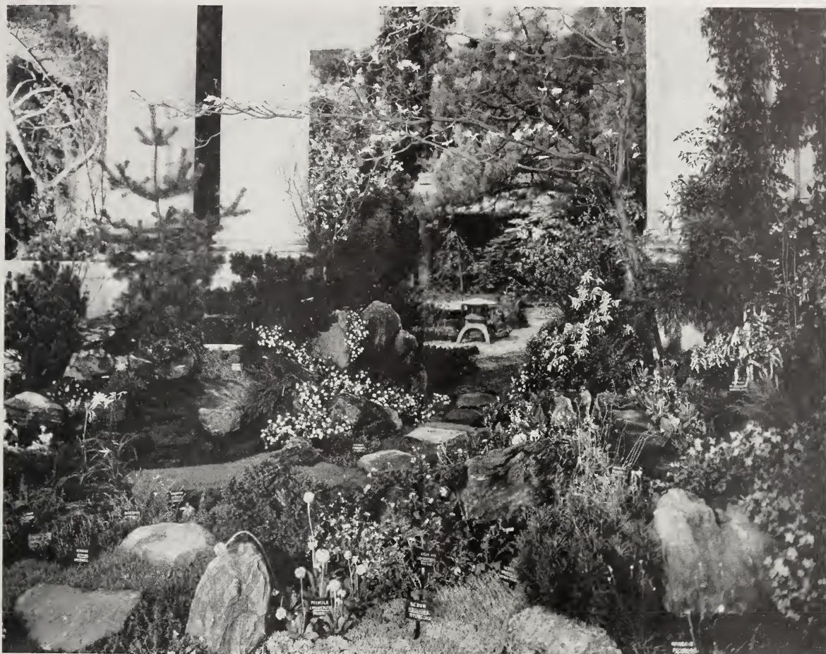
Photograph showing one of our artistically arranged Rock Gardens.