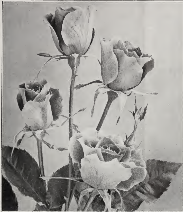
Photograph showing blooms of the Rose "Talisman"

Briarcliff —This variety is an improved Columbia, deeper in color, a pure pink. Bud is beautifully formed, long and pointed, every flower opening perfectly. Splendid grower, throwing long flowering stems.