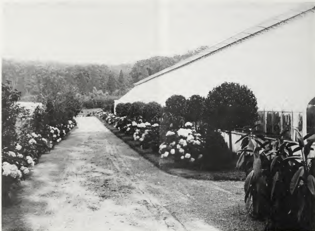
Photograph showing the effect of growing Hydrangeas in tubs for summer flowering