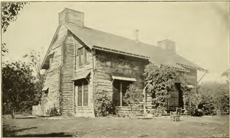
THE FAMOUS LOG CABIN