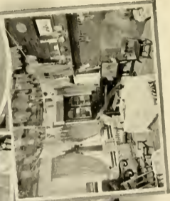
LOG CABIN AND INTERIOR VIEWS