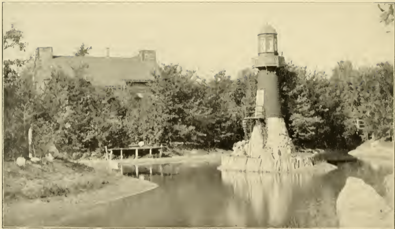
LAKE FRANCES AND LIGHT HOUSE