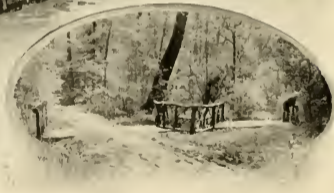
PATHWAYS AND ROADWAYS