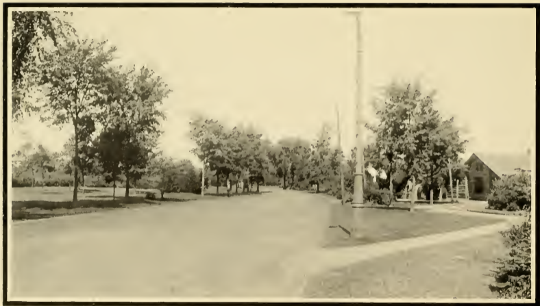
WOODWARD AVENUE ENTRANCE