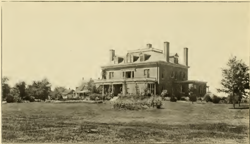
SENATOR PALMER'S HOME