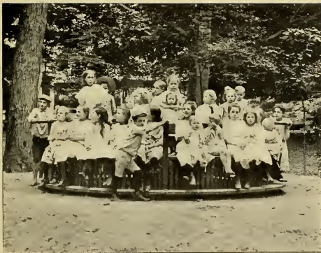
MERRY GO ROUND