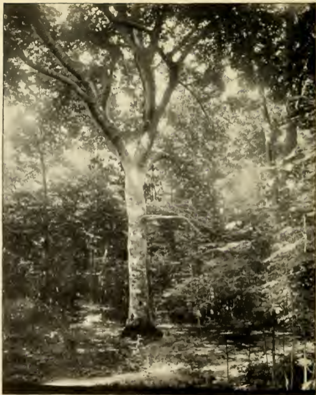
THE NATIVE FOREST

A large portion of the park is covered with a forest of thrifty native, deciduous trees, of all sizes from tiny shrubs and saplings to high and stately trees three feet and more in diameter. The trees average small, stand close together and thus afford to people who know little of the wild woods, the charm of a thick forest.