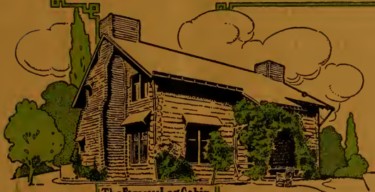
The famous log Cabin