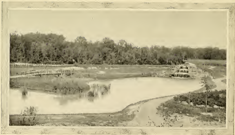
LAKE HAROLD AND PONTIAC CASCADE