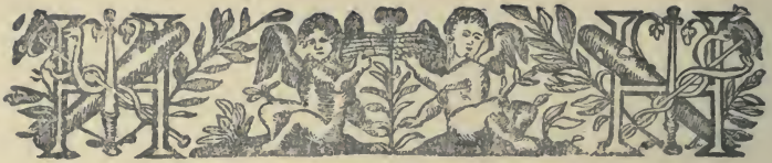
ILLUSTRATION TO VOL. XLIV