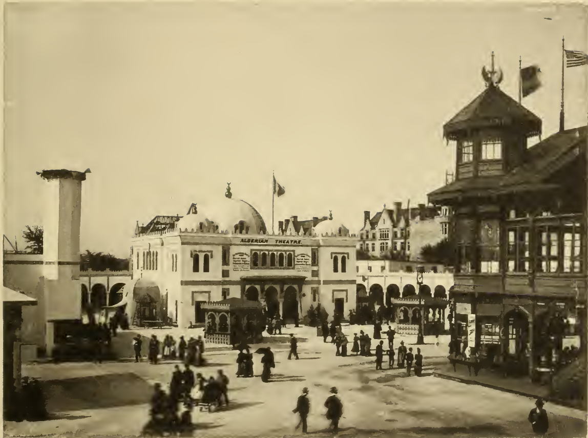
✠ Algerian Theatre and Vienna Cafe. ✠