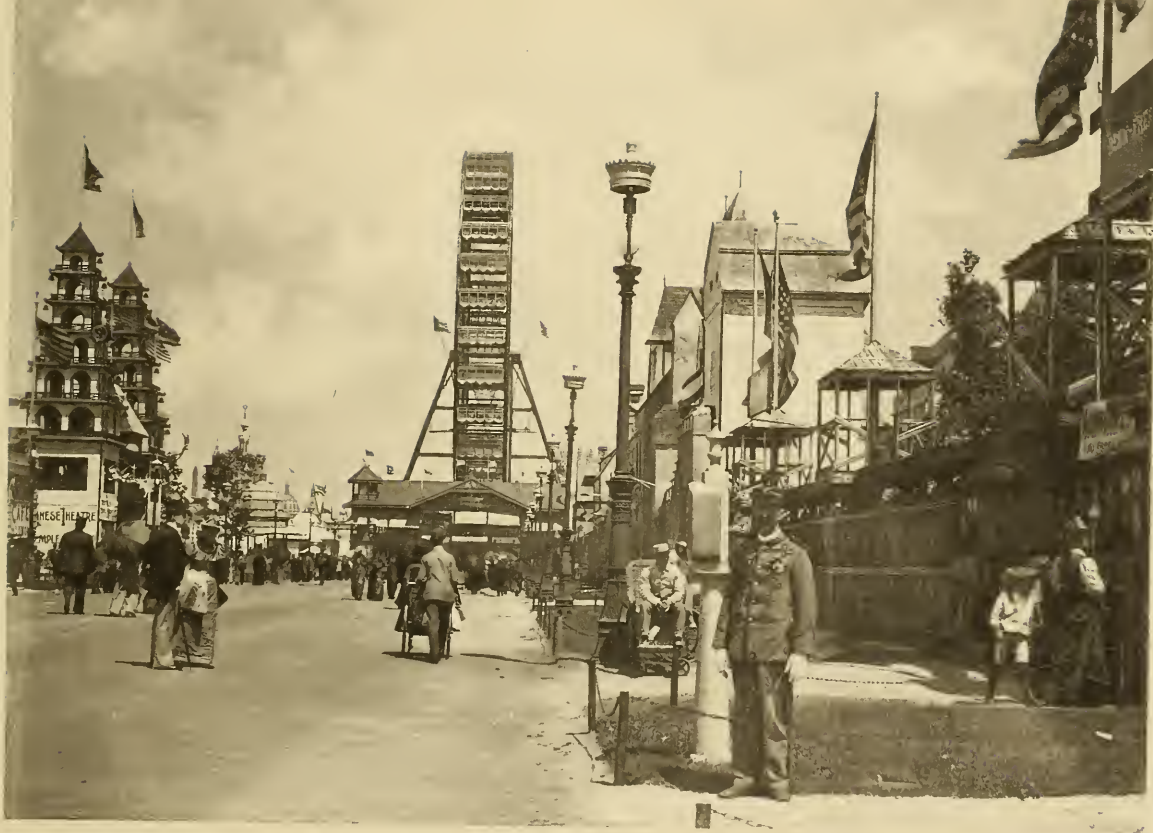
✠ Chinese Pagoda, Ferris Wheel, Old Vienna and Dahomey Village. ✠