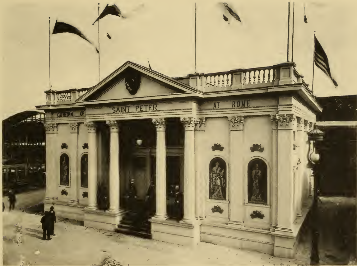
✠ Cathedral of Saint Peter at Rome.