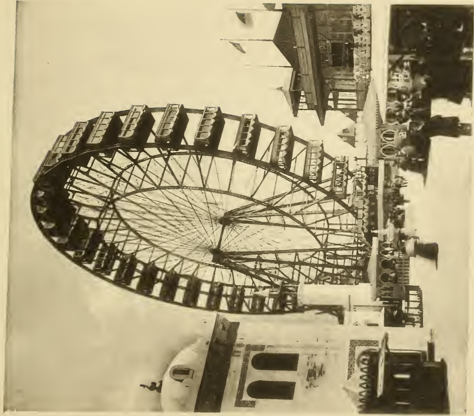
The Ferris Wheel.