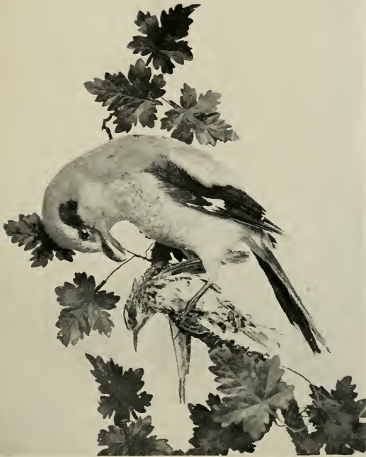
BUTCHER-BIRD (NORTHERN SHRIKE)