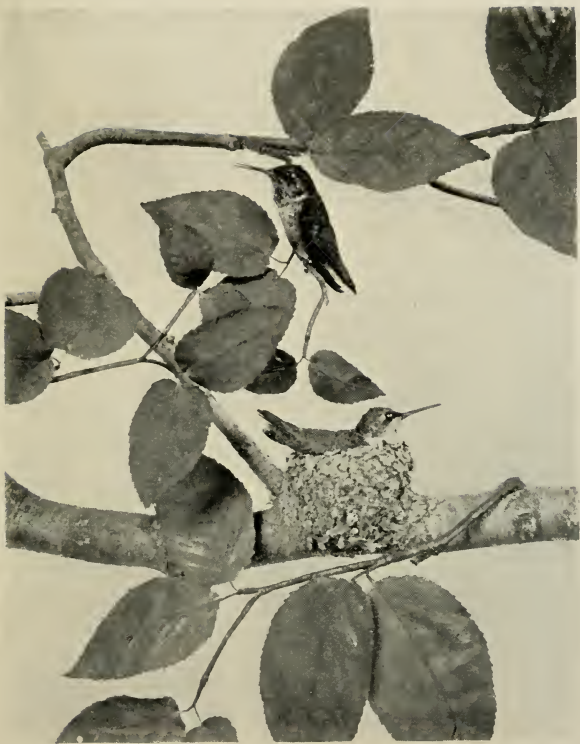
HUMMING-BIRDS AND NEST