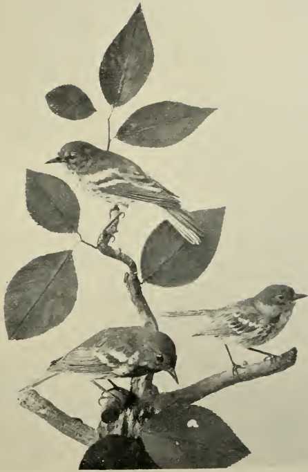
BLACK-THROATED GREEN WARBLERS