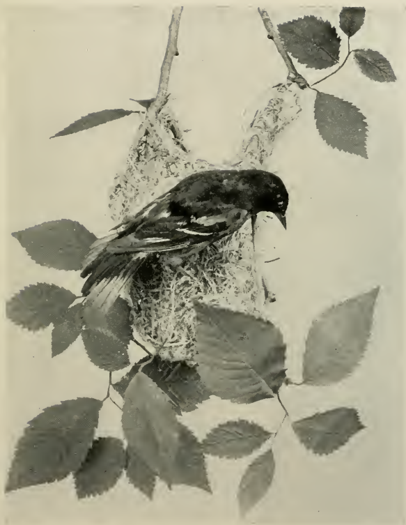
BALTIMORE ORIOLE AND NEST