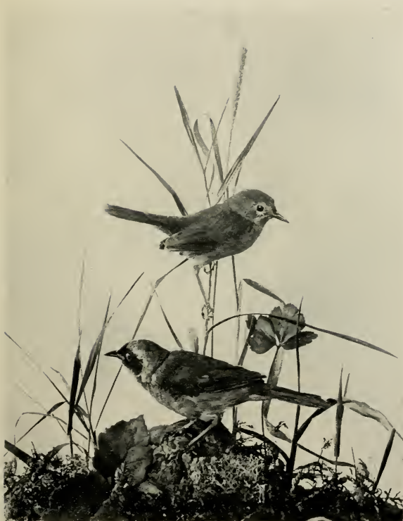
MARYLAND YELLOW-THROATS (WARBLERS)