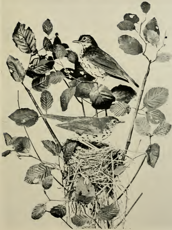
WOOD-THRUSHES AND NEST