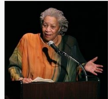
Toni Morrison in 2008

Born Chloe Ardelia Wofford February 18, 1931 (age 83) Lorain, Ohio, United States Occupation Novelist, Writer Genre African American literature Notable Beloved , Song of Solomon , The