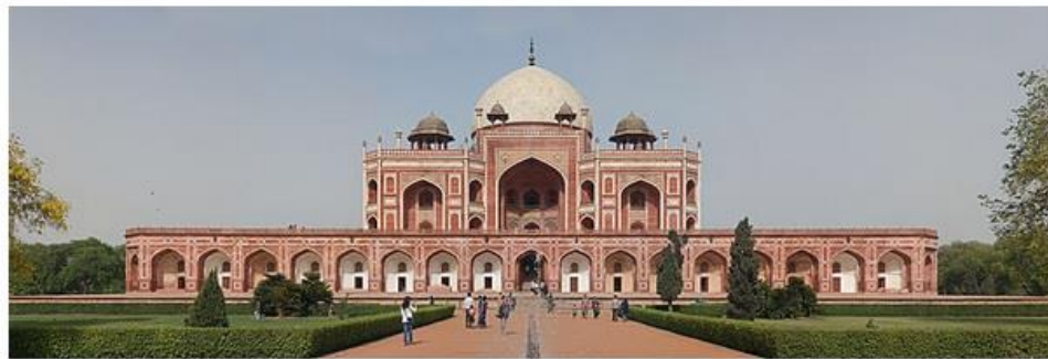
Tomb of Humayun, Delhi, India. Western façade as viewed from the main entrance