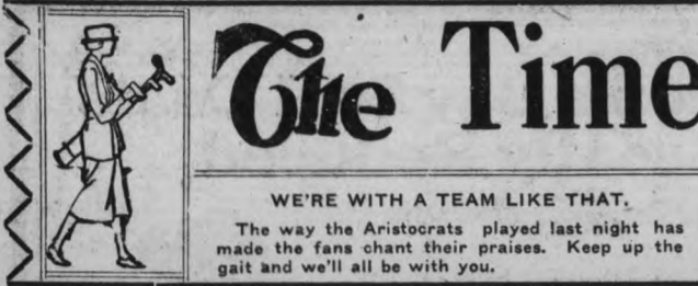
WE'RE WITH A TEAM LIKE THAT. The way the Aristocrats played last night has made the fans chant their praises. Keep up the gait and we'll all be with you.