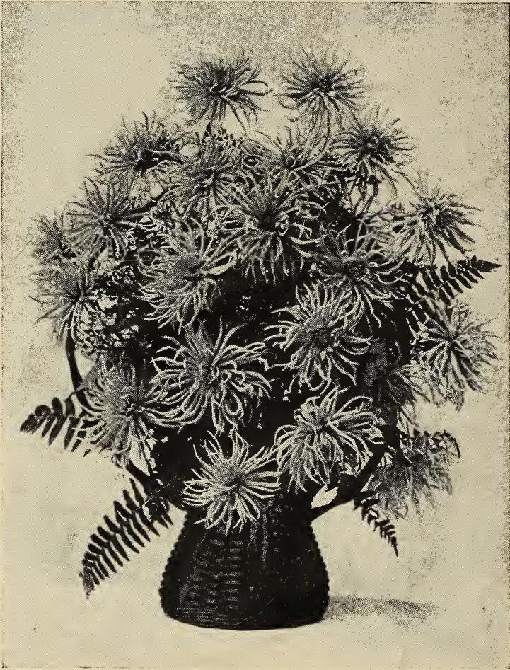
CACTUS DAHLIA Pink Abundance