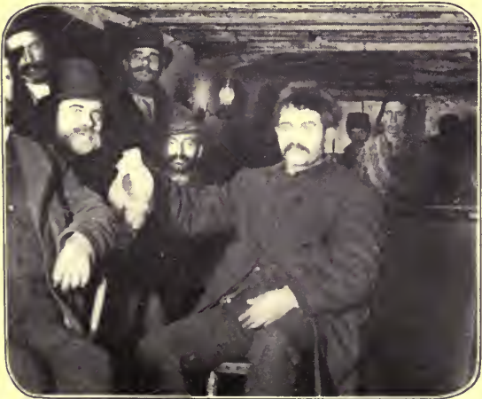
ONE OF RANNEY'S FORMER HAUNTS.