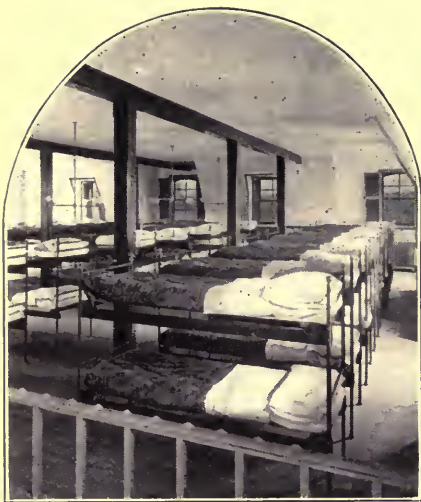
A BOWERY LODGING-HOUSE.