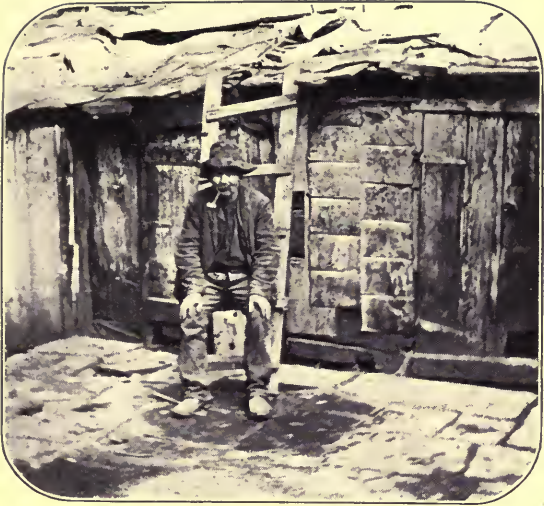
A BACK YARD ON THE DOWERY.