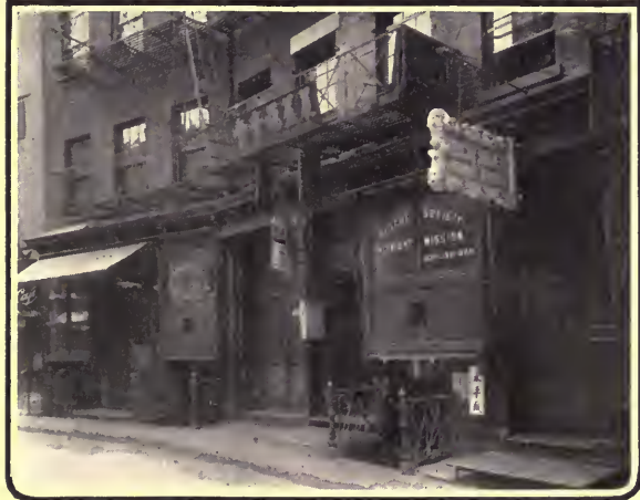
1. THE CHURCH OF SEA AND LAND. 2. MIDNIGHT MISSION, CHINATOWN.