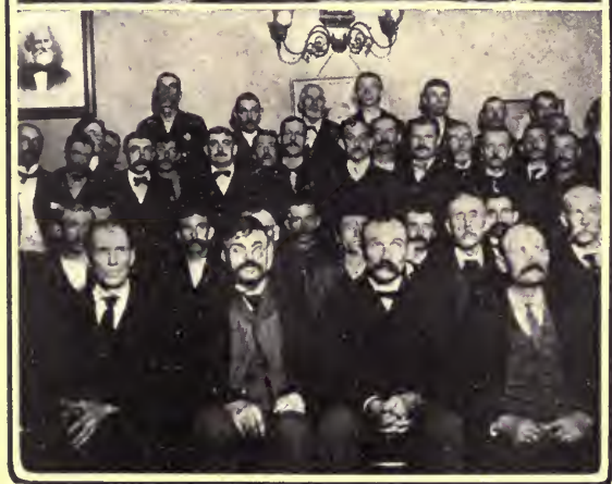
1. READING ROOM, SQUIRREL INN. 2. MEN'S CLUB AT CHURCH OF SEA AND LAND.