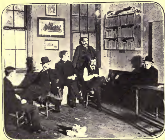
READING-ROOM IN A LODGING-HOUSE.