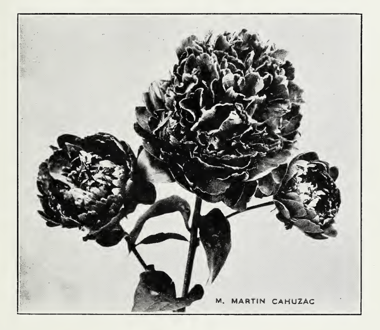
KNOWN AS THE "BLACK PEONY"