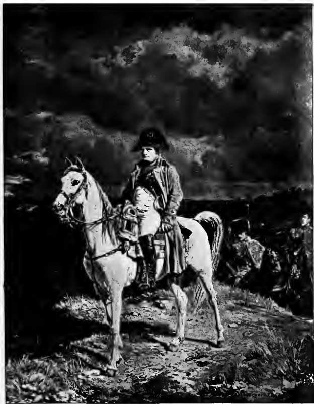
H. Appleton & Company