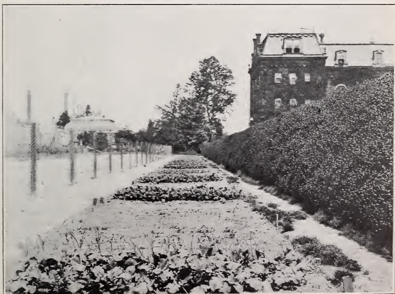
FIG. 2.—THE GARDEN PLATS SHOWN IN FIGURE 1, SIX WEEKS AFTER PLANTING. SCHOOL GARDEN WORK AT WASHINGTON, D. C.