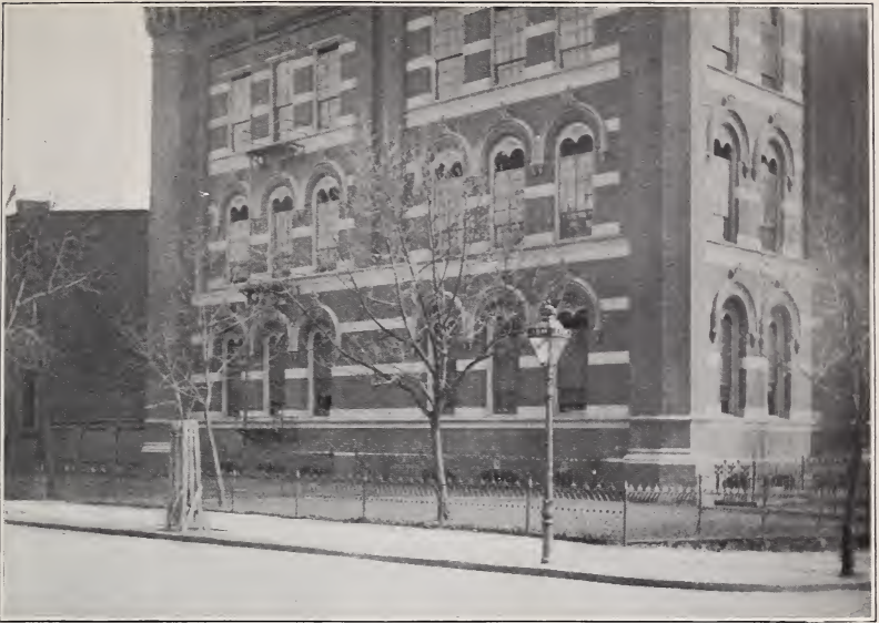
FIG. 1.—THE GROUNDS OF THE FRANKLIN SCHOOL BEFORE IMPROVEMENT BY PUPILS OF THE SECOND, SEVENTH, AND EIGHTH GRADES.