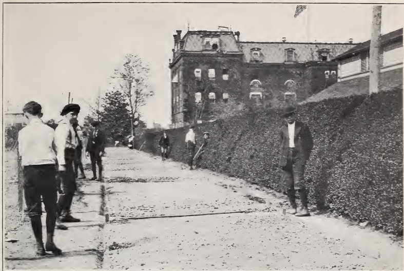
FIG. 1.—GARDEN PLATS LAID OUT BY SIXTH-GRADE BOYS IN THE GROUNDS OF THE DEPARTMENT OF AGRICULTURE.