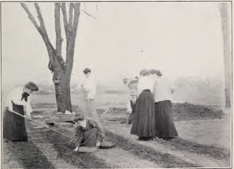
FIG. 2.—NORMAL SCHOOL STUDENTS PLOWING FURROWS AND PLANTING TREE SEEDS SCHOOL GARDEN WORK AT WASHINGTON, D. C.