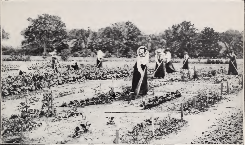
FIG. 1.—TEACHERS' CLASS AT THE SCHOOL OF HORTICULTURE, CONDUCTED ON SATURDAY MORNINGS.