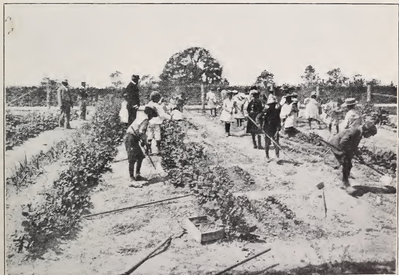
FIG. 2.—CHILDREN AT WORK IN GARDEN OF THE WHITTIER SCHOOL, HAMPTON INSTITUTE, HAMPTON, VA.

SCHOOL GARDEN WORK AT WASHINGTON, D. C., AND HAMPTON, VA.