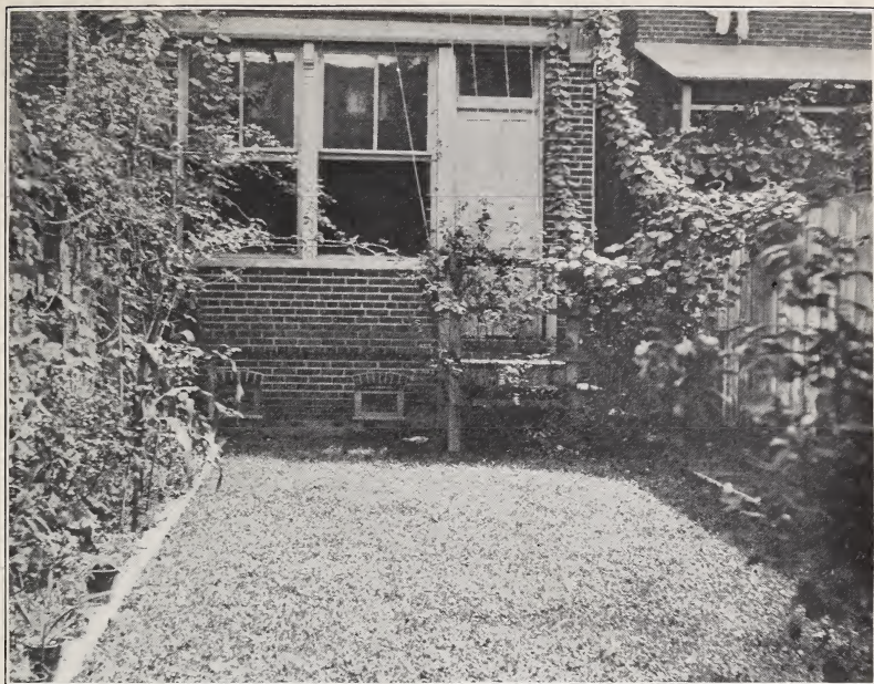
FIG. 1.—YARD OF NORMAL SCHOOL STUDENT, WASHINGTON, D. C., SHOWING OPEN LAWN AND MASS BORDER PLANTING.