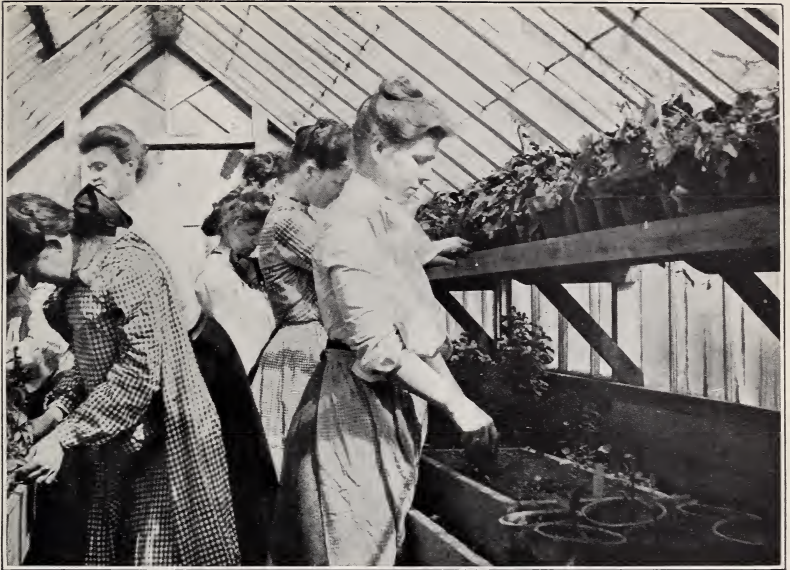
FIG. 1.—NORMAL SCHOOL STUDENTS AT WORK IN A GREENHOUSE OF THE DEPARTMENT OF AGRICULTURE.