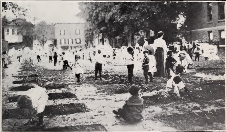
FIG. 2.—KINDERGARTEN CLASSES AT THE WADSWORTH SCHOOL, SHOWING GARDEN CONTAINING 288 PLATS.