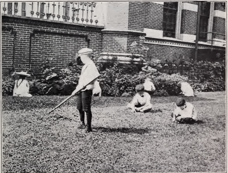
FIG. 2.—VACATION COMMITTEE AT WORK IN GARDEN OF SECOND-GRADE CHILDREN, FRANKLIN SCHOOL, FOUR MONTHS AFTER PLANTING.