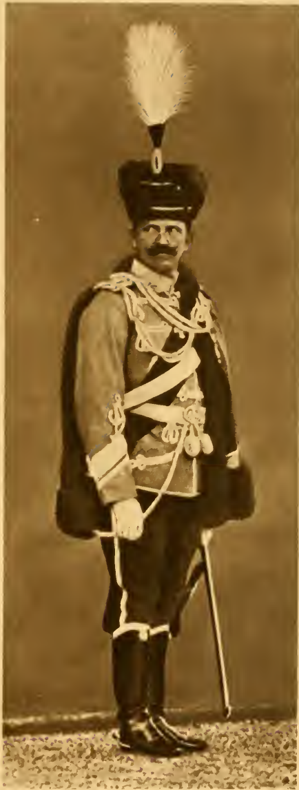
VICTOR EMMANUEL King of Italy