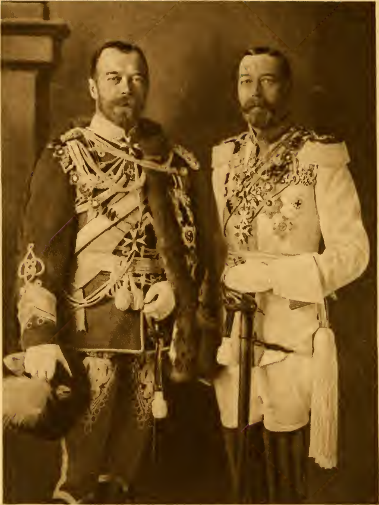
KING GEORGE V. OF GREAT BRITAIN AND IRELAND and TSAR NICHOLAS II. OF RUSSIA