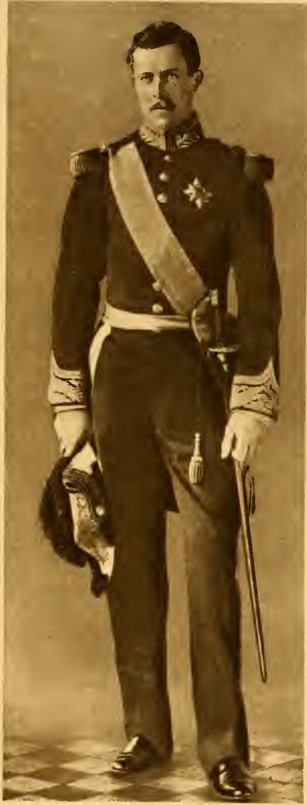
ALBERT I. King of the Belgians