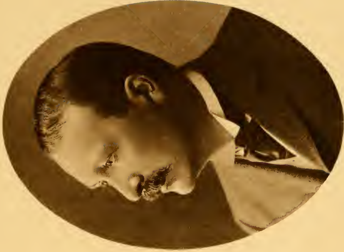
M. RENÉ VIVIANI