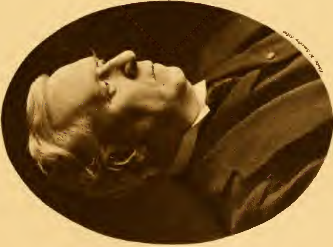
THE RT. HON. H. H. ASQUITH