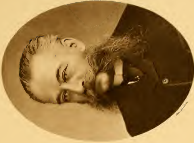
M. J. L. GOREMYKIN