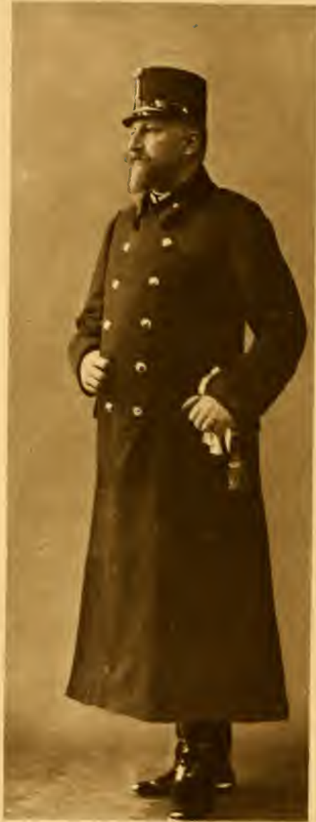
FERDINAND I. Tsar of Bulgaria