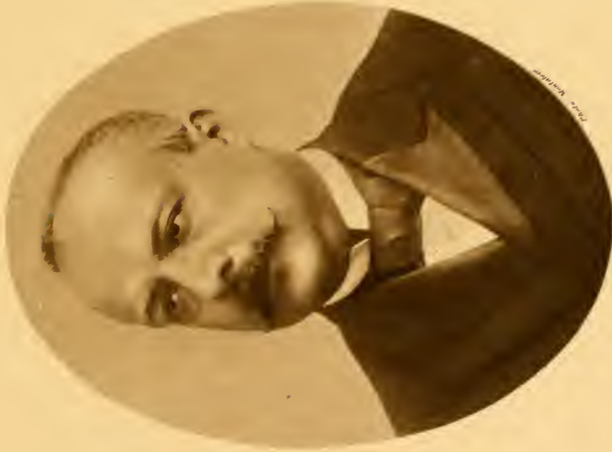
SIGNOR A. SALANDRA