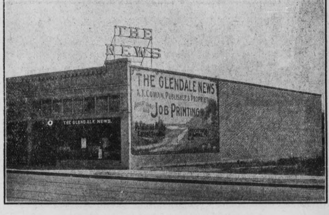
We Print Anything from a Card to a Book