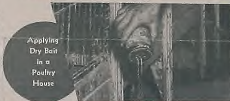
Applying Dry Bait in a Poultry House

Apply cornmeal bait at the rate of 2 to 4 ounces per 1,000 square feet in barns or sheds. A higher rate—4 to 8 ounces per 1,000 square feet—may be necessary in open places; the rate depends on the condition of the surface and on the abundance of flies.