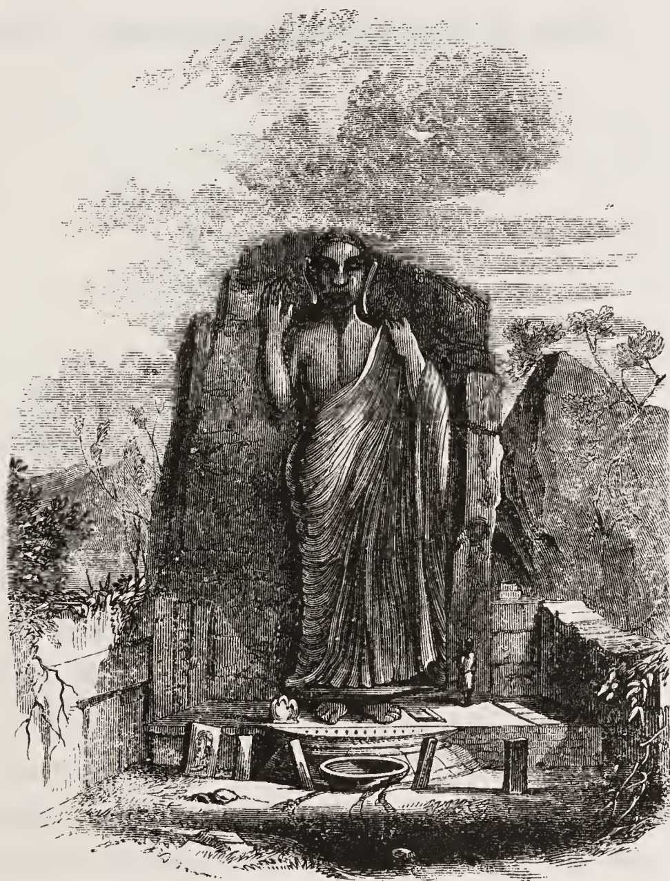
Colossal Statue of Buddhu at the Aukane Wihare.