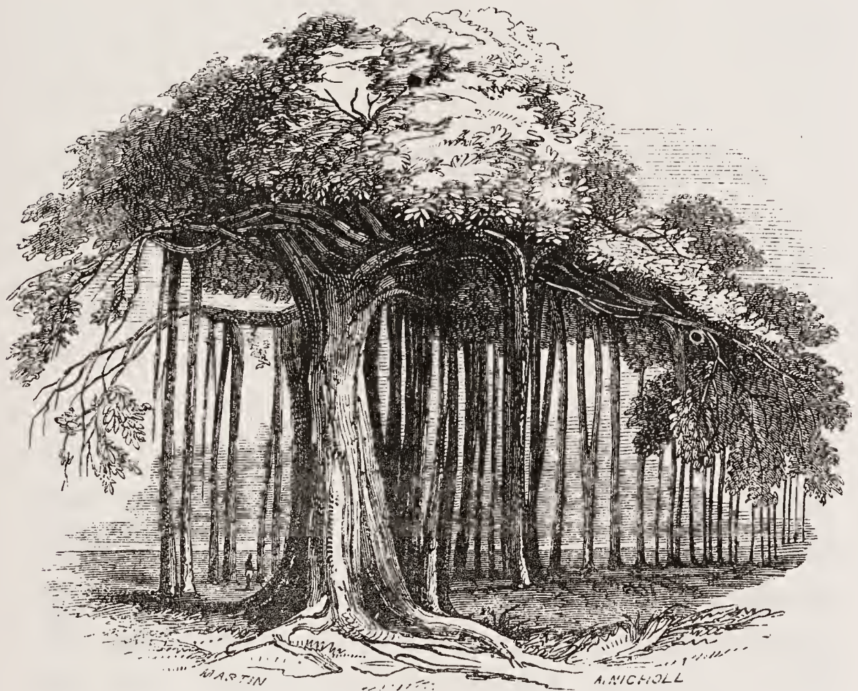
The Banyan Tree—Mount Lavinia.