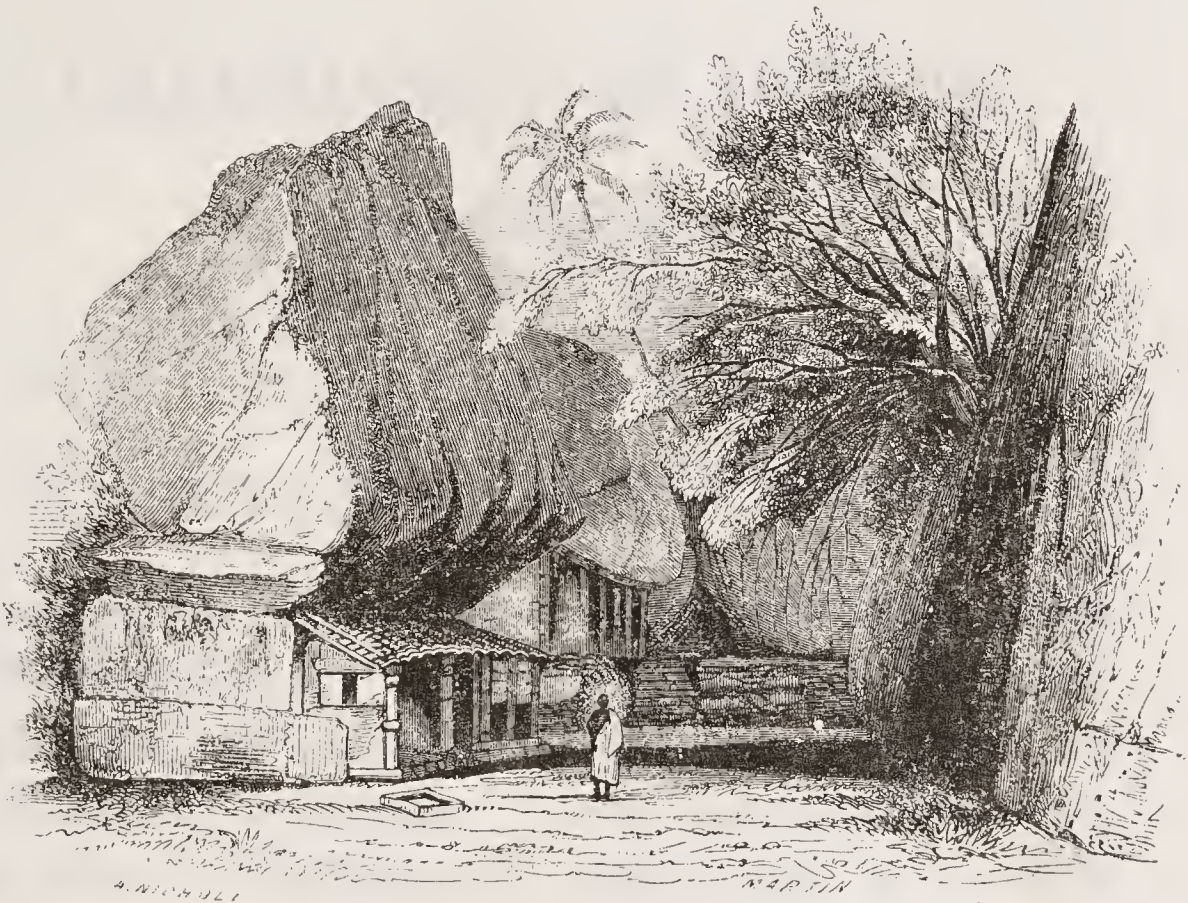
The Alu Wihare, Matelle.