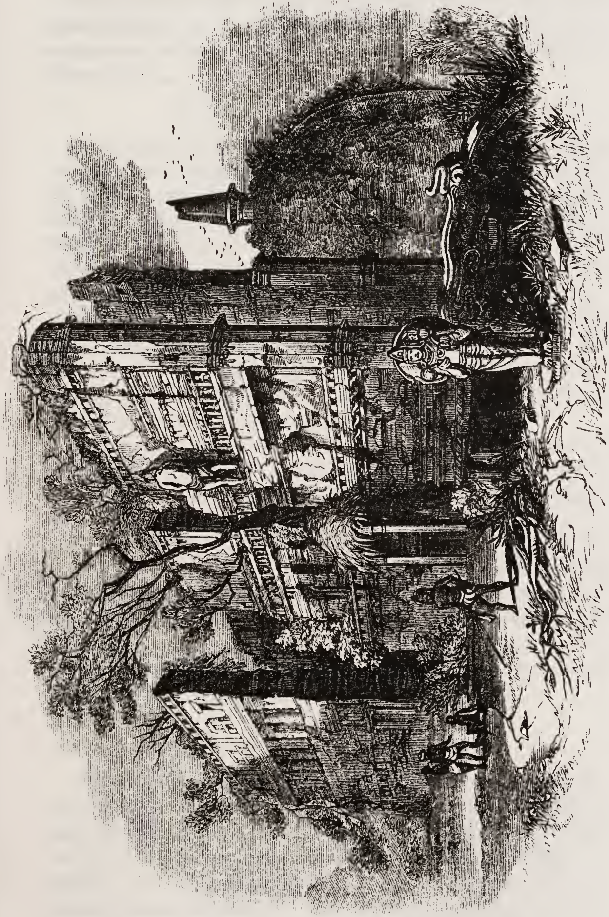
The Jayatavanarama—Ruins of Follanarua.