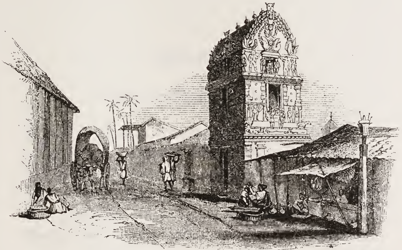
Entrance to a Hindoo Temple—Colombo.