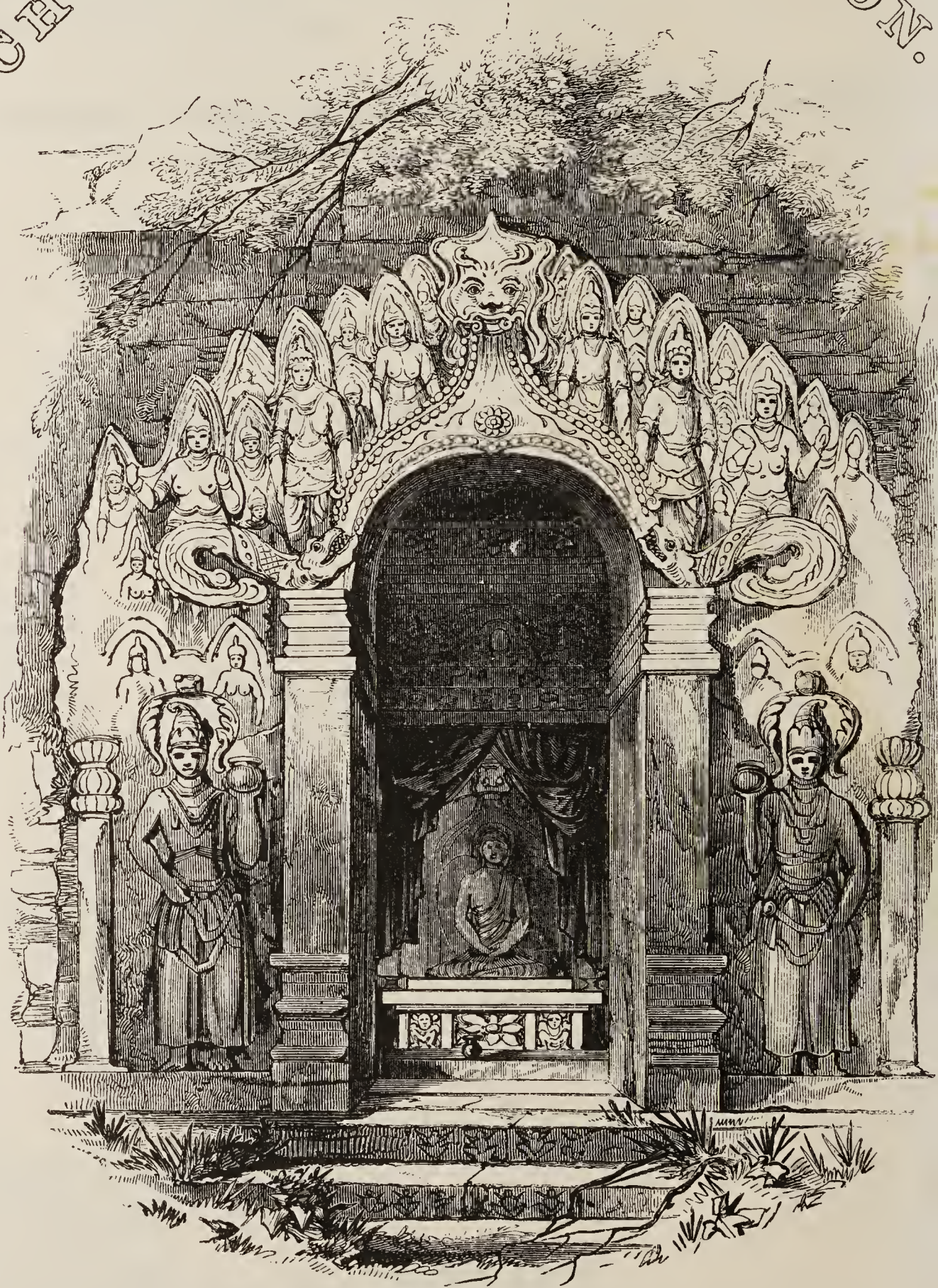
Entrance to the Great Temple of Dambool.