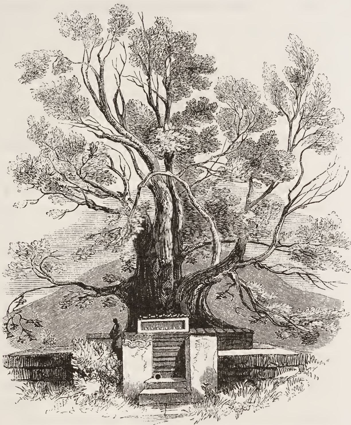
The Sacred Bo Tree.