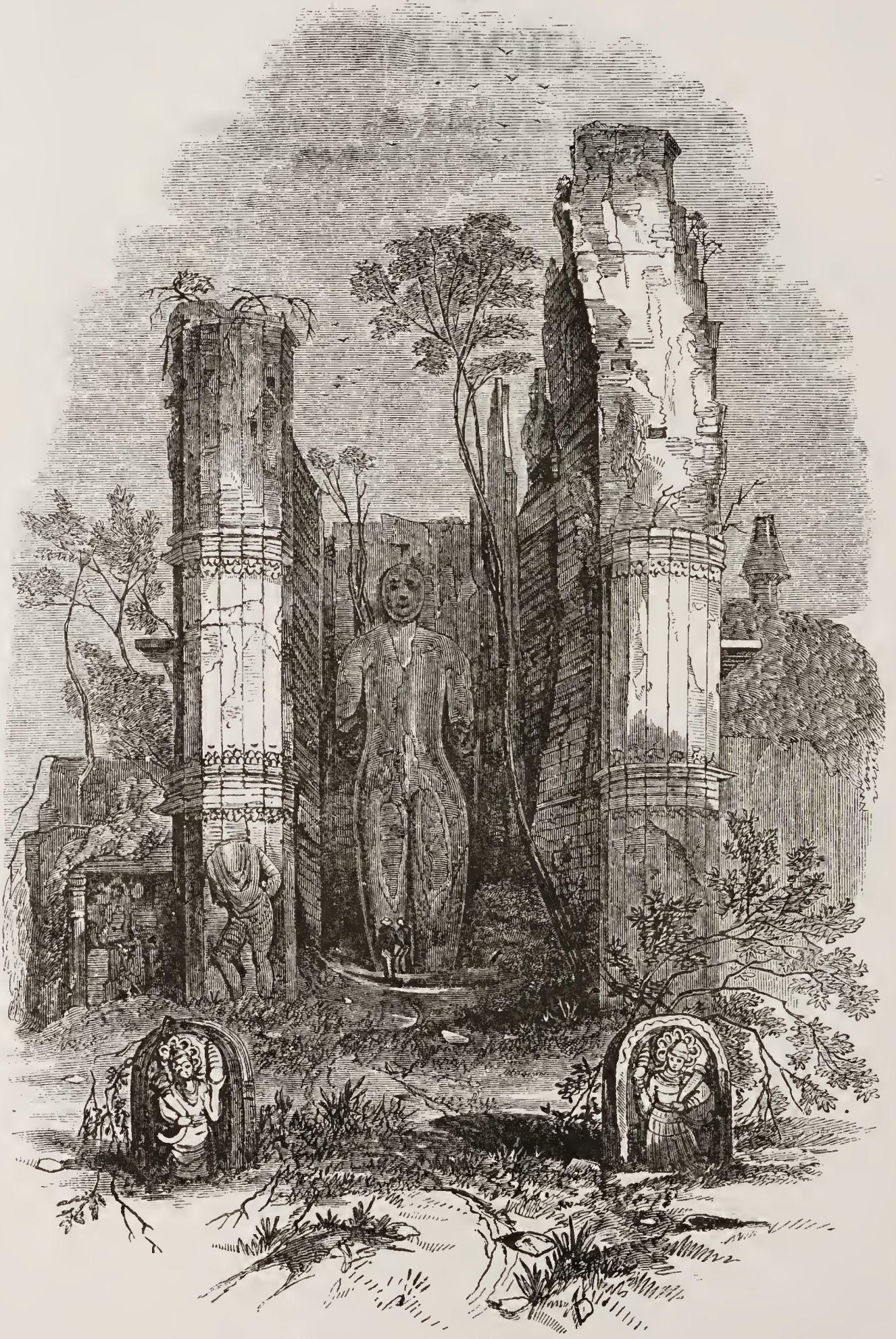
The Jayatawanarama.—Ruins of Pollanarua.