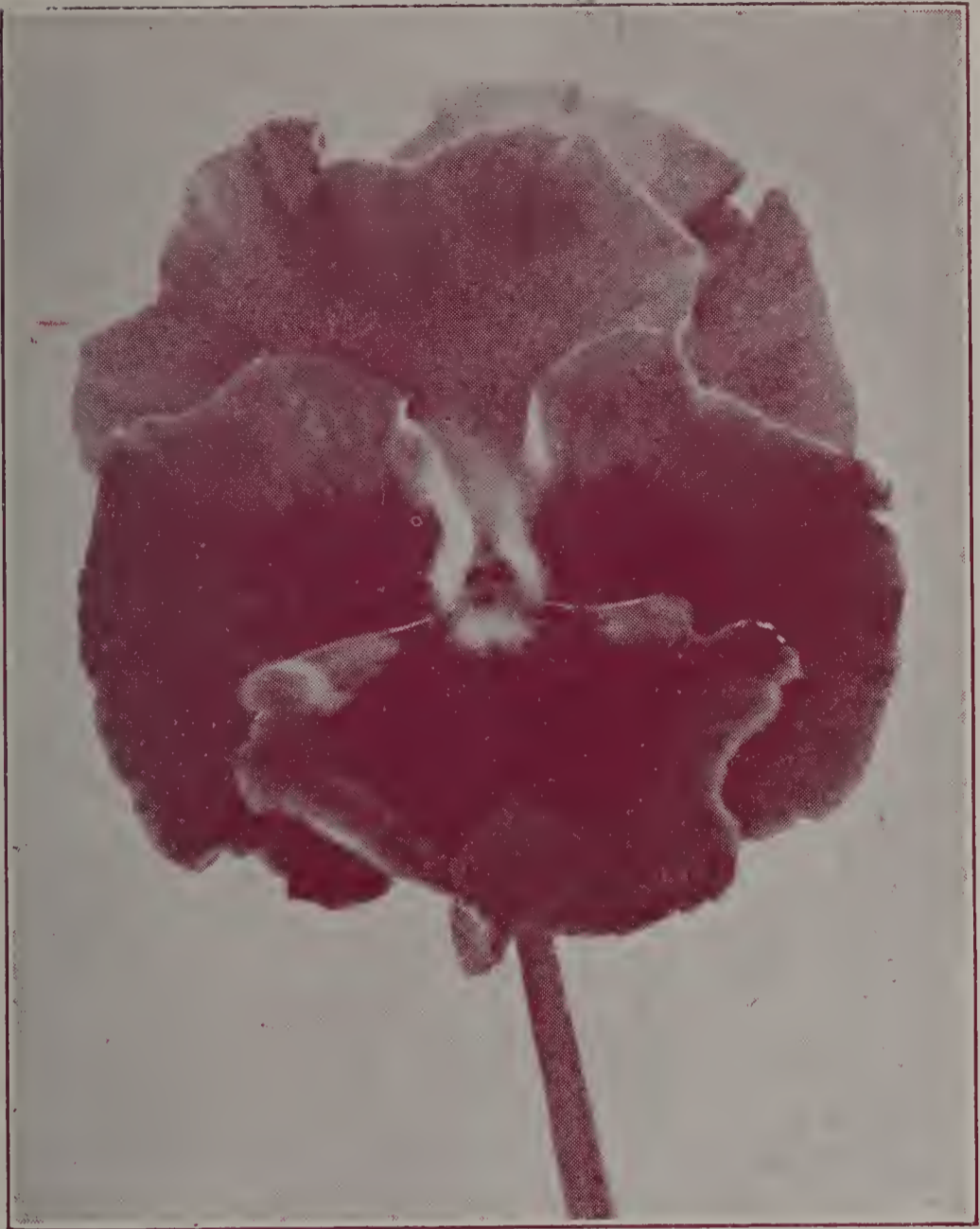
A SPECIMEN OF PANSY, HARROLD'S RUBY GIANTS