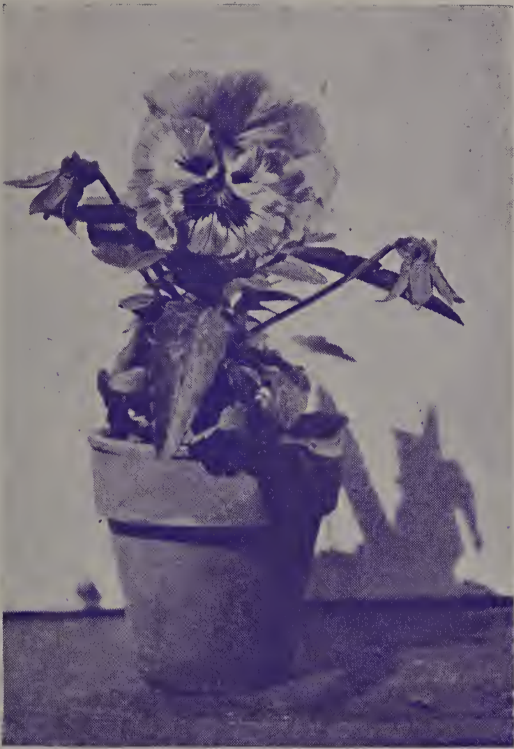
A HARROLD'S PEDIGREED POT PANSY