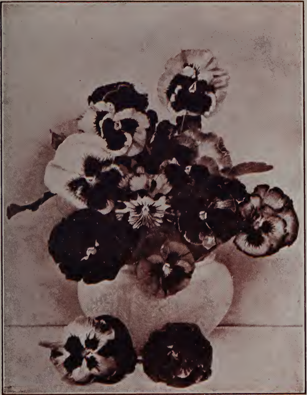
A BOUQUET OF HARROLD'S PEDIGREED GIANTS Bowl is 8 inches in diameter. See description on oppsite page.