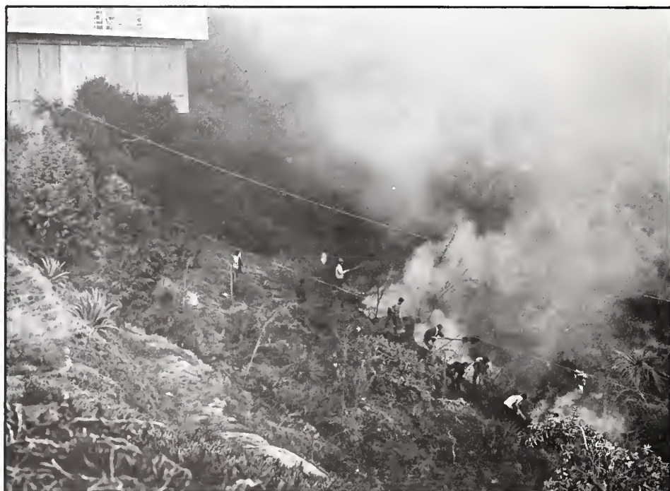
Homes in the wildland-urban interface are often caught in wildfires that break out in chaparral-covered lands in southern California.