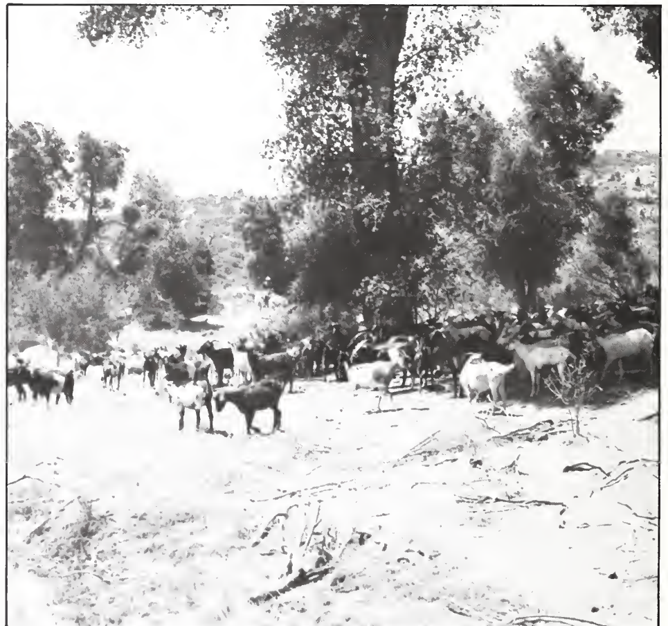
Goats have proved to be an effective biological means of controlling brush regrowth in chaparral and associated ecosystems.

•Cooperative agreements with Los Angeles County Forestry Department produced guides for homeowners that outlined techniques for landscaping, vegetation maintenance, soil stabilization, and other measures for protecting residences in the wildland/urban interface from the onslaught of the fire-flood cycle. A preliminary booklet A Homeowner's Guide to Fire and Watershed Management at the Chaparral/Urban Interface , which was widely distributed by Los Angeles County and various homeowner's associations, will be followed by a more comprehensive PSW General Technical Report being processed for publication.