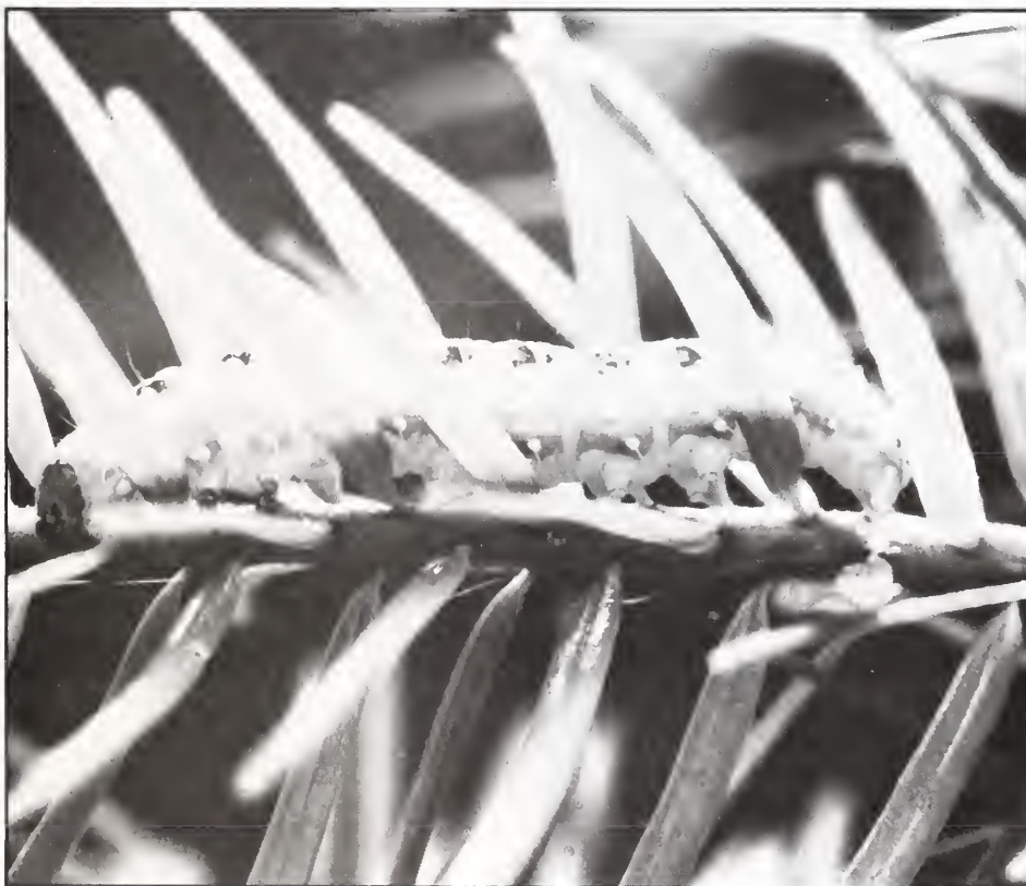
This budworm larvae is soon to be at the peak of its feeding stage.

Each area of the West has its own history of outbreaks and local events are often seen by residents as isolated events. Outbreaks, however, have occurred in every western state except California during the past 60 years, and the resulting defoliation provides a common thread linking these geographically disparate areas—tree foliage damaged by the insect turns red, presaging important economic and environmental effects.