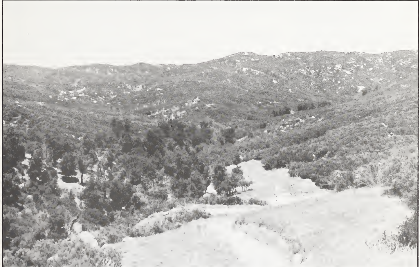
Chaparral—evergreen, sclerophyllus shrubs—and associated vegetation types—cover much of the wildlands of central and southern California above 500 feet elevation.

The chaparral ecosystem in California comprises more than 20 million acres, from 20 to 30 percent of the State's total land area. In southern California, some 13 million people live in or near chaparral-covered hills and mountains, or in the foothill valleys below.