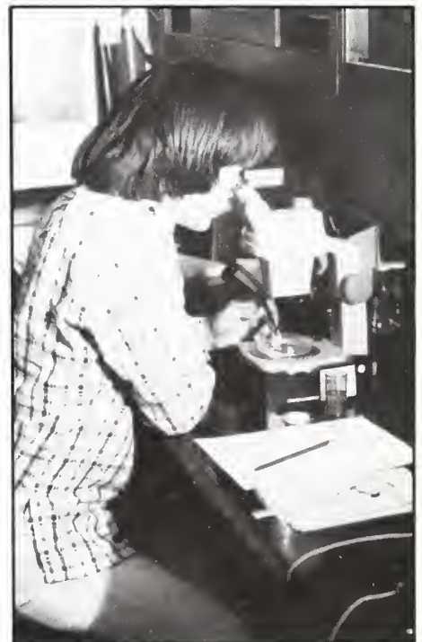
Examination of the stomach contents of birds confirmed their importance as predators of the budworm.

Thus it is that the computer, often an integral part of a forester's toolbox, will be incorporated even more into the day-to-day management of a forest. Stark believes that the Program will produce meaningful and accurate information that will be readily accessible to forest managers. Sitting at a terminal keyboard, they will be able to use the computer models to arrive at decisions to be incorporated into an integrated forest management plan.