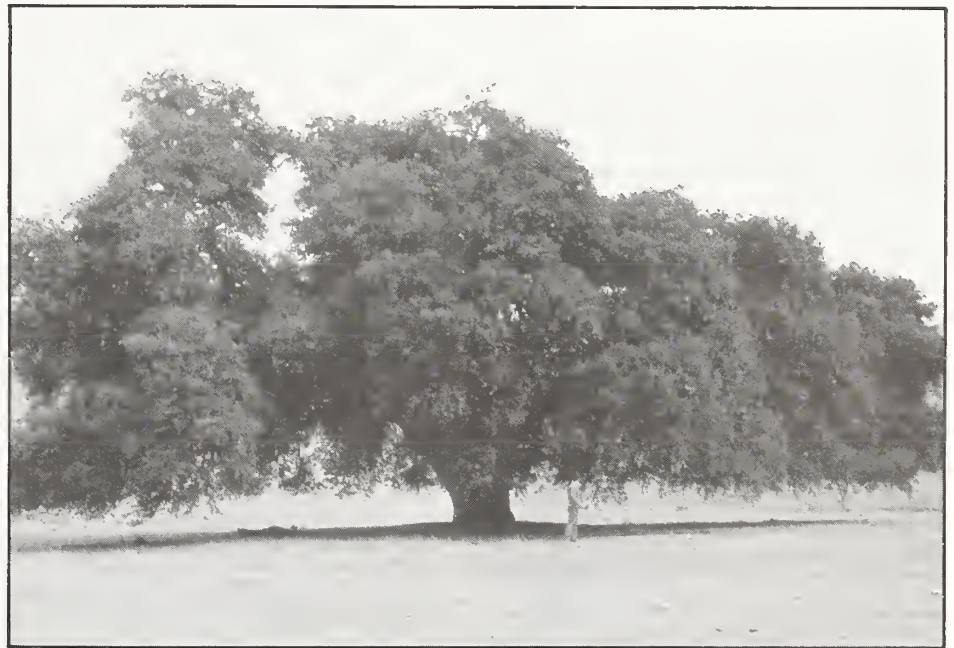
A symposium on management of California oaks sponsored by the Chaparral R&D Program was the first meeting of its kind.