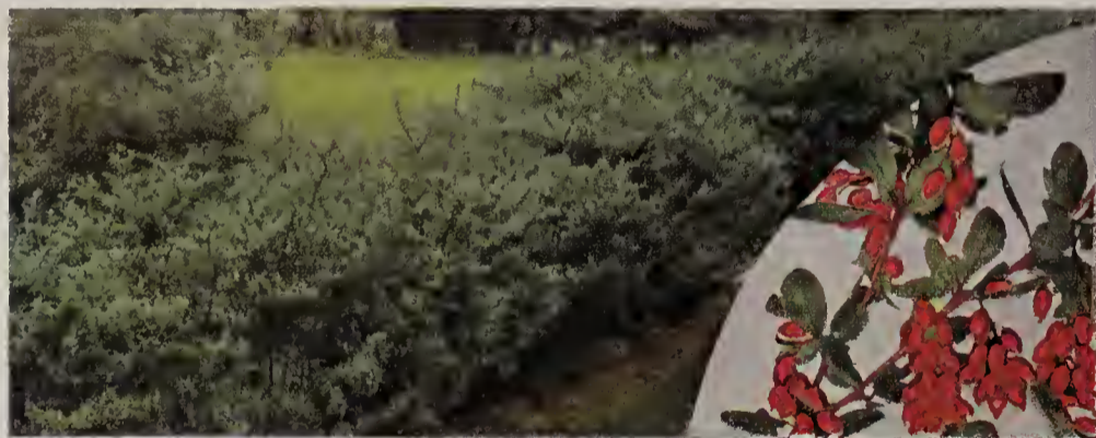
Barberry Makes a Most Compact and Easily Kept Hedge