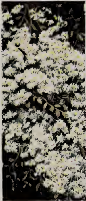
Sweet Autumn Clematis

Ampelopsis triacanthoides (Boston Ivy)—Glossy dark green leaves which turn red in fall. Good cover for masonry. Foliage not attacked by insects or diseases, nor injured by smoke or dirt. Each 50c; 3 for $1.39.