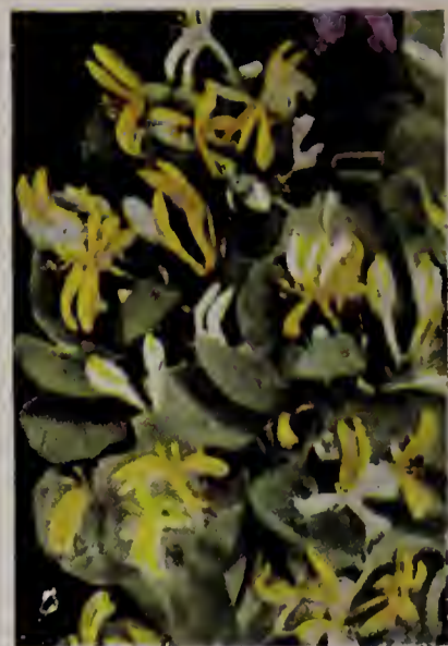
Hall's Japan Honeysuckle

Wisteria sinensis (Wisteria)—Grows rapidly in a loose twining manner. Flowers in May. Prefers deep, rich, moist soil. With white or lavender flowers. 50c each; 3 for $1.39.