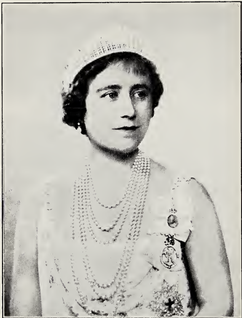
Her Majesty Queen Elizabeth