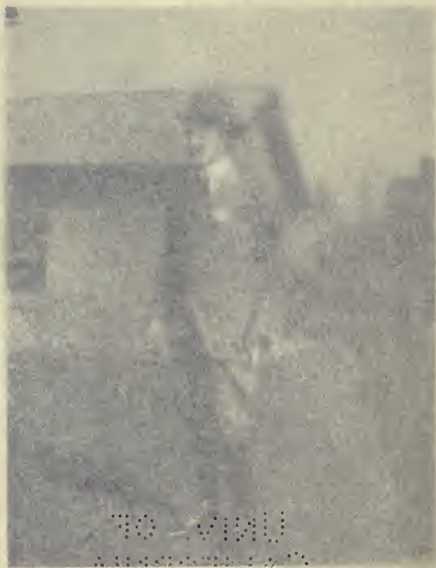
CHARLES HALSTED SLAPES