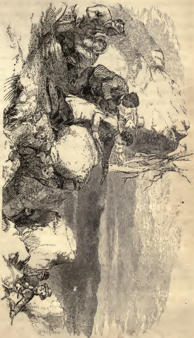
THE FREEMAN'S DEFENCE. Page 284.