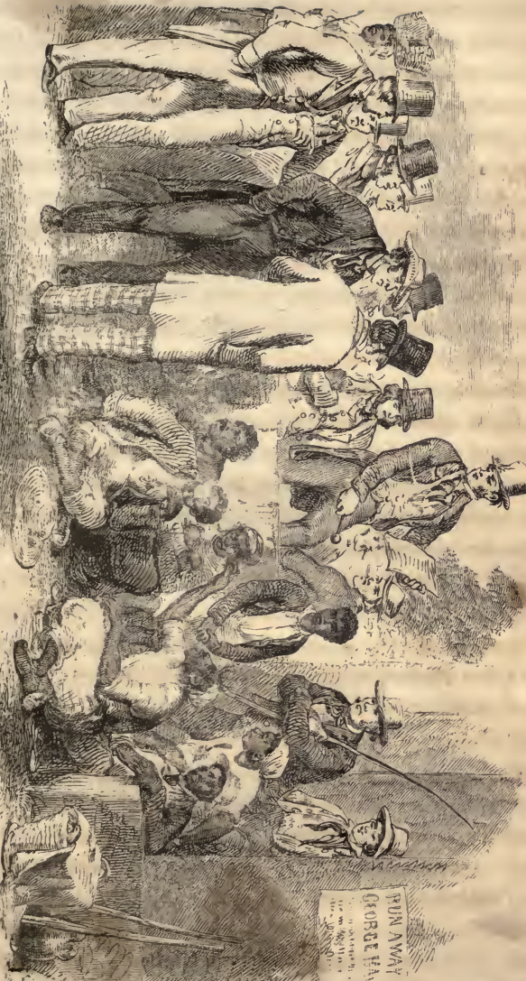
THE AUCTION SALE. Page 174.