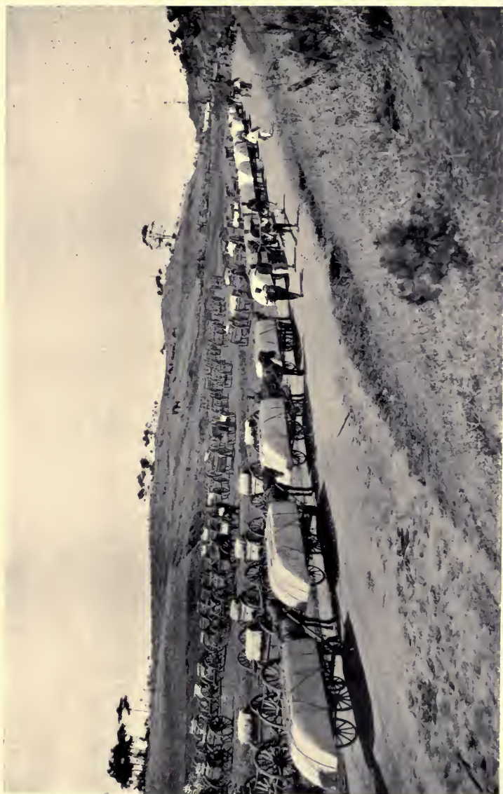
PONTOONS USED ON THE YALU PASSING ARTILLERY CAMP NEAR WIJU