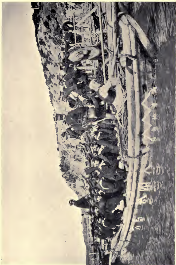
LANDING TROOPS FROM TRANSPORTS AT CHENAMPO