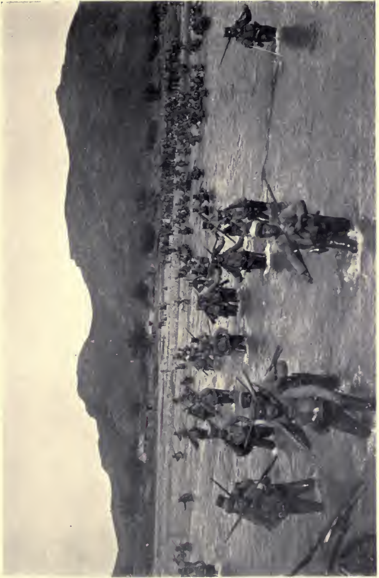
INFANTRY FORDING THE TANG RIVER ON AUGUST 23