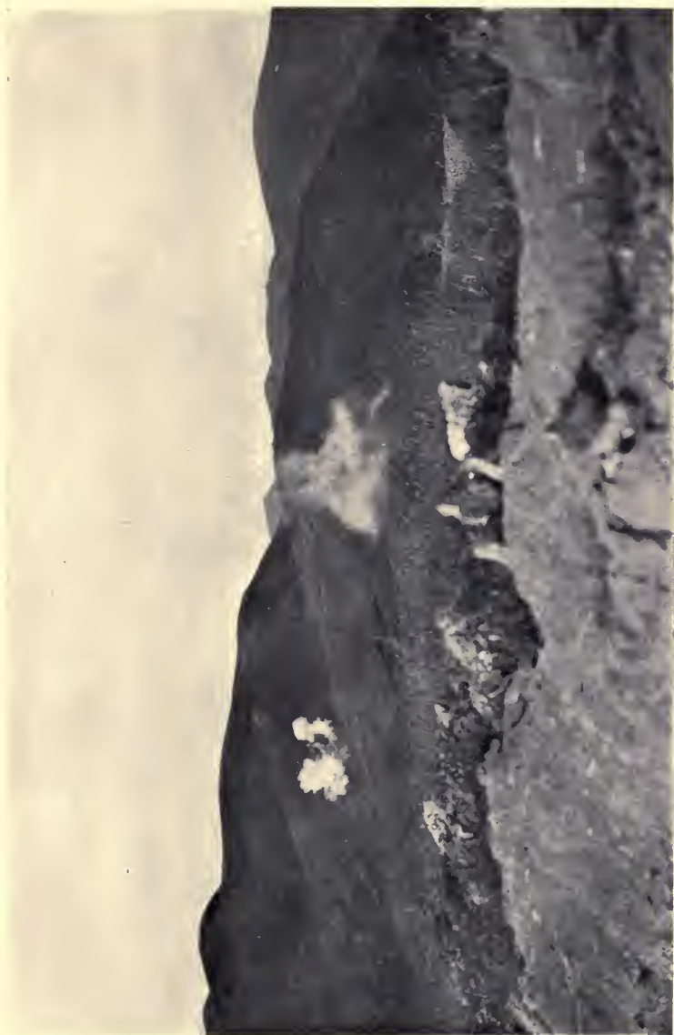
SHRAPNEL BURSTS OVER INFANTRY AT LIAOYANG