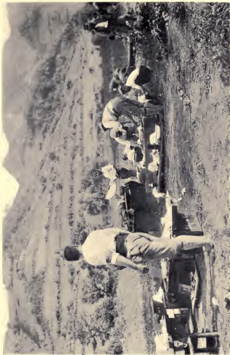
A FIELD DRESSING-STATION