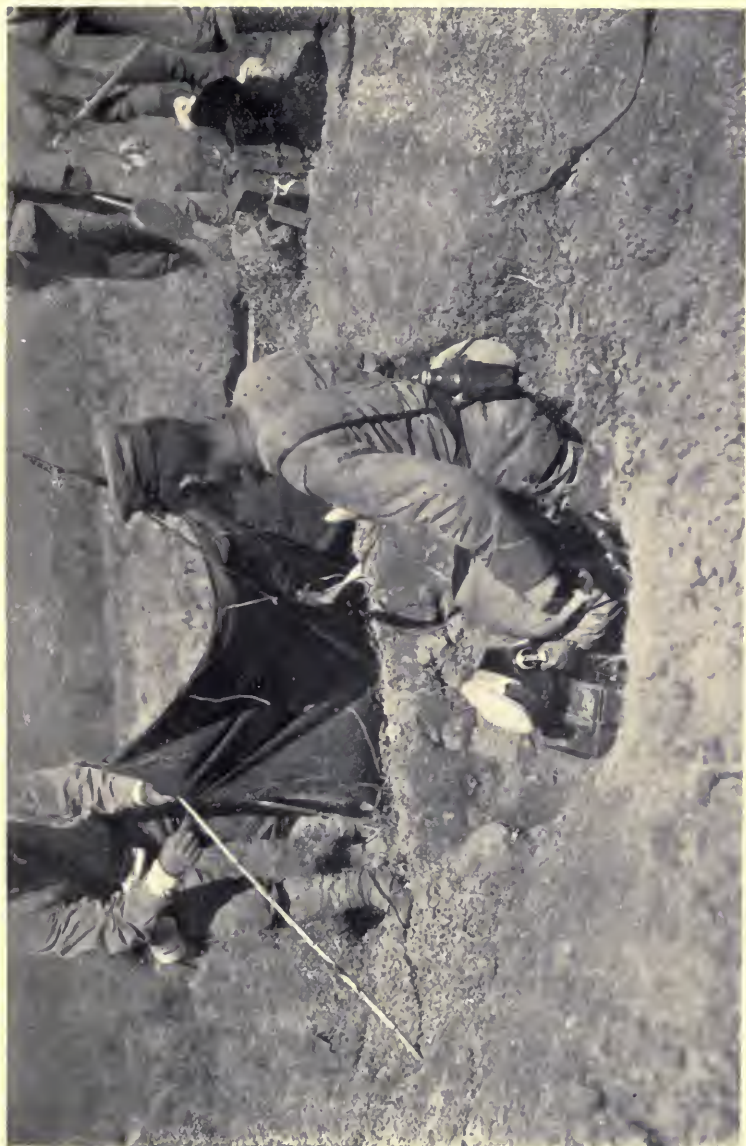
FIELD TELEPHONE BURIED TO PROTECT IT FROM FIRE