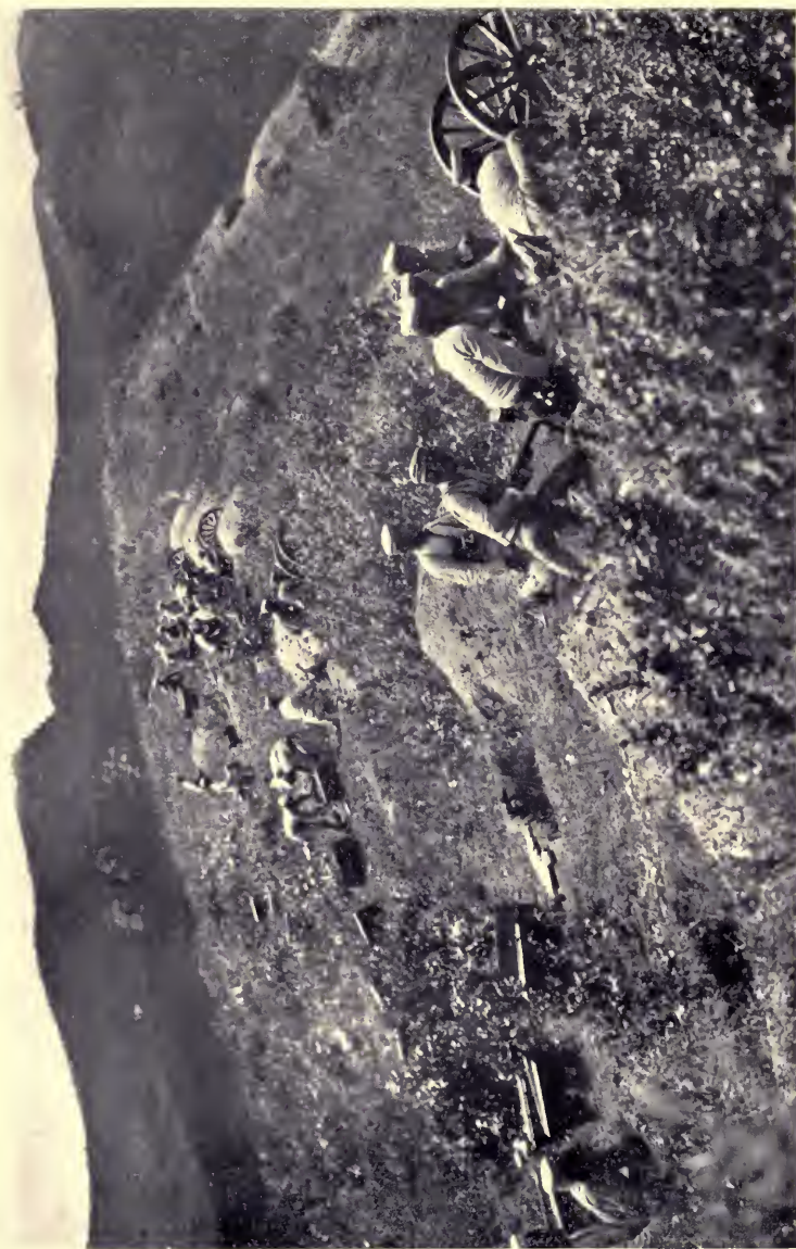
THE MOUNTAIN BATTERY IN ACTION ON AUGUST 26