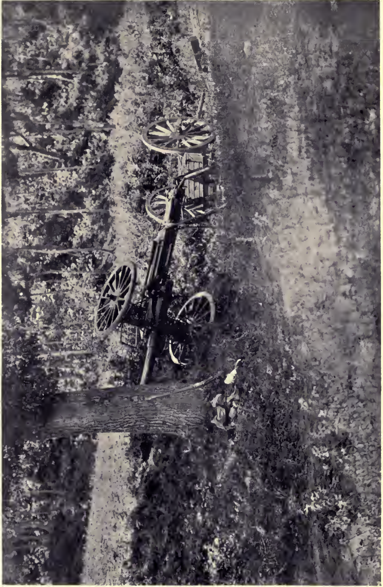
THE GUN OF THE WOODED HILL BATTERY THAT WAS UPSET IN FLIGHT