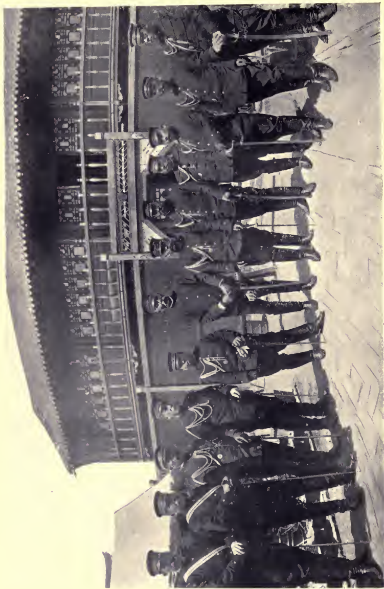
↑ GENERAL KUROKI AND HIS STAFF AT ANTUNG