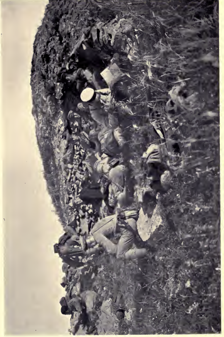
AN OUTPOST WAITING AND WATCHING