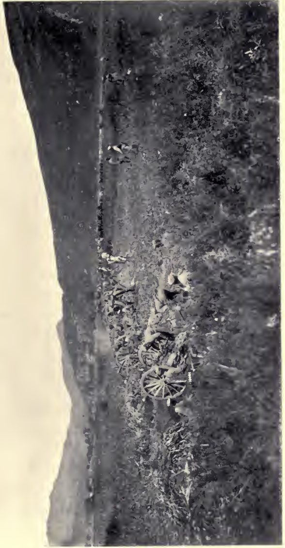
A JAPANESE BATTERY IN ACTION IN THE KOWLIANG