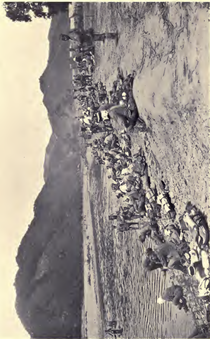
A NOONDAY REST ON THE MARCH