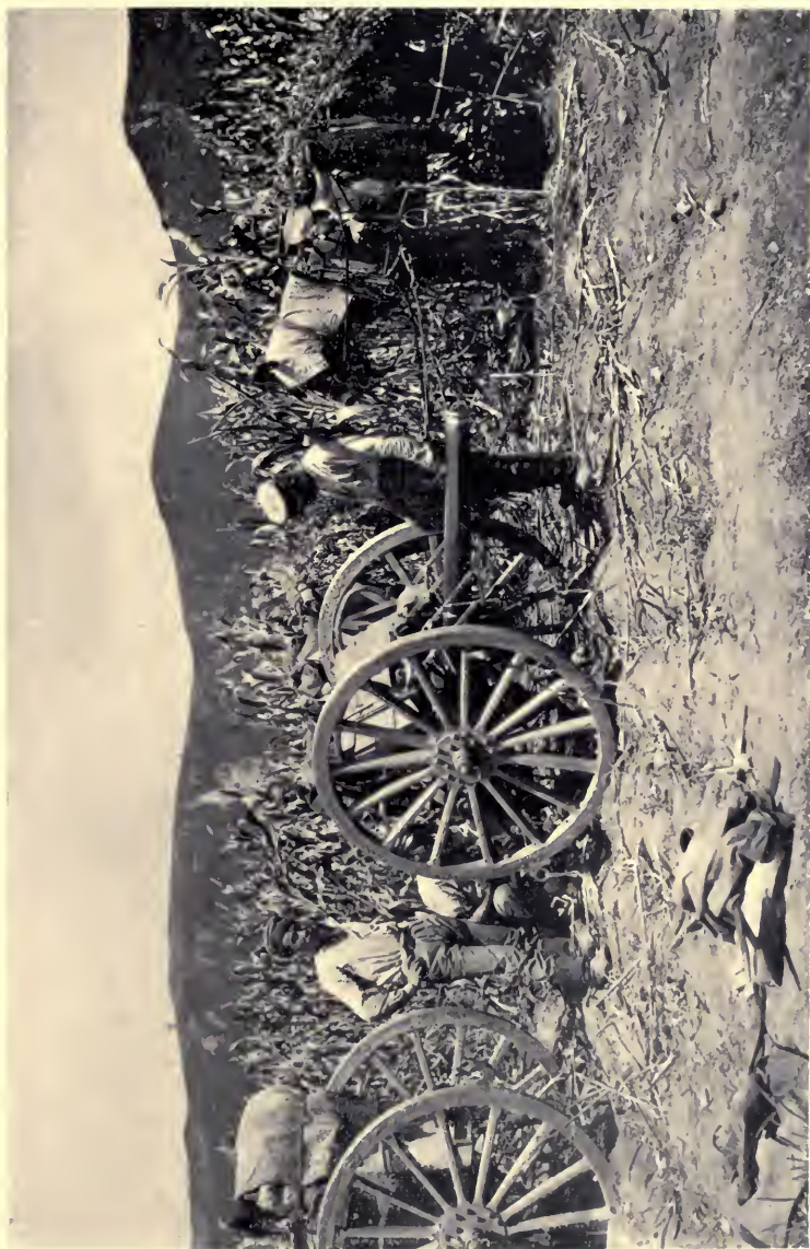
THE JAPANESE BATTERY CONCEALED IN KOWLIANG WHICH THE RUSSIANS COULD NOT LOCATE AT THE BATTLE OF TIENSUITEN