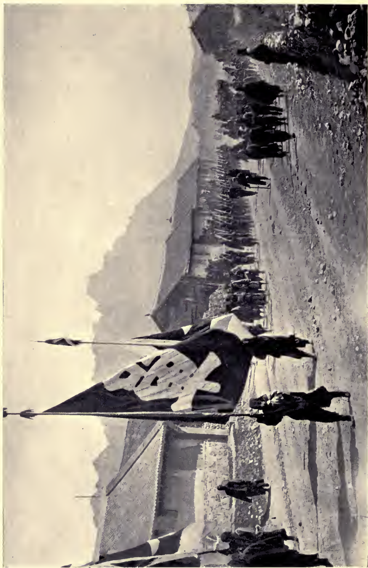
CHINESE GARRISON GOING OUT TO MEET GENERAL KUROKI ON HIS ARRIVAL AT FENG-WANG-CHENG