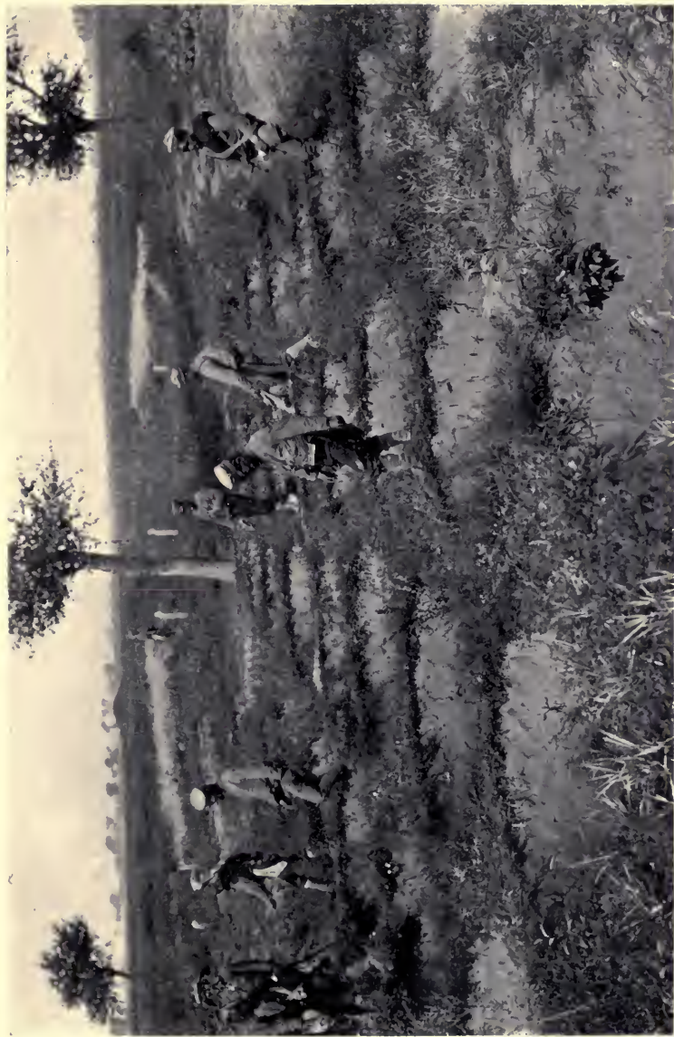
SEARCHING FOR DEAD AMONG THE PITS OF THE RUSSIAN MAIN LINE OF DEFENCE AT LIAOYANG