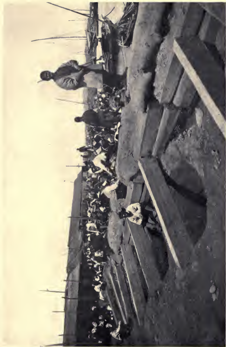
TRENCH BUILT BY RUSSIANS AT ANTUNG AND NEVER USED