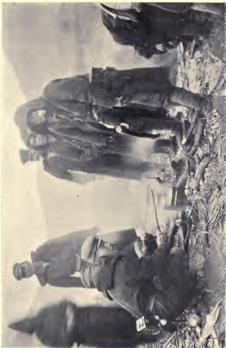
BOILING RICE IN RAIN, AFTERNOON, AUGUST 28