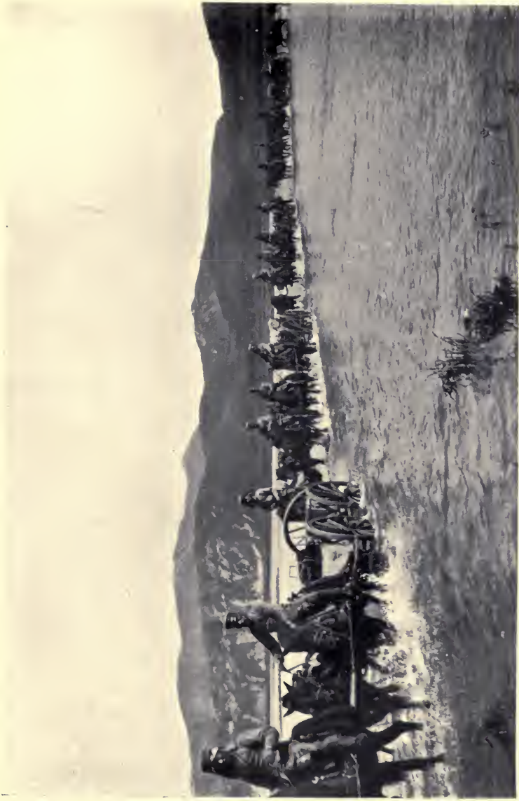
GUNS OF THE 2ND DIVISION CROSSING TANG RIVER