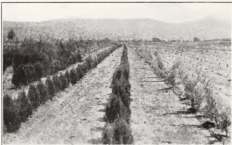
BIOTA AUREA NANA; JUNIPERUS VIRG. GLAUCA ON RIGHT