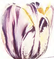
Rembrandt Tulip. A Distinct Novelty.