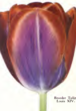
Breeder Tulip, Louis XIV.

Cultural directions included with all orders. Success is practically assured.