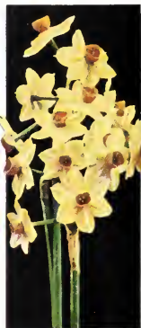
Soleil d'Or, (Yellow Blossom).

Bermuda Buttercup Oxalis. Bright buttercup-yellow. 6 for 25c; 12 for 40c; 100 for $2.50.