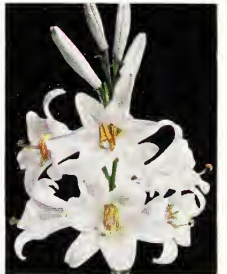
Candidum (Madonna Lily).