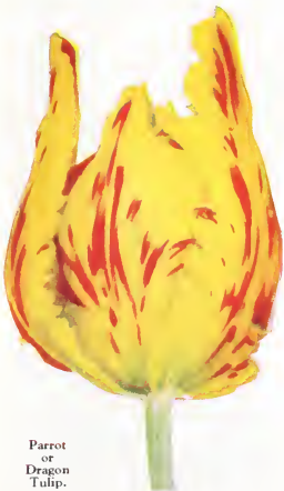
Parrot or Dragon Tulip.

Cultural directions included with all orders. Success is practically assured.