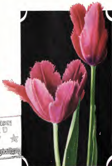
Novelty Tulip, "Sundew."

The varieties listed in this catalog are the best to be obtained. We deliver to your door by messenger or mail.