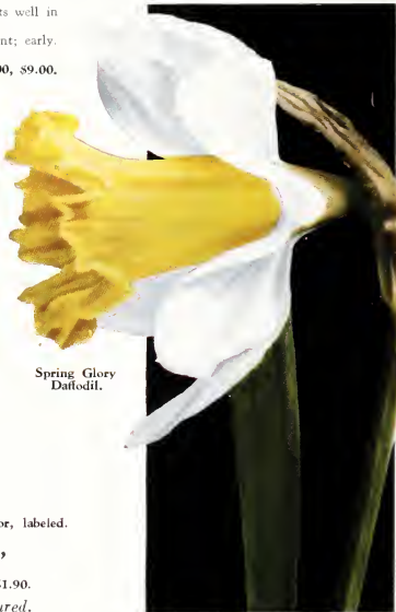
Spring Glory Daffodil.

Von Sion, Double. The common old-fashioned double yellow Daffodils; always liked. Each, 10c; per doz., $1.00; per 100, $7.00.