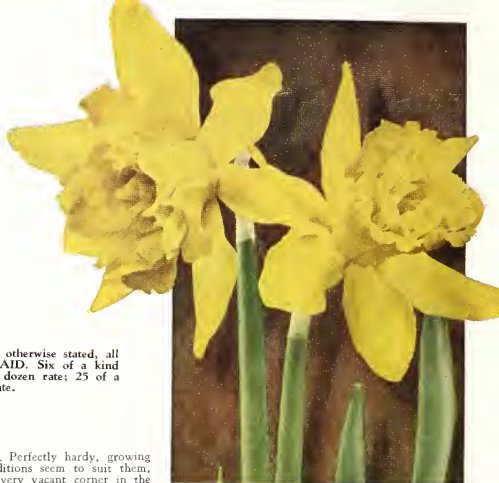
Von Sion, Double.

Mixed Narcissus A splendid assortment for outdoor culture, containing many kinds, largely Trumpets. You will be pleased. Each, 10c; per doz., 85c; per 100, $6.00.