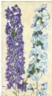
Delphinium, Bellasouna and Belladonna.

Cultural directions included with all orders. Success is practically assured.