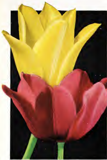
Inglescombe Yellow. Gesneriana Spathulata Major. (Listed under Darwin Tulips).