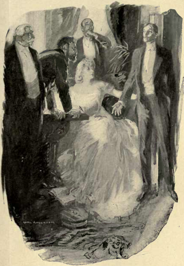
"A DEATHLIKE SILENCE FOLLOWED THE DELEGATO'S WORDS"