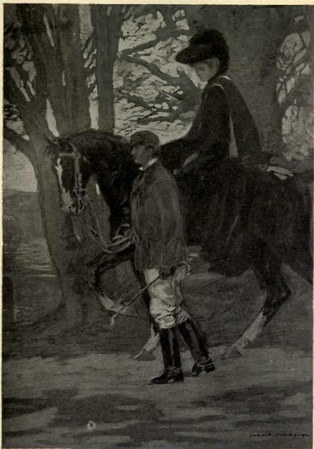
“ FAY NOTICED FOR THE FIRST TIME HOW LIGHTLY WENTWORTH WALKED, HOW SQUARE HIS SHOULDERS WERE ”