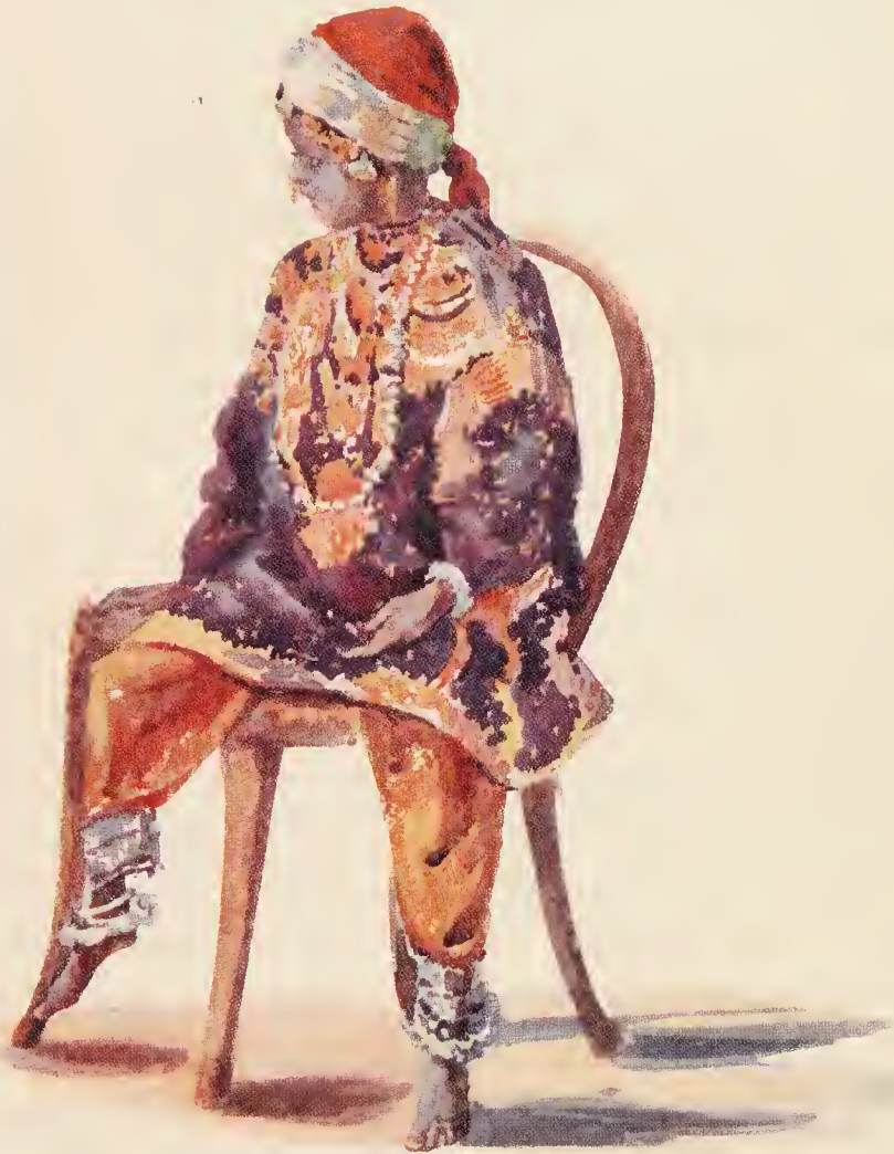
A MUHAMMADAN GIRL