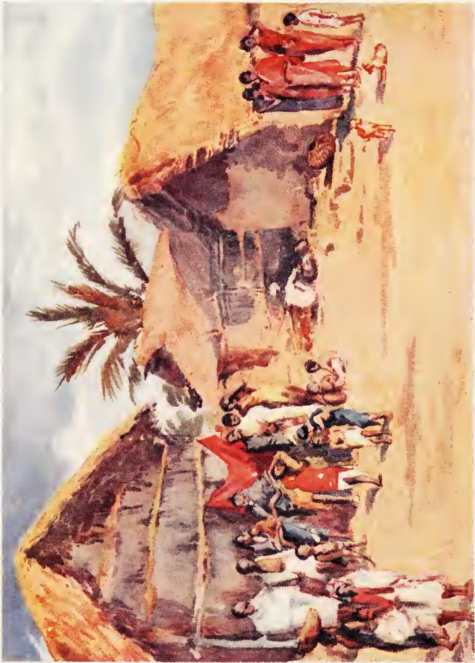
A VILLAGE SCENE IN KALBUNDIPORE, MYSORE, INHABITED BY CANARESE

It is typical of the hamlet or small village throughout the south of India. The houses are built of mud and thatched with dried palm leaf.