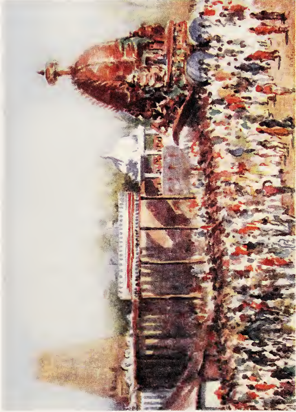
THE CAR FESTIVAL AT THE HINDU TEMPLE OF MYLAPORE

The car is drawn along the road by enthusiastic worshippers who thus acquire merit and escape the consequences of their wrong-doing.