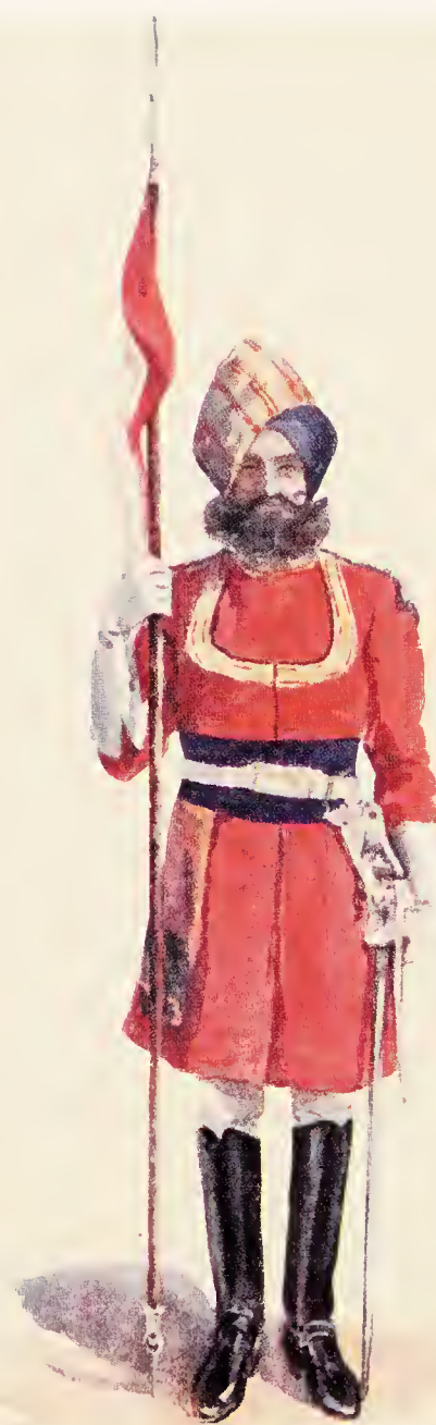
A TROOPER OF THE GOVERNOR'S BODYGUARD A fine corps of picked men drafted from other regiments of native cavalry.