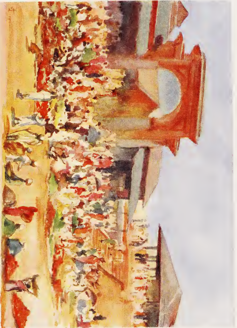
THE VEGETABLE MARKET AT OOTACAMUND

It is locally known as the "Shandy." The display is chiefly tomatoes, greens, oranges, carrots, etc.