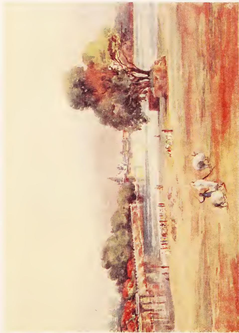
A TANK IN MYSORE WITH THE MAHARAJAH'S PALACE IN THE DISTANCE

The donkeys carry loads of soiled linen to be washed. The trees are preserved by masonry embankments because they are sacred to some demon, worshipped once a year or in times of scarcity or sickness by the village people.