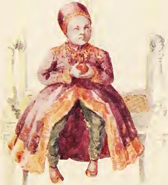
MUHAMMADAN CHILD OF NOBLE BIRTH IN GOLD EMBROIDERED COAT Round the neck are several handsome jewelled necklaces.