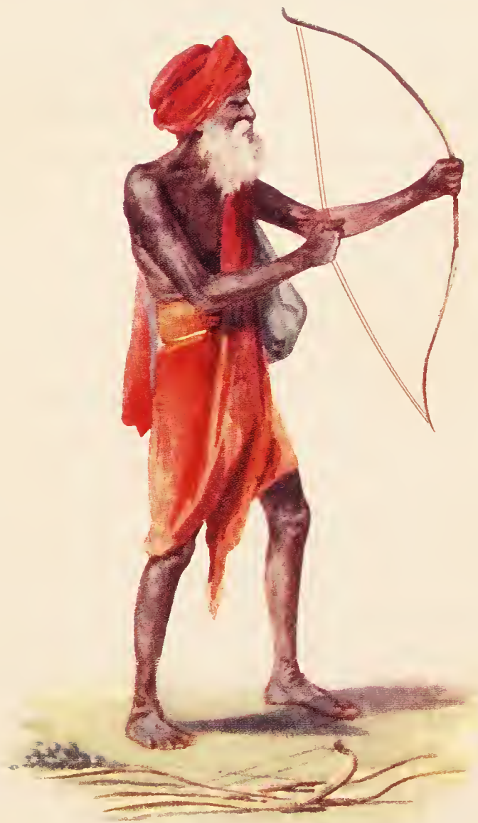
A HINDU, PROBABLY OF THE BIRD - TRAPPER TRIBE

He is a well-known figure in Madras where he sells bows and clay balls, used by servants to shoot at thieving crows in the verandahs. His bow has a double string. The pellet is in his closed hand ready to be discharged.