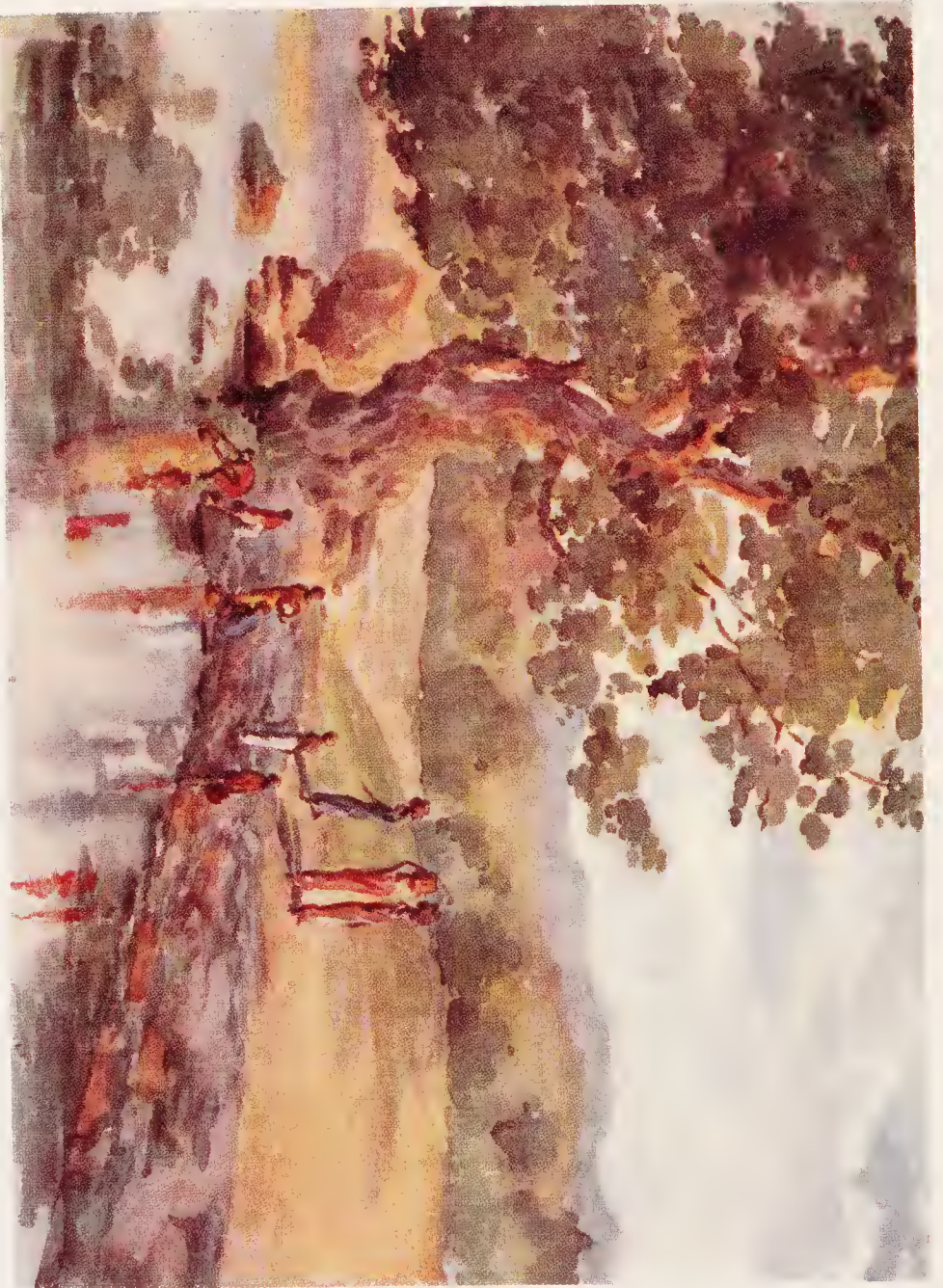
A TANK IN MYSORE WITH CANNARESE WOMEN DRAWING WATER

The hills in the distance are covered with thick, impenetrable jungle. The open plateau land is fertile and is cultivated or used as pasture.