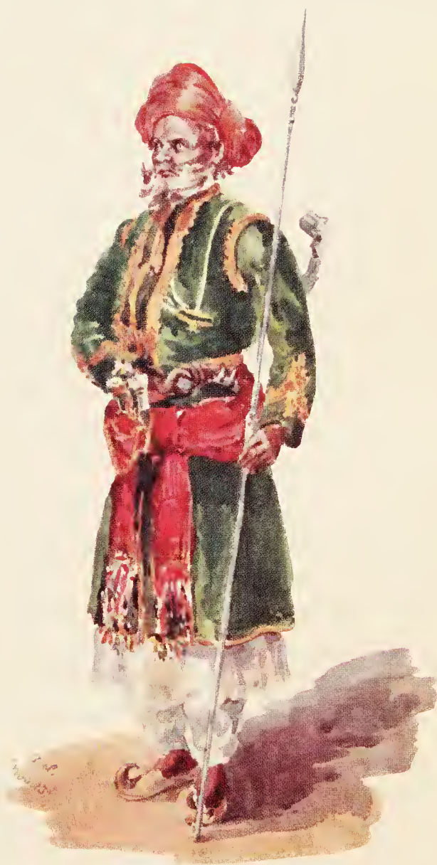
A MUHAMMADAN OFFICER OF THE ARAB GUARD OF HIS HIGHNESS THE NIZAM OF HYDERABAD