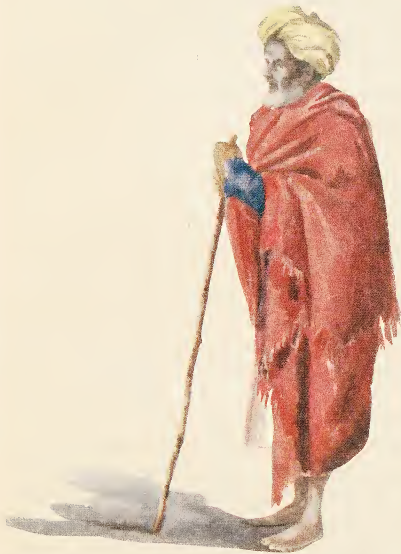
A HINDU PARIAH BEGGAR He is too old to work or follow any trade.