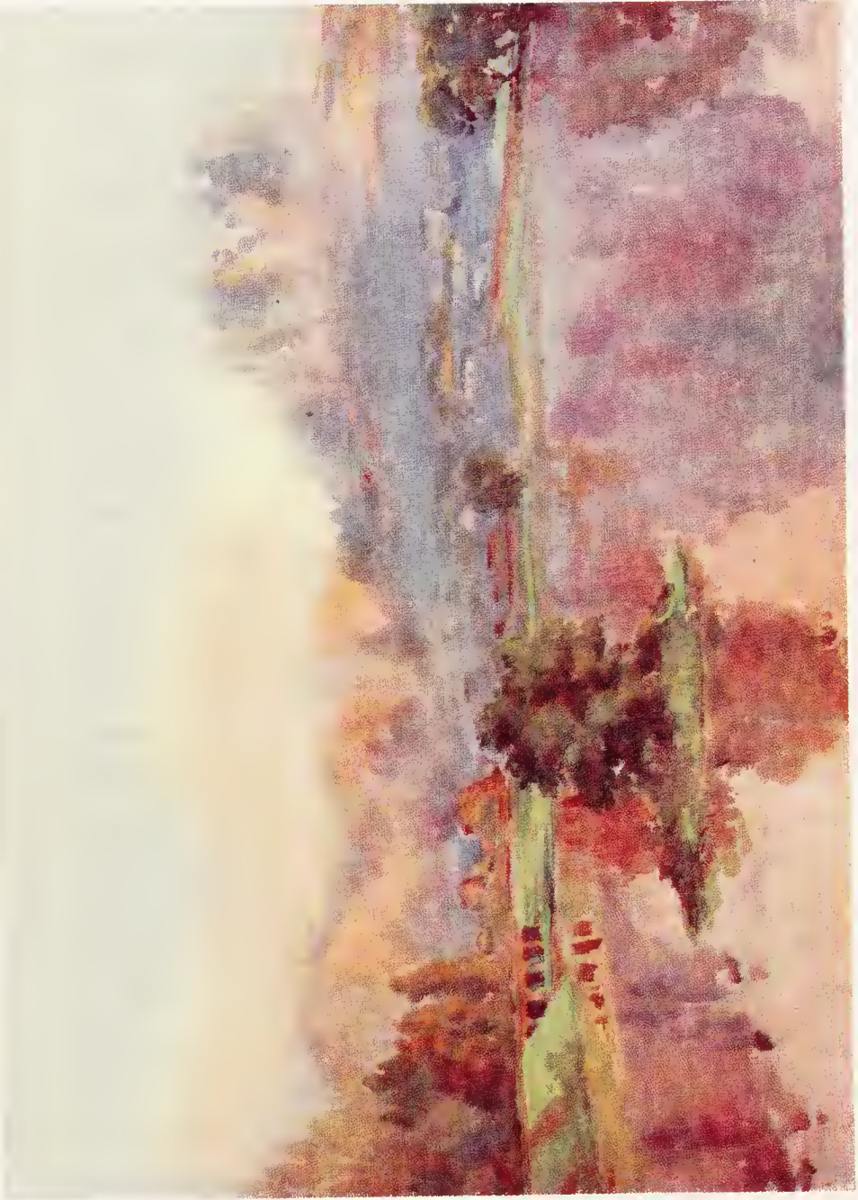
EARLY MORNING ON THE LAKE, OOTACAMUND, WITH MIST RISING