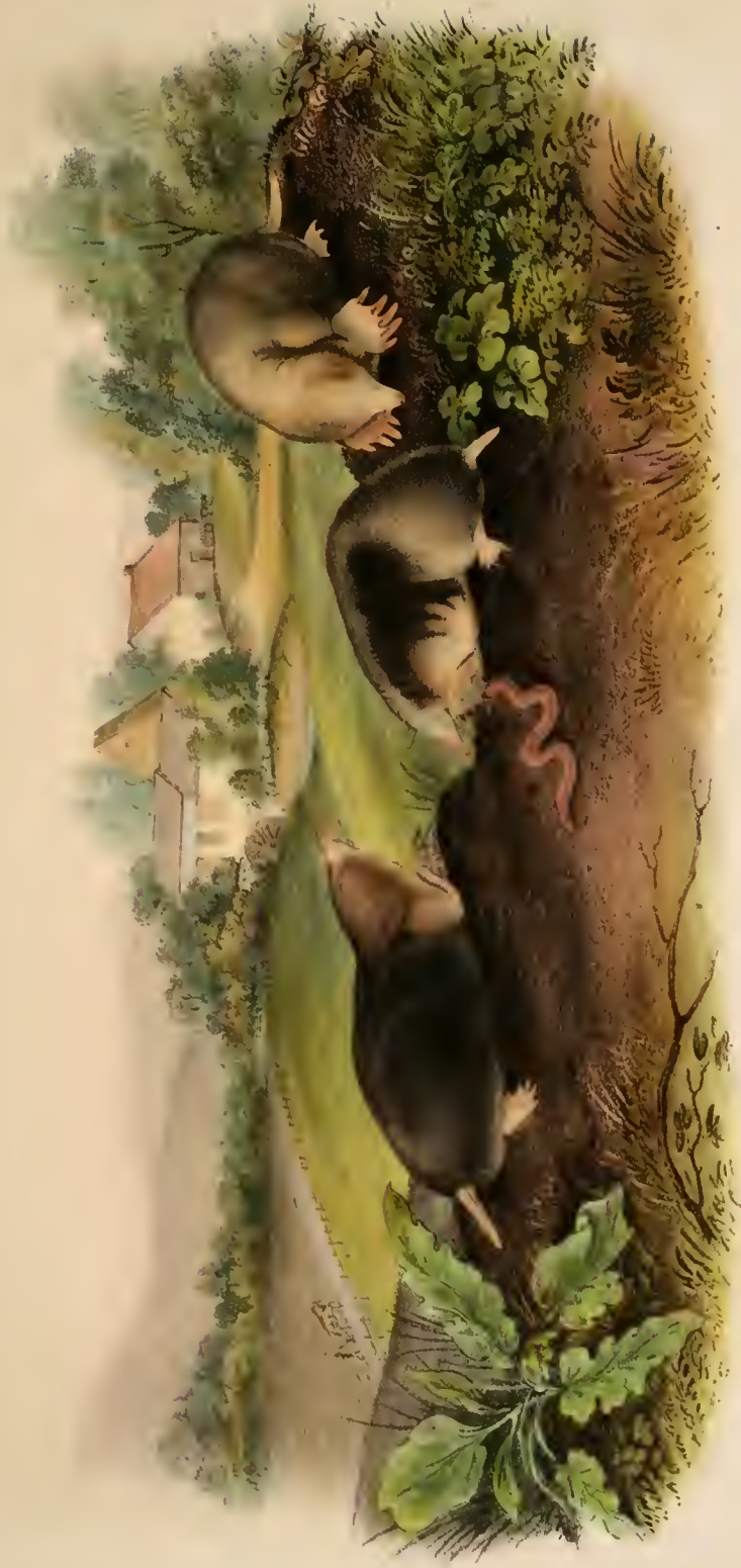
Common American Shrew Mole Mole 8 female.