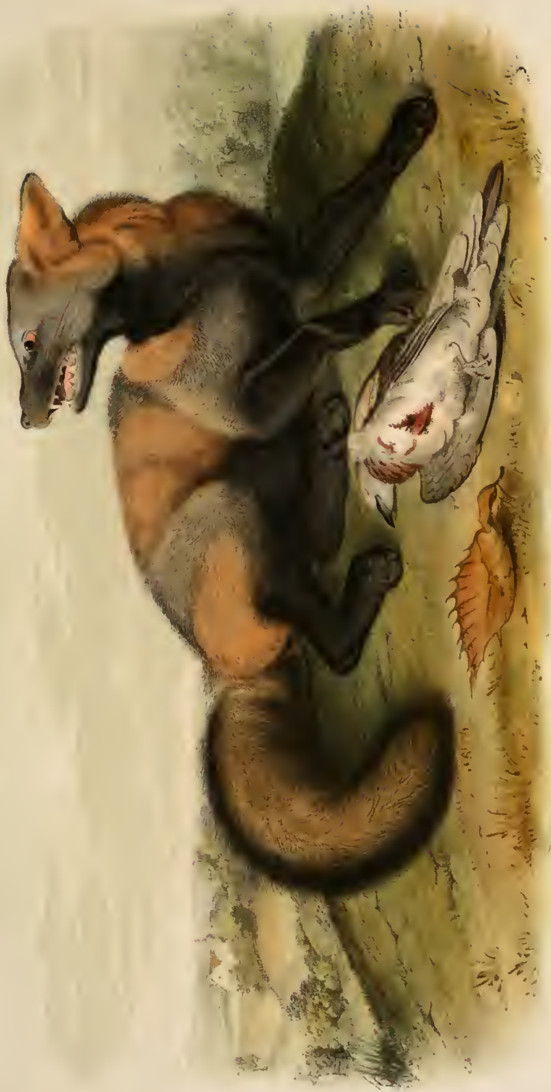
Canis vulpes (L.)