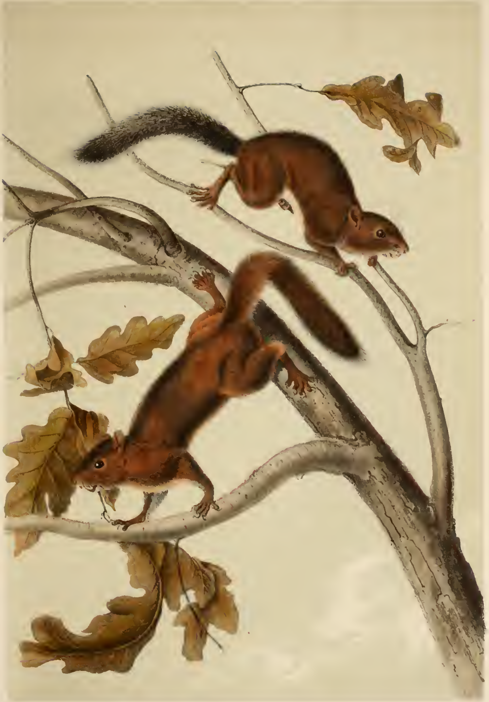
Soft haired Squirrel.

Drawn in Nature by J. Audubon F.R.S.P.L.S.