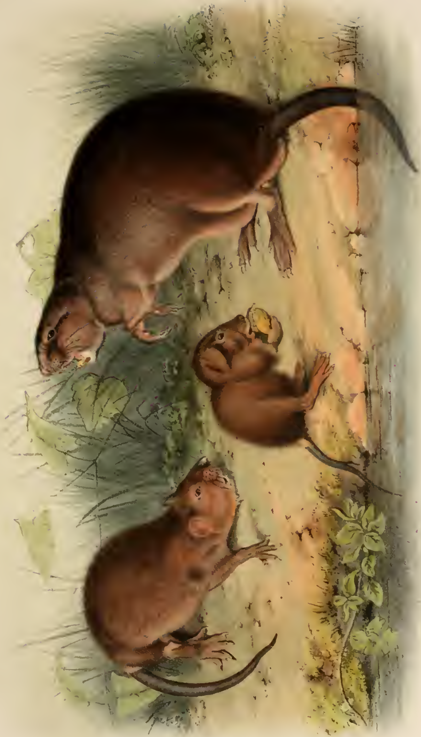
Musquash - Musquash Old & Young

Drawn from Nature by J. Audubon F.R.S. F.L.S. Engraved by Stone & Tremblay