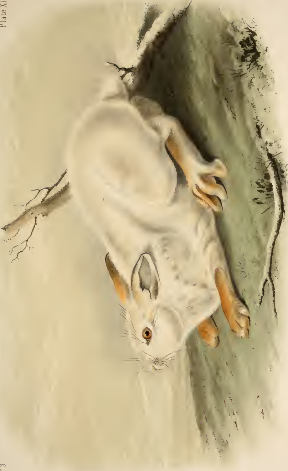
Cottontail Rabbit Winter pelage.

Drawer: Illustration by J. J. Audubon, F.R.S., F.L.S. Drawn on Stone by R. T. Cooper