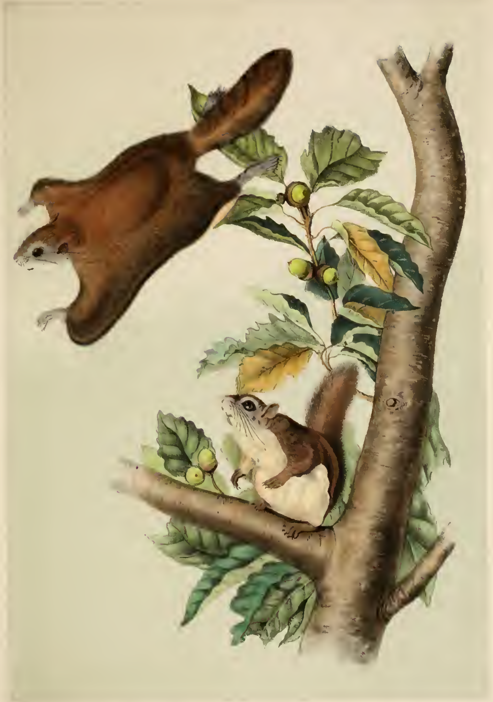
Oregon Flying Squirrel.