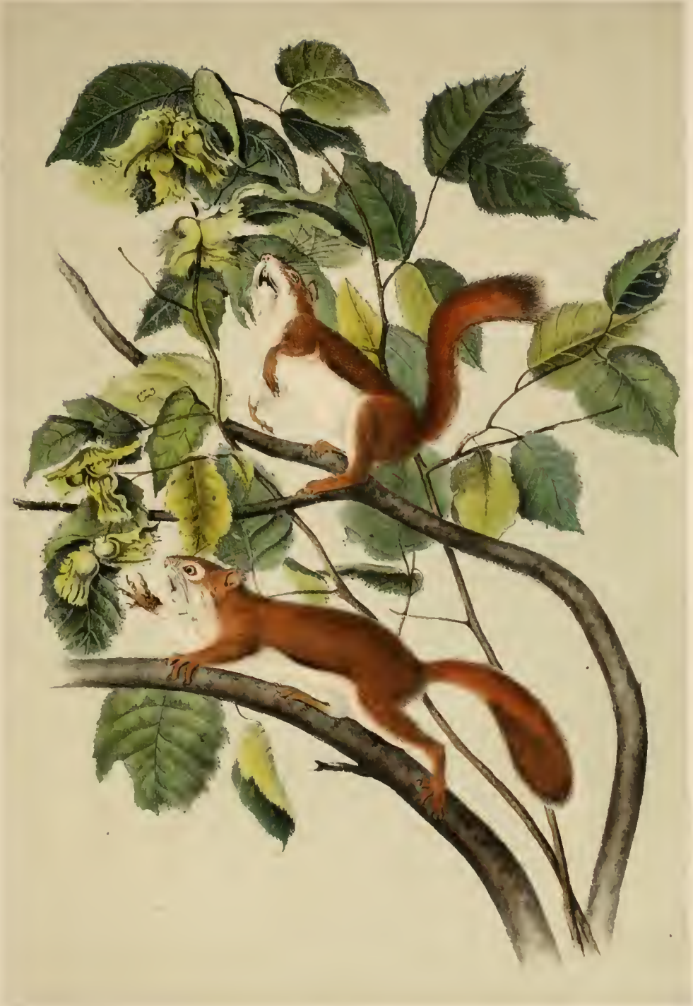
Hudson's Bay Squirrel - Chickara - Red Squirrel.