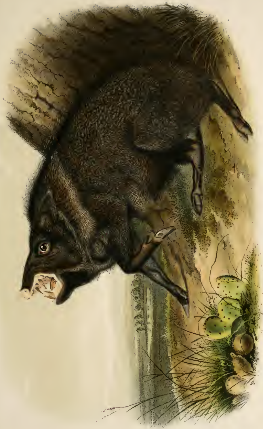
Drawn on Stone by B. Trembly