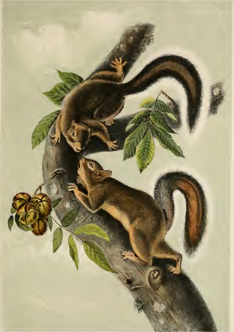
Drawn on stone by W.F. Hitchcock