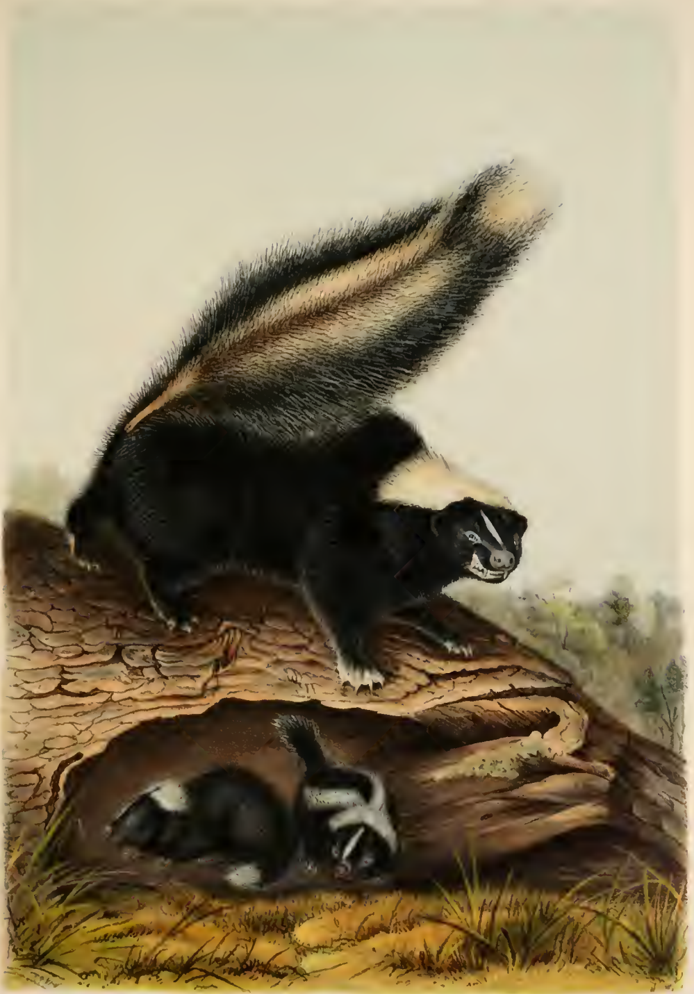
Common American Skunk