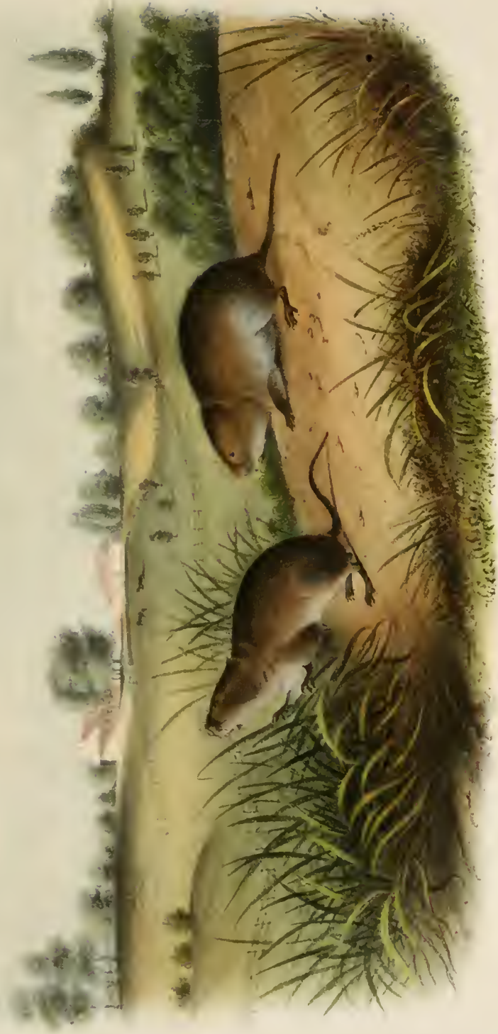
Wilson's Beavers. House?