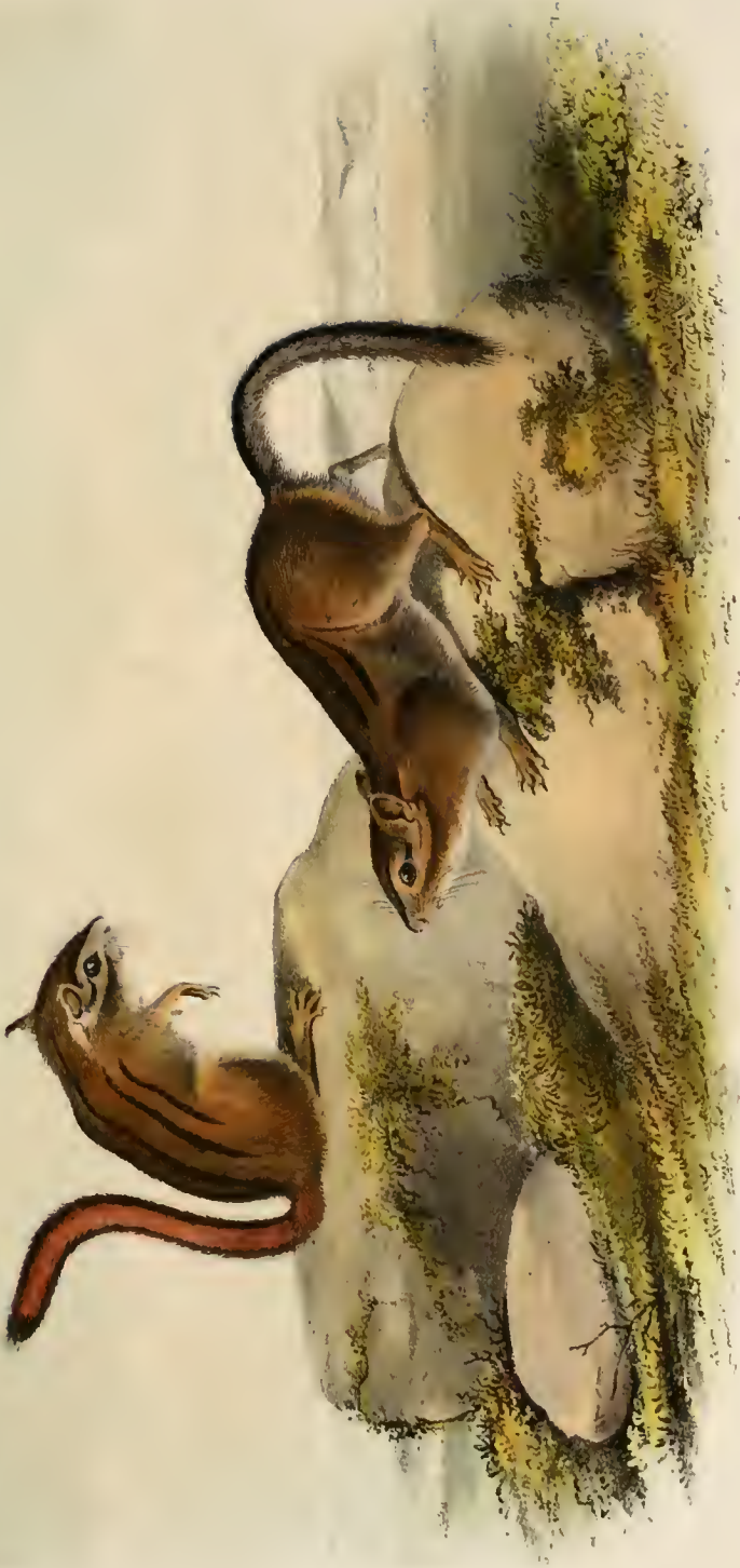
Townsend's Ground Squirrel.

Drawn from Nature by F. J. Audubon, F.R.S. F.L.S.