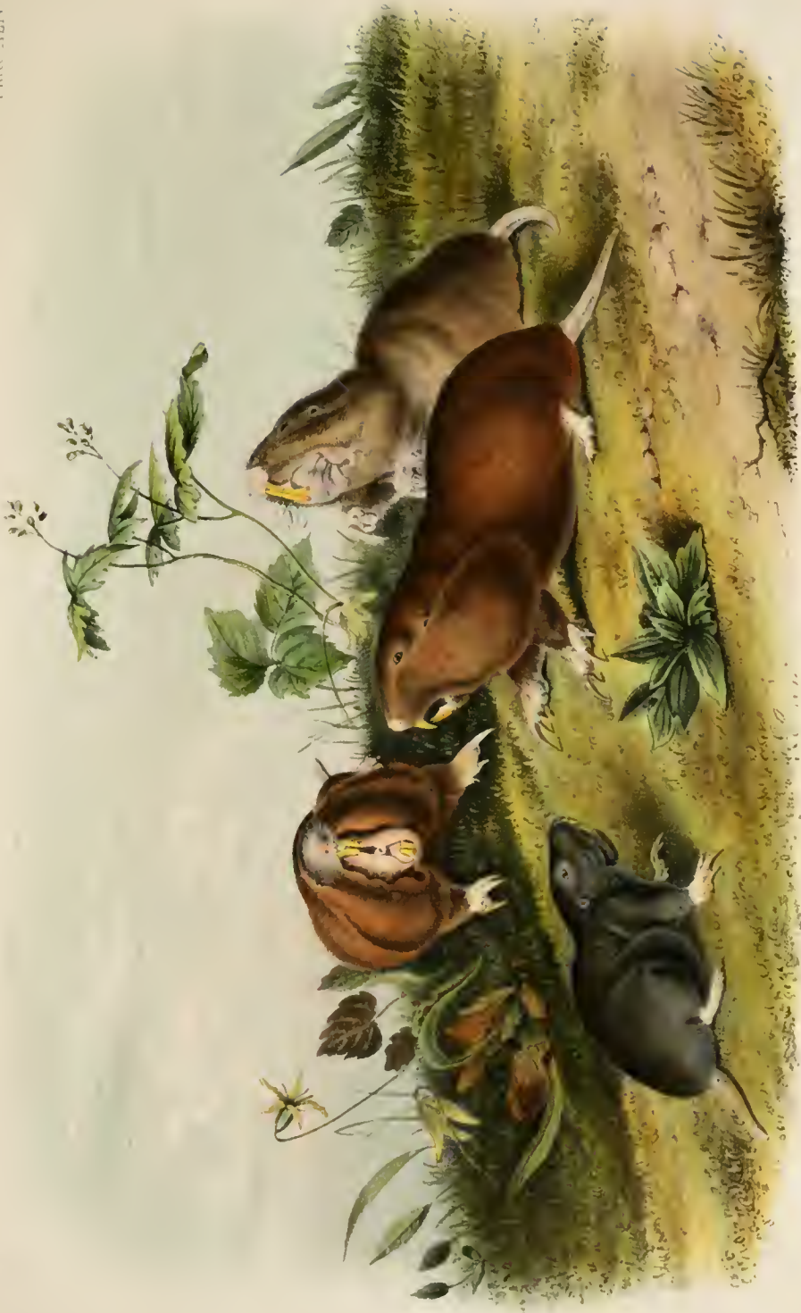
Canada Scaup Beaver