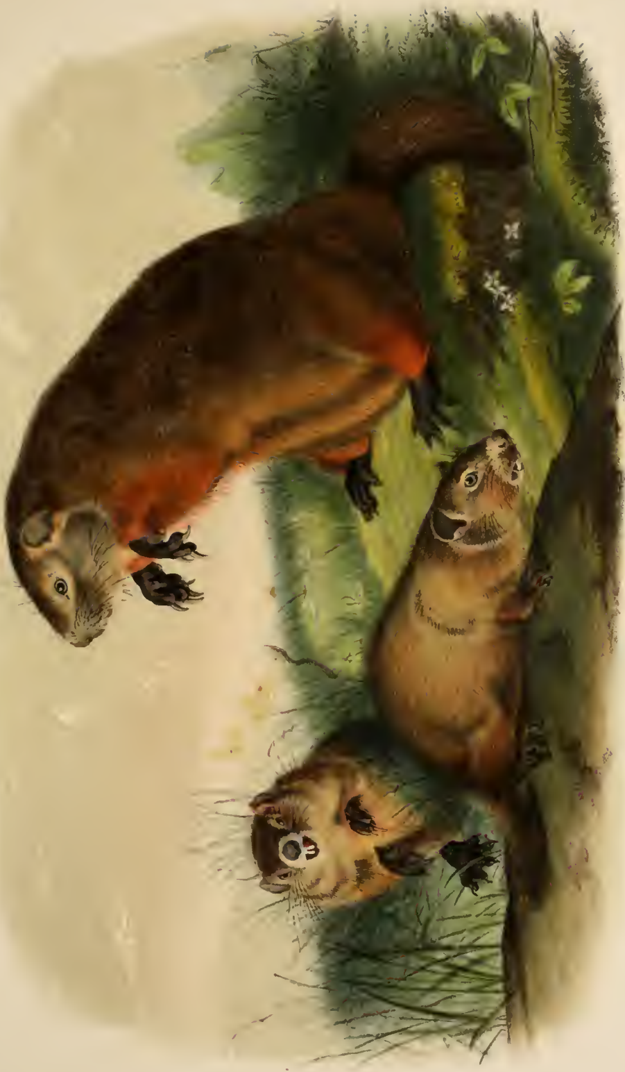
C. Maryland. Names: Woodcock, Groundhog