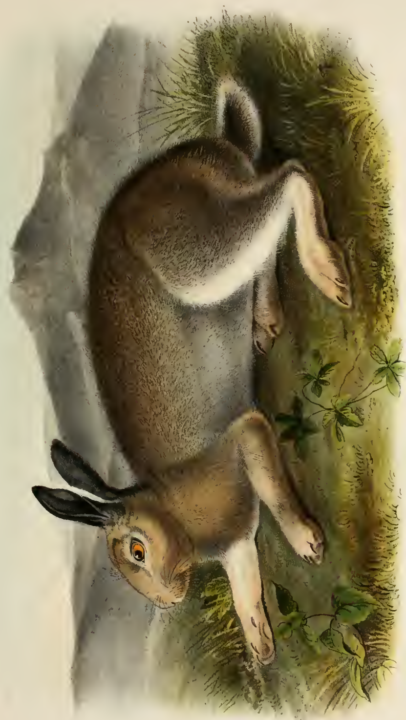
Painted by H. Trumbull