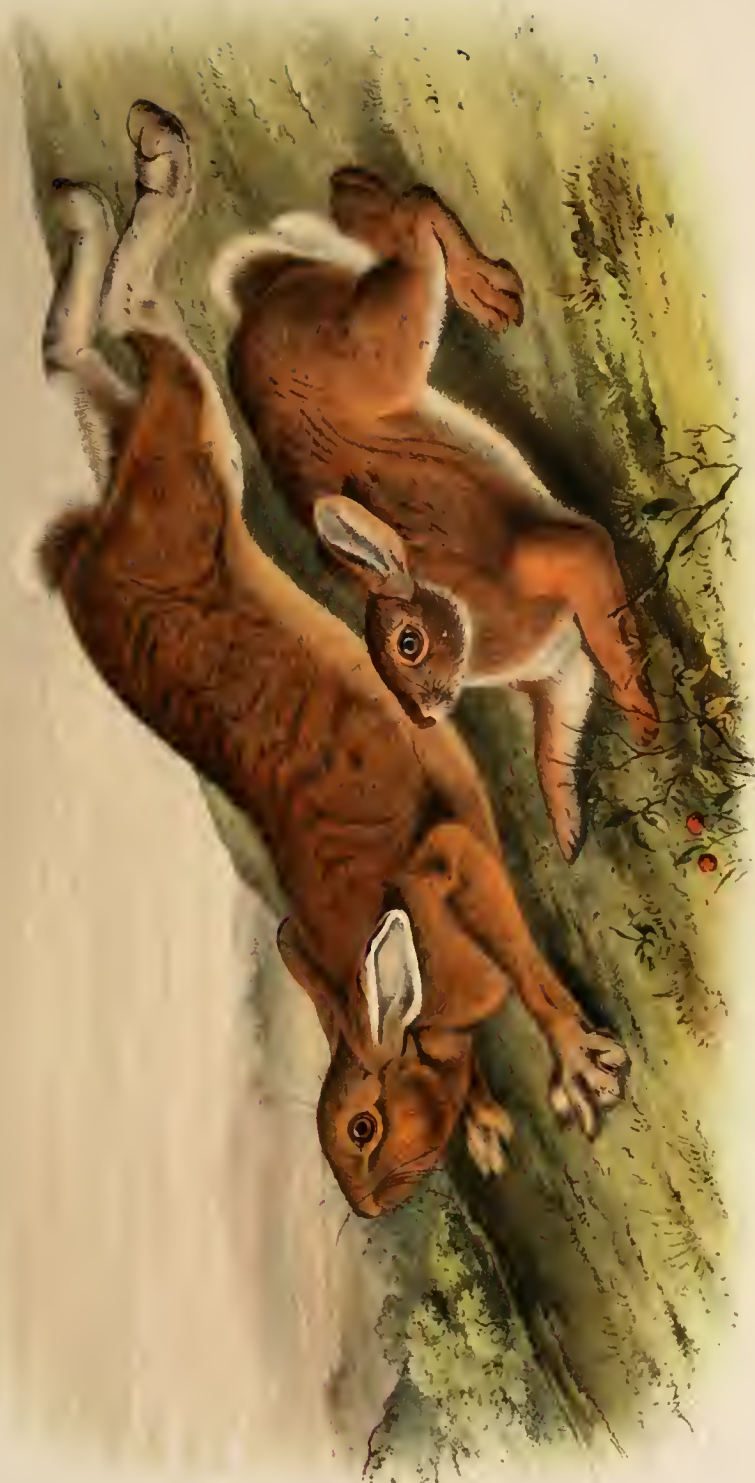
Northern Hare - 1 Ad. & Young