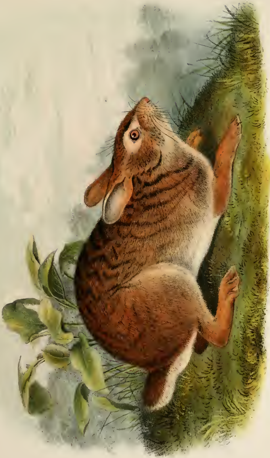
Lepus sylvaticus , Temmly