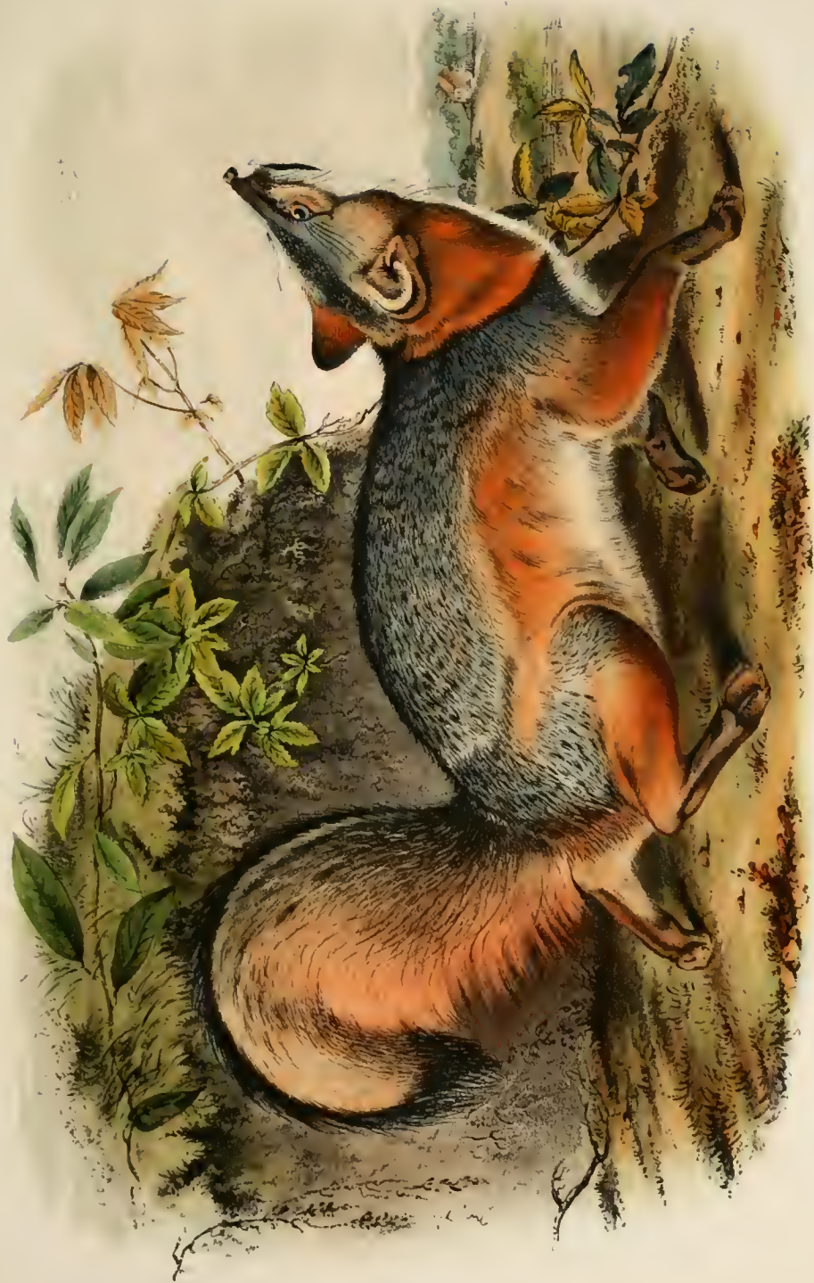
Gray Fox . Male.