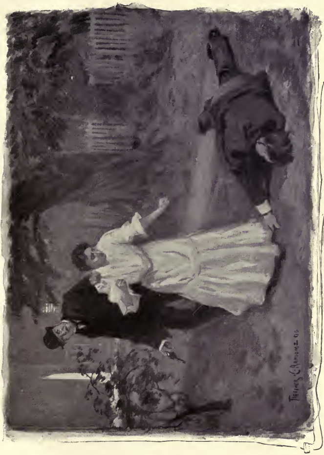
“Fell, face downward, with his hands clasping the edge of her dress.”