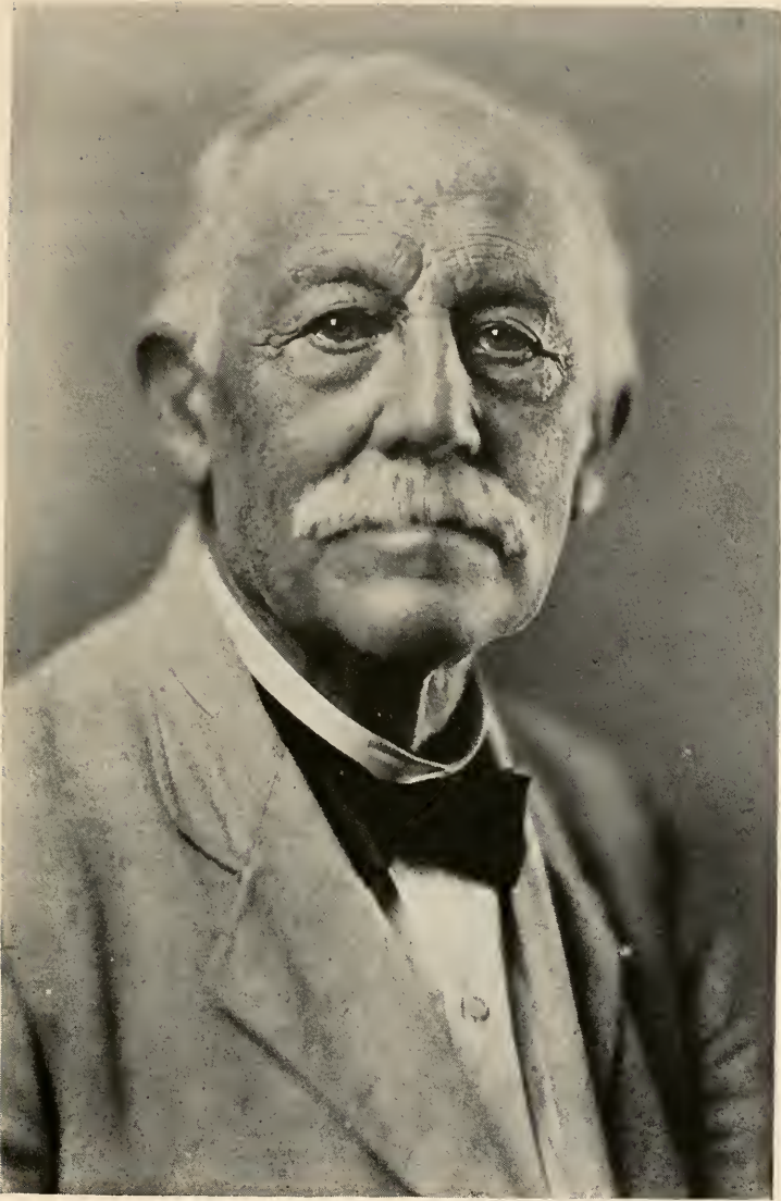
DR. GEORGE TYRON HARDING

Father of Warren G. Harding. Dr. Harding was seventy-six years old on the day his son was nominated for President