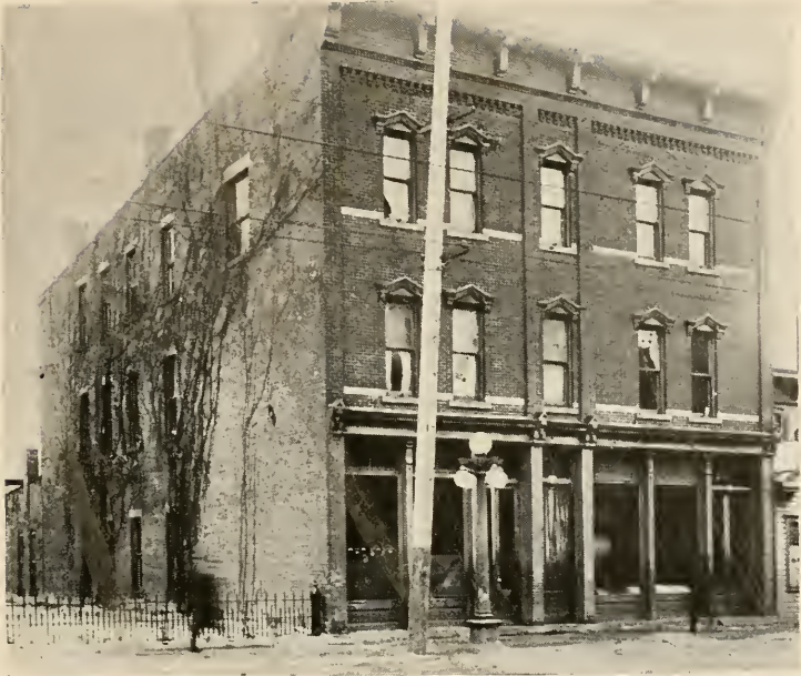
OFFICE BUILDING OF THE MARION "STAR"