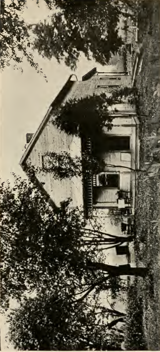
SITE OF THE BIRTHPLACE OF WARREN G. HARDING (Election day is his birthday)