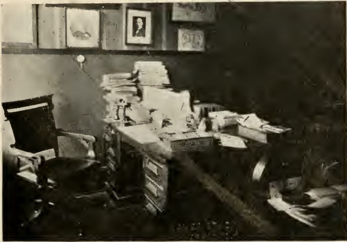
EDITORIAL DESK AT WHICH WARREN G. HARDING WORKED