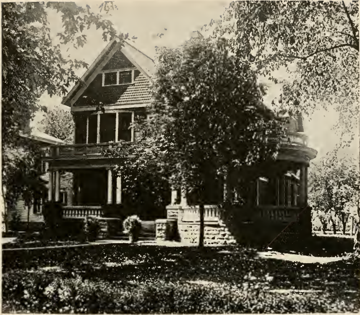
RESIDENCE OF WARREN G. HARDING AT MARION, OHIO