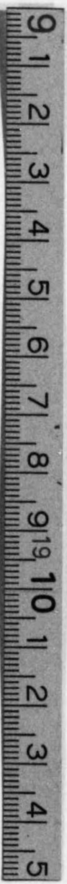
第二十六表 (自小作農) 勞働時間及勞働日數