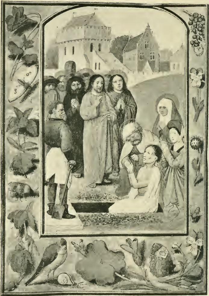
HOURS OF THE VIRGIN.