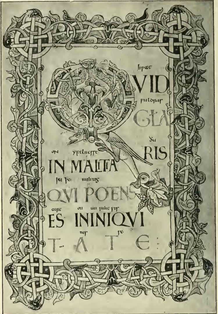
LATIN PSALTER, WITH ENGLISH GLOSS.