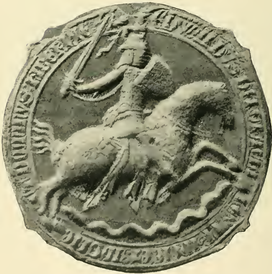
GREAT SEAL OF EDWARD III.