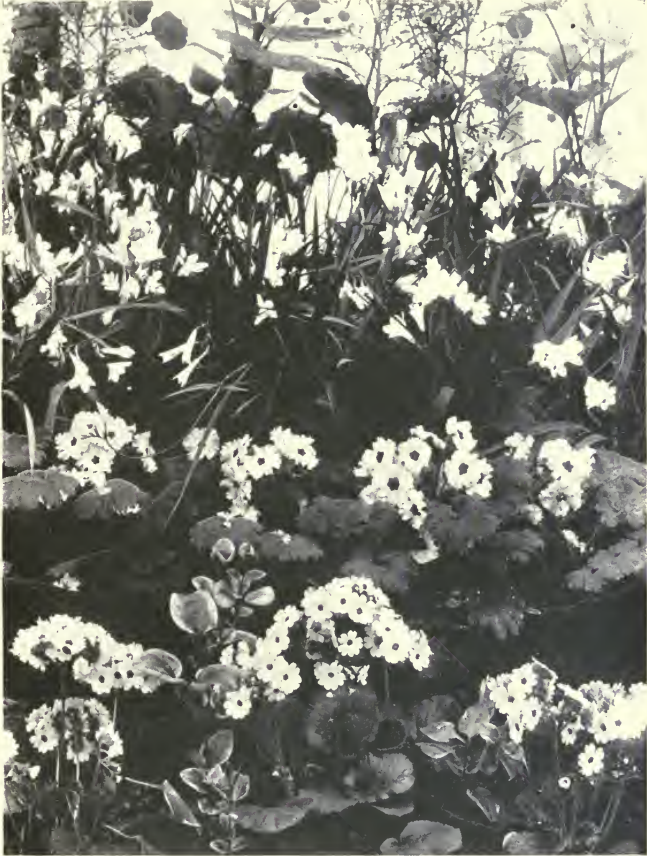
PRIMROSES, PRIMULAS, AND FREESIAS