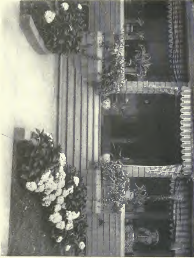
AN ATTRACTIVE PORCH