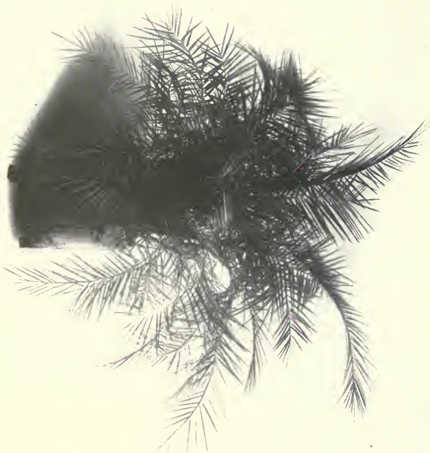
PALM ( Phoenix Reclinata )