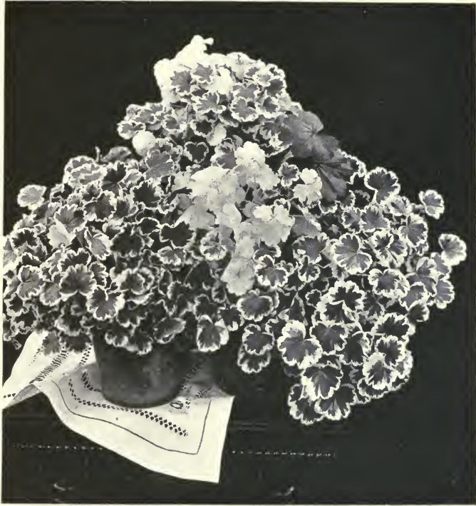
MADAM SALLEROI GERANIUM