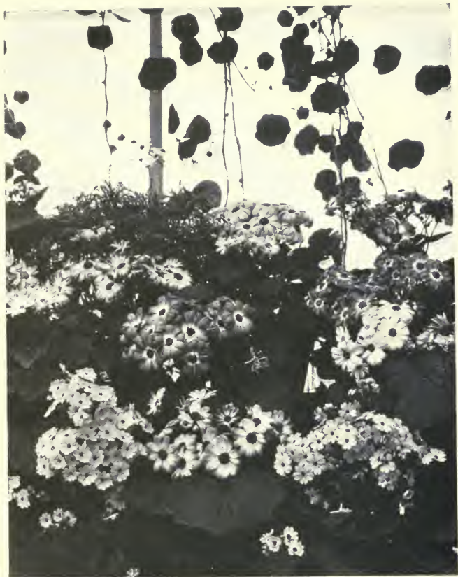
CINERARIAS AND PRIMULAS