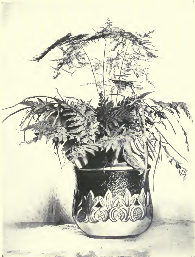
FERNS AND ASPARAGUS