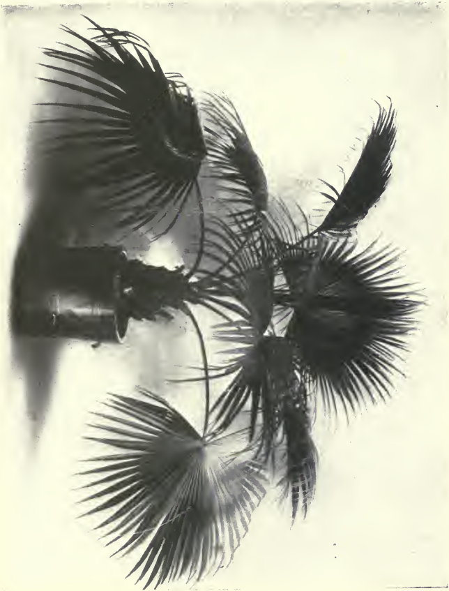
FAN PALM ( Latania Borbonica )