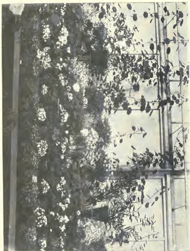
AN ATTRACTIVE WINDOW