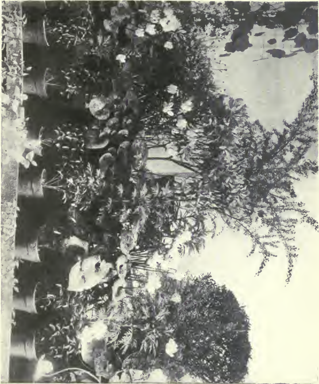
A PLEASING WINDOW ARRANGEMENT