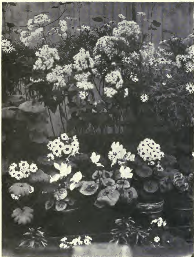
CHINESE PRIMROSES, CYCLAMENS, AND STEVIA