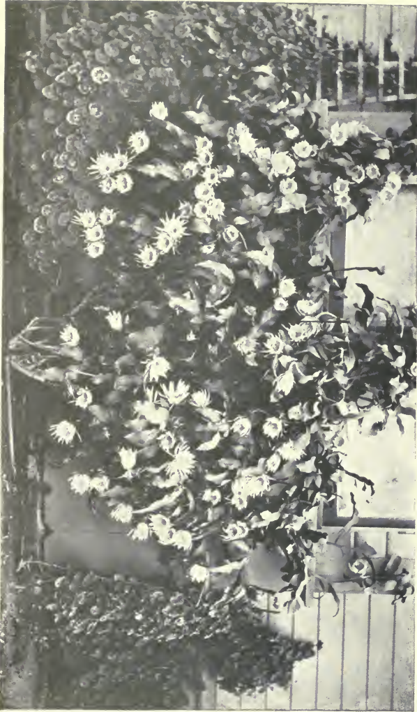
CACTUS ( Phyllocactus )