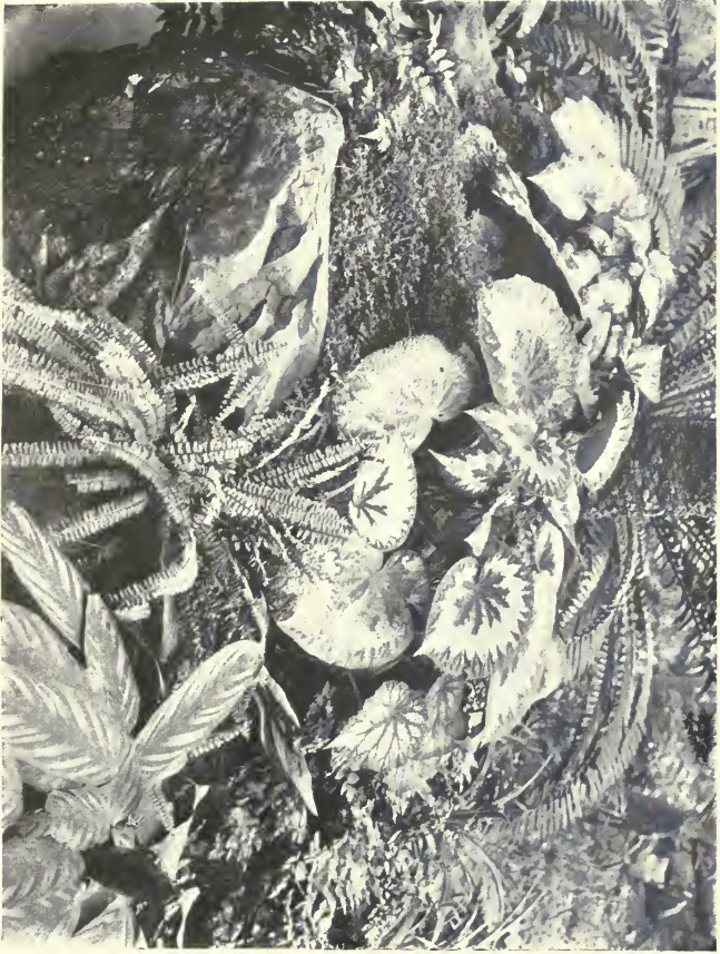
REN BEGONIAS AND FERNS