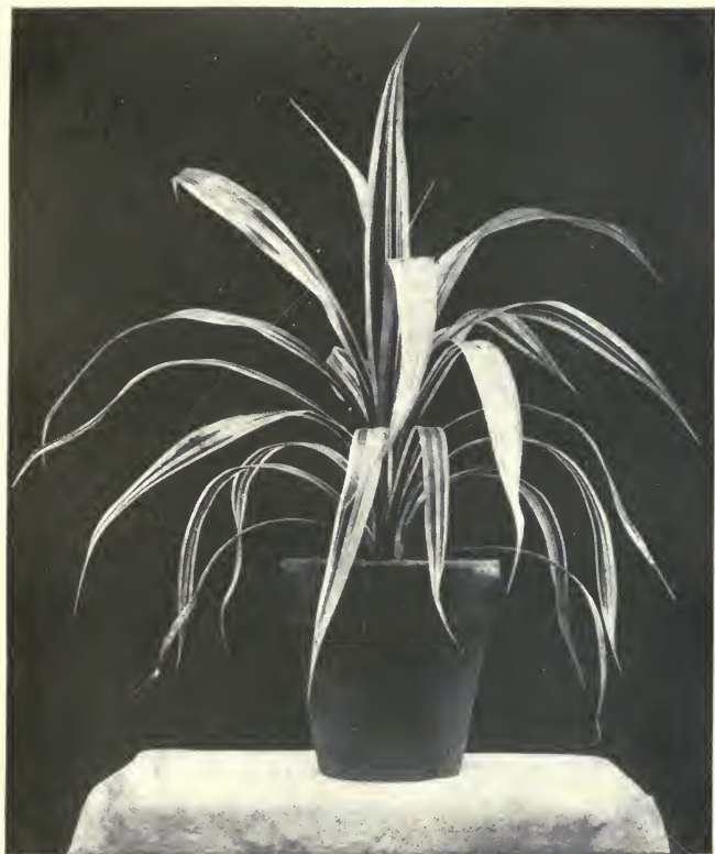
SCREW PINE (Pandanus Vietchii)