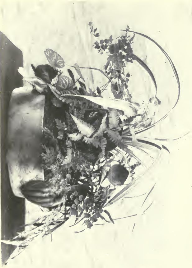
TABLE DECORATION OF GROWING PLANTS