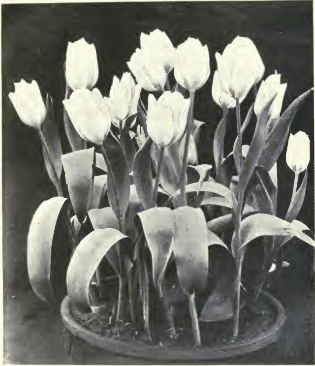
EARLY TULIPS IN POT