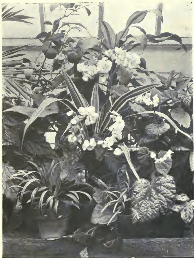
BEGONIAS AND FOLIAGE PLANTS