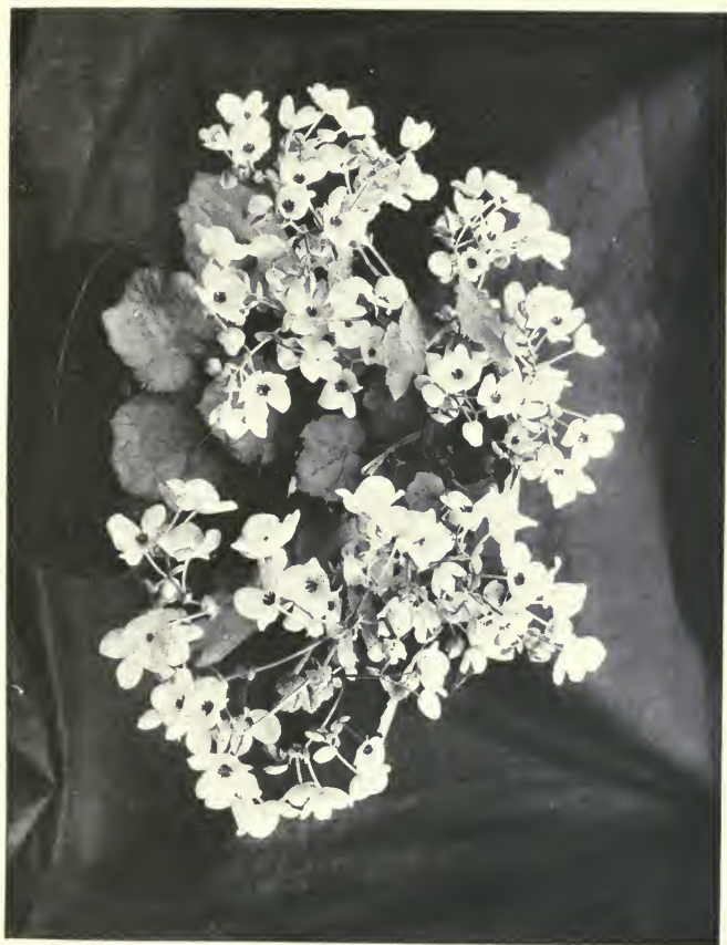
BEGONIA CLOIRE DE LORRAINE