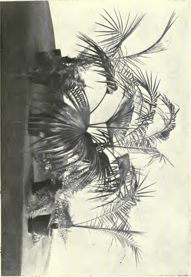
PALMS AND FERNS