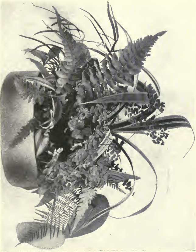
FERNS AND PANDANTUS FOR TABLE USE.