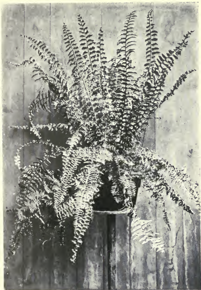
BOSTON FERN ( Nephrolepis Bostoniensis )