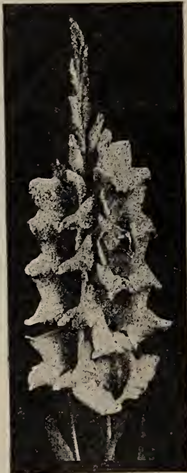
Mrs. Frank Pendleton

The most popular of summer blooming flowers on account of the beautiful color and shadings that ornate the delicately formed blossom and because of the unsurpassing keeping qualities that this splendid flower possesses. They seem to thrive on any soil and do not give trouble from insect pests. Plant about 3 or 4 inches deep and about 2 inches apart in the row. If planted in beds, set 4 to 6 inches apart each way. Prices postpaid: 6 at doz. rate, 50 at 100 rate.