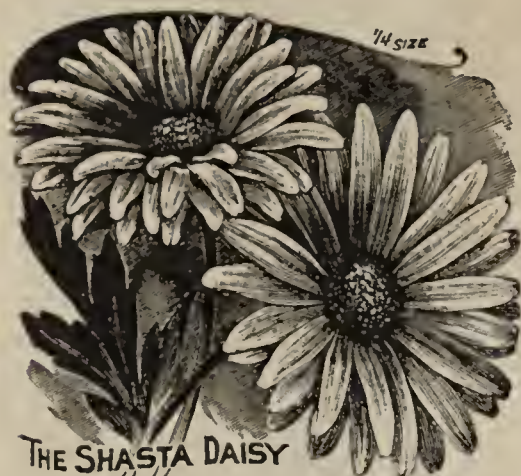
THE SHASTA DAISY

A much improved hardy daisy, bearing a profusion of large, white flowers from early summer until late in the fall. Fine for cut flowers. 3 for 20c; doz., 60c; 100. $4.00.