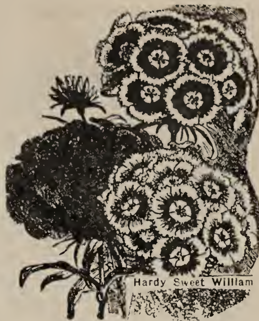
Hardy Sweet William

Bushy plants about 2 feet high with dense spikes of deep blue flowers. A beauty in the garden. SPICATA —One of the best. Postpaid, 3 for 25c; doz., 75c.