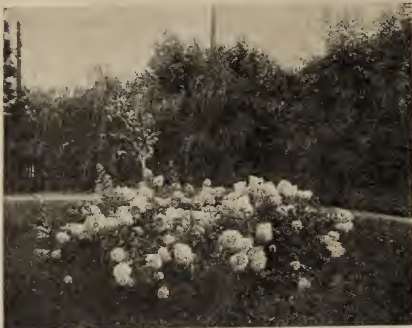
Kelly's Crego Asters

AGERATUM —One of the best summer blooming plants. Their bright blue flowers are produced in the greatest profusion. Postpaid, doz., 30c; 50, 85c.