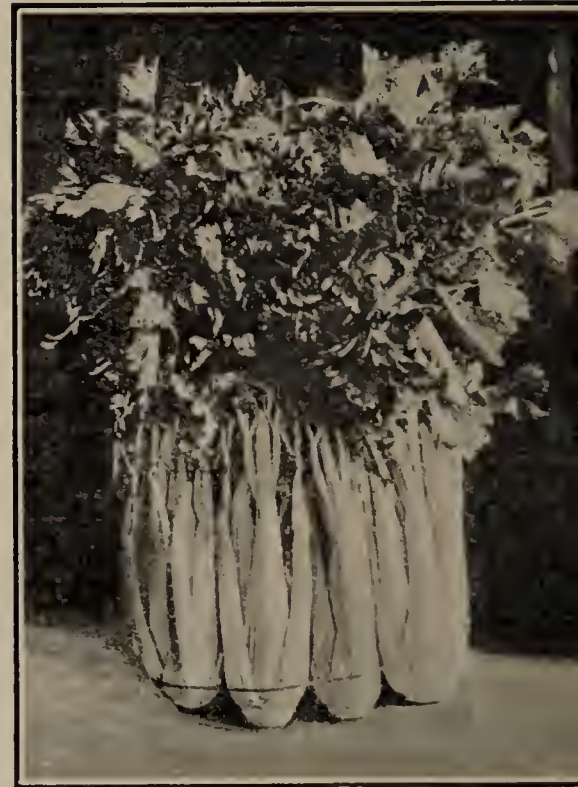
Kelly's Golden Easy Blanching 44 lbs., 1 doz. stalks

TURNIP ROOTED CELERY —In this variety of celery the roots have been developed and not the leaf stalks. The edible root is easily grown in rich, moist soil. Excellent for soups, stews; makes a delicious salad. Postpaid, doz., 25c; 50, 75c.