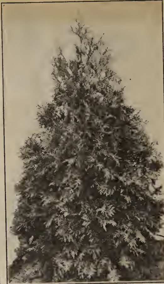
American Arbor Vitae