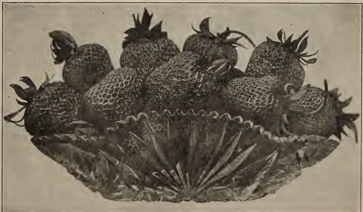
HOWARD NO. 17 OR PREMIER