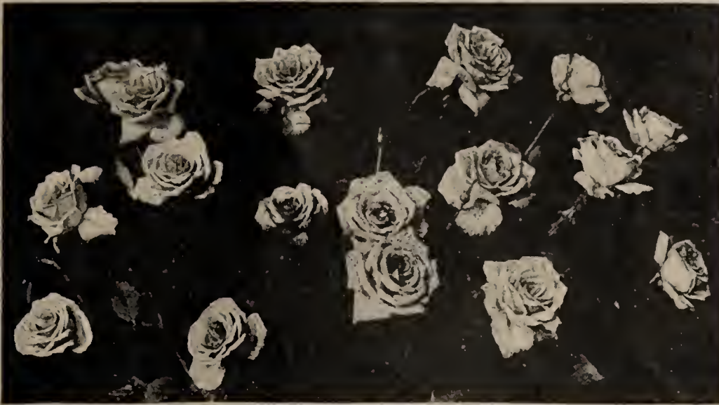
Frau Karl Druschki

The Cream of American Grown Roses for the Pacific Northwest