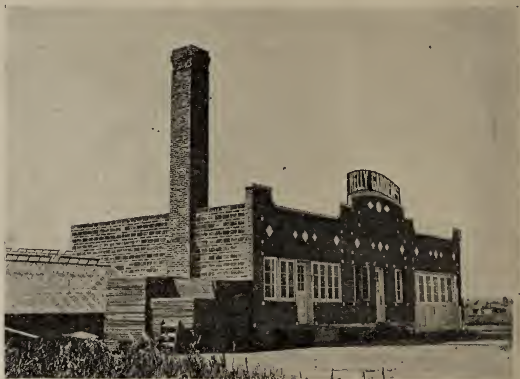
Our Service Plant

While we hold ourselves in readiness, on proper proof, to replace free of charge all stock that may prove untrue to label, or refund the amount paid, we give no warranty expressed or implied as to description, quality, productiveness or any other matter of any stock, seeds, bulbs, or plants we sell.