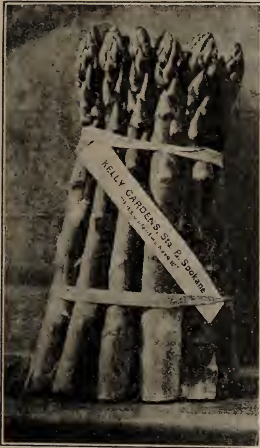
ASPARAGUS KELLY'S PALMETTO