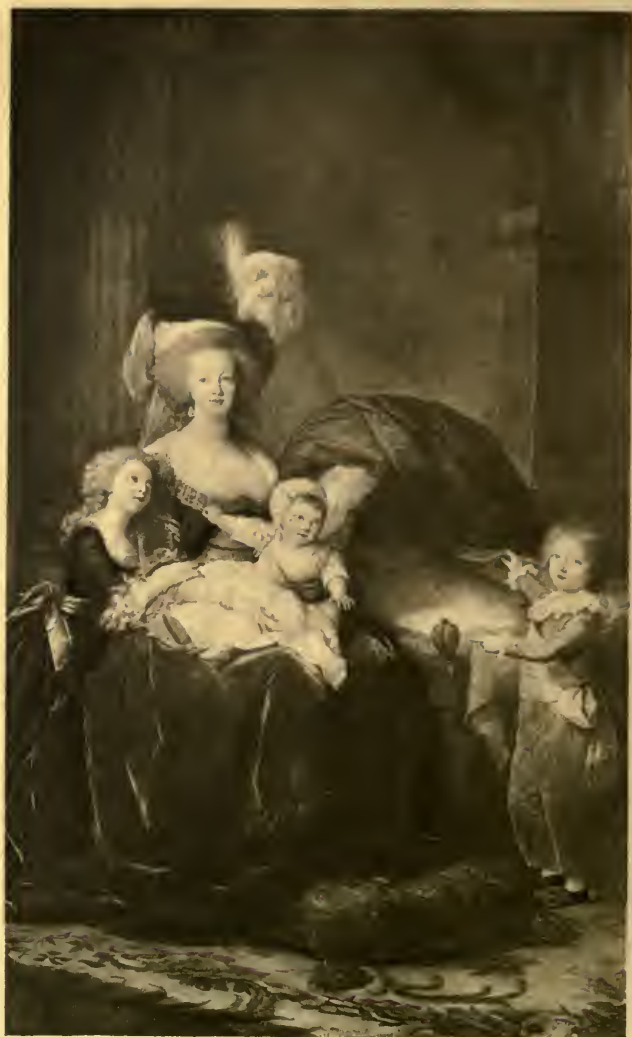
R. Appleton & Company