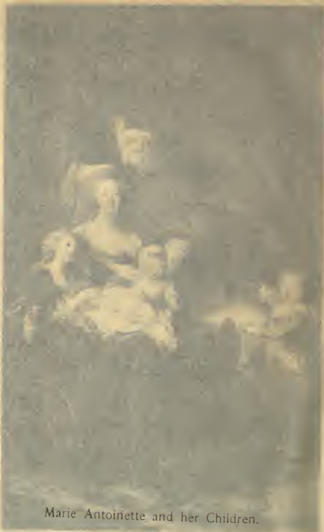
Marie Antoinette and her Children.

From a painting in the Museum at Versailles by Mme. Lebrun.