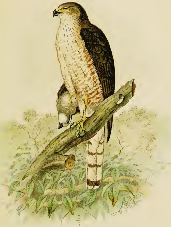
SHARP SHINNED HAWK Accipiter velox (Wils.)