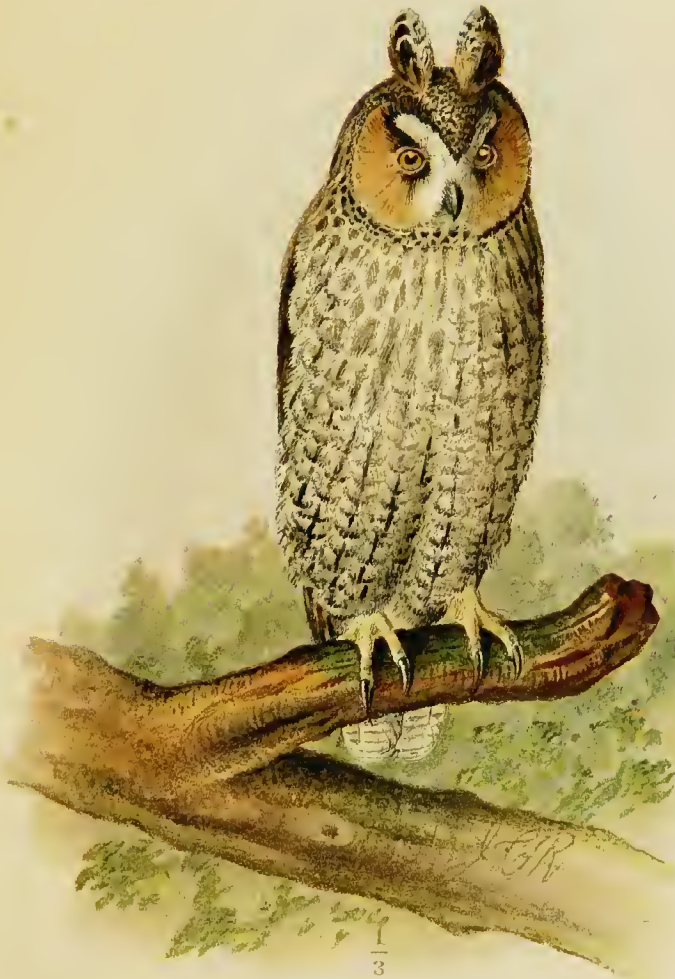
AMERICAN LONG EARED OWL