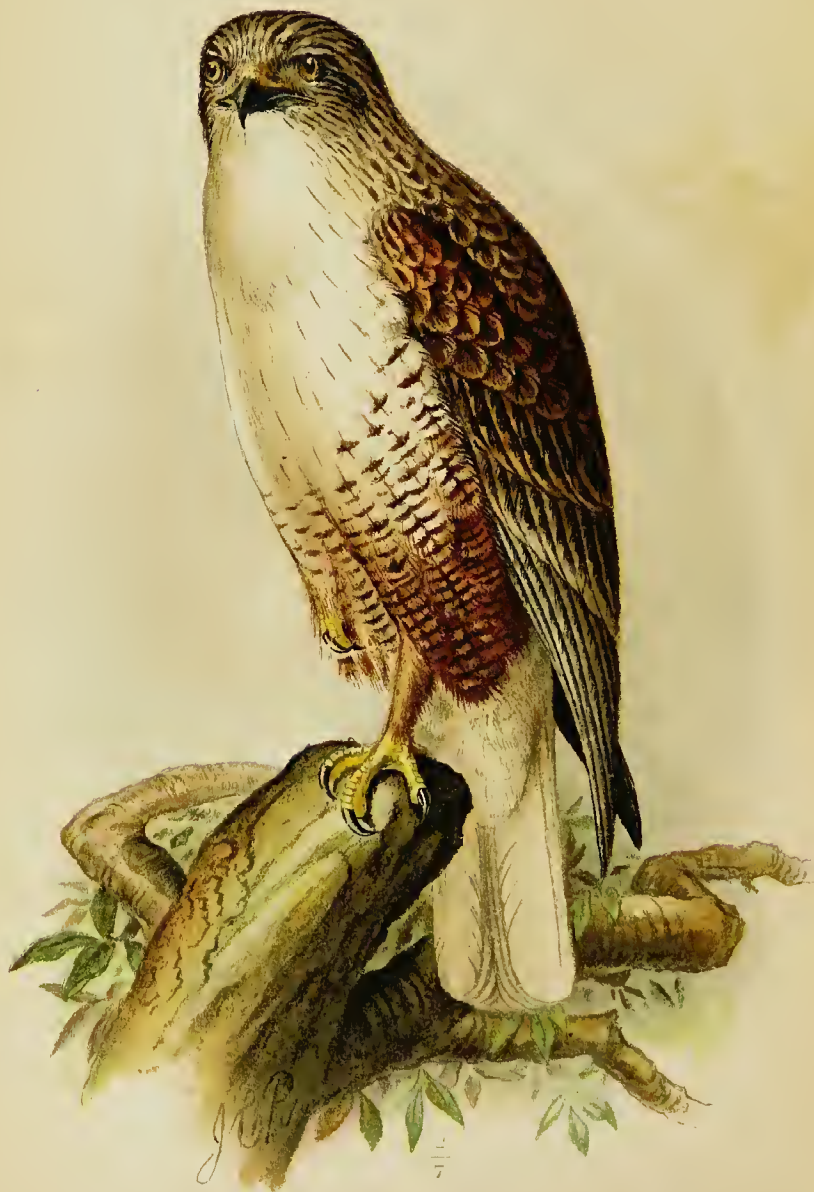
FERRUGINOUS POUCH-LEG Archibuteo ferr