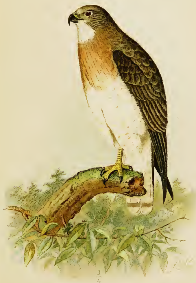
SWAINSON'S HAWK — — — — — Swainson's Hawk