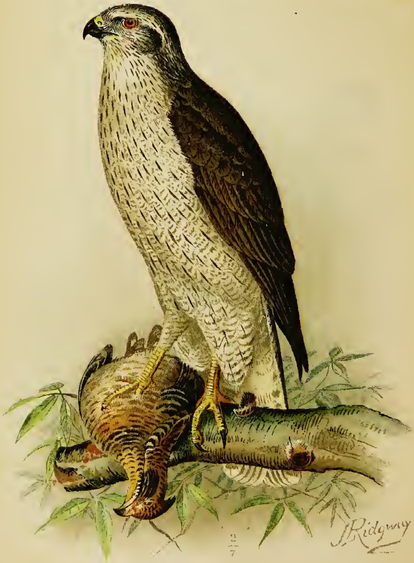
AMERICAN GOSHAWK. Accipiter auricapillus —HAWK —HAWK