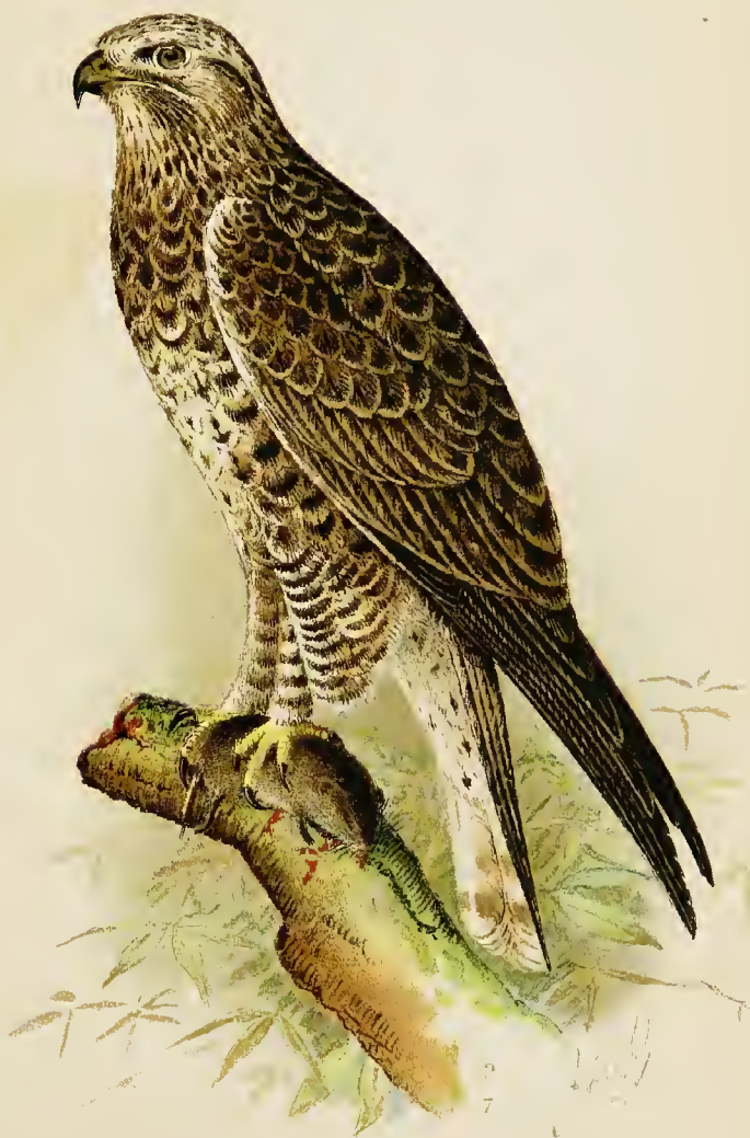
AMERICAN ROUGH LEGGED HAWK