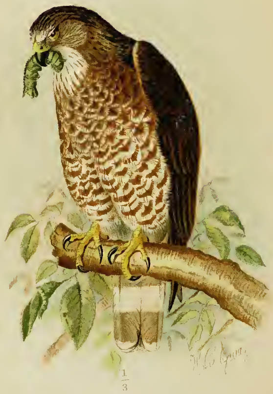
BROAD-WINGED HAWK Buteo latissimus HAWK. HAWK.