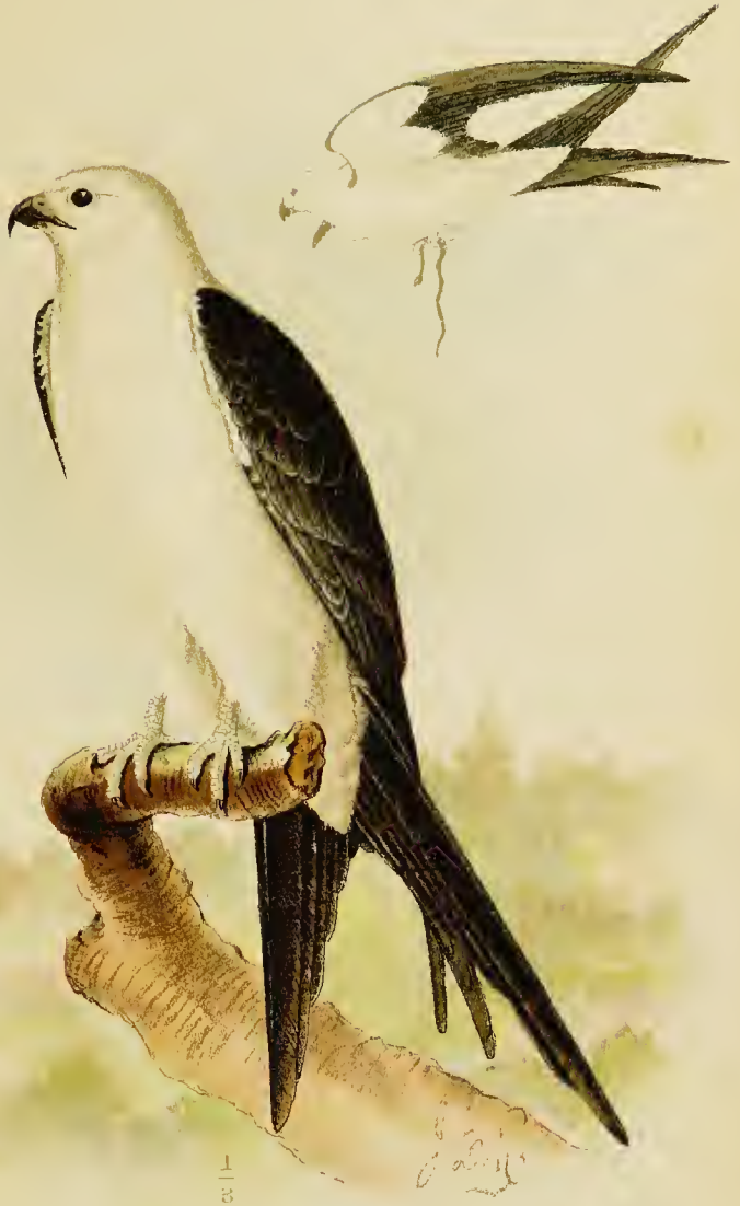
SWALLOW-TAILED KITE Elanoides forficatus