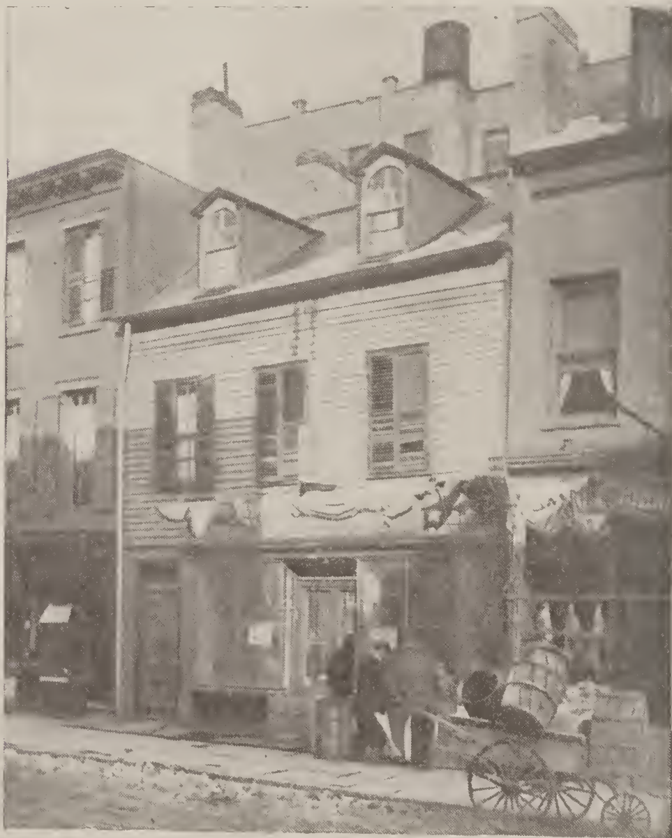
The old Paine house on Bleeker Street—still standing—where Thomas Paine lived during the last year of his life.