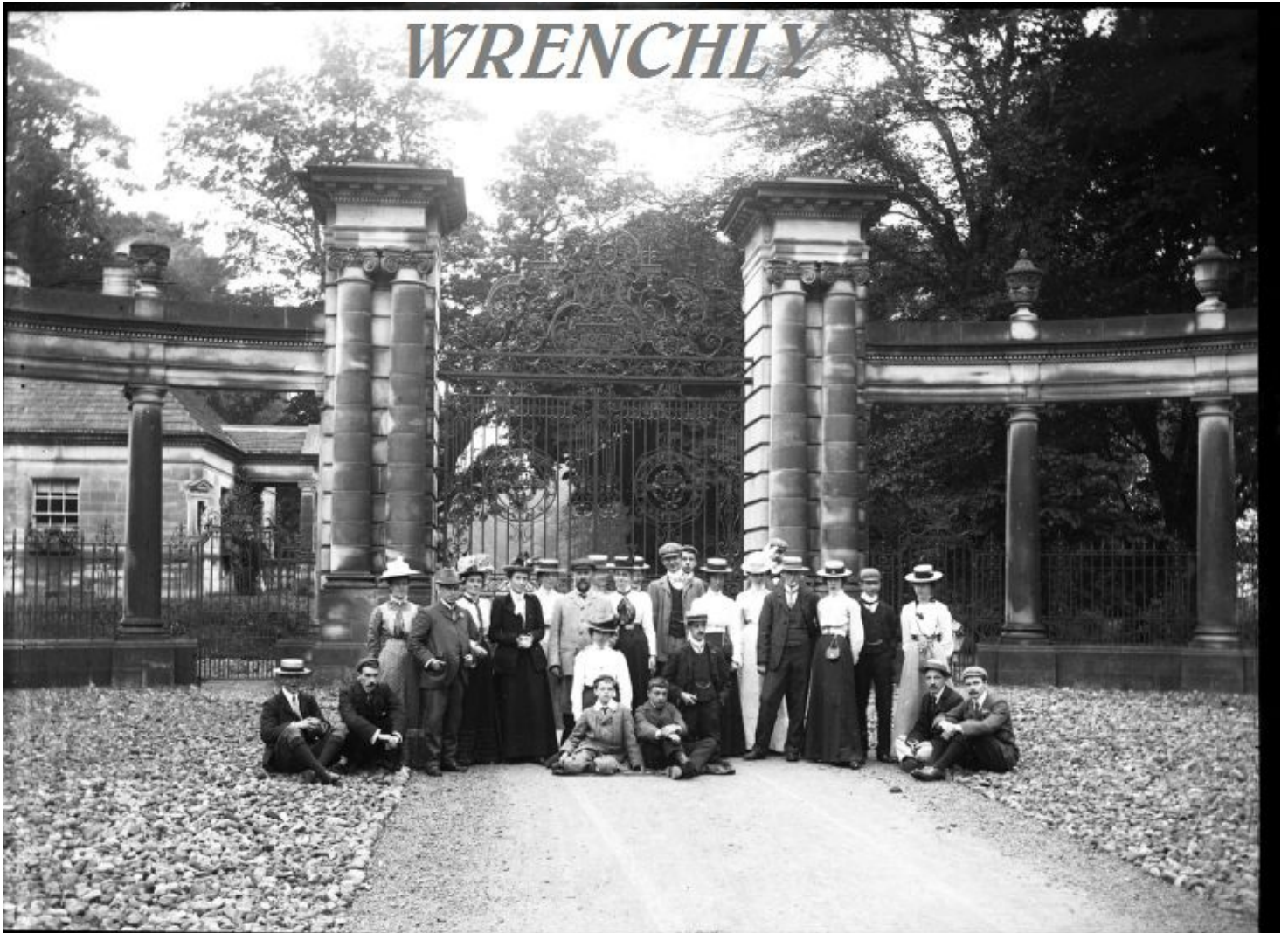
Household Staff at Wrenchly