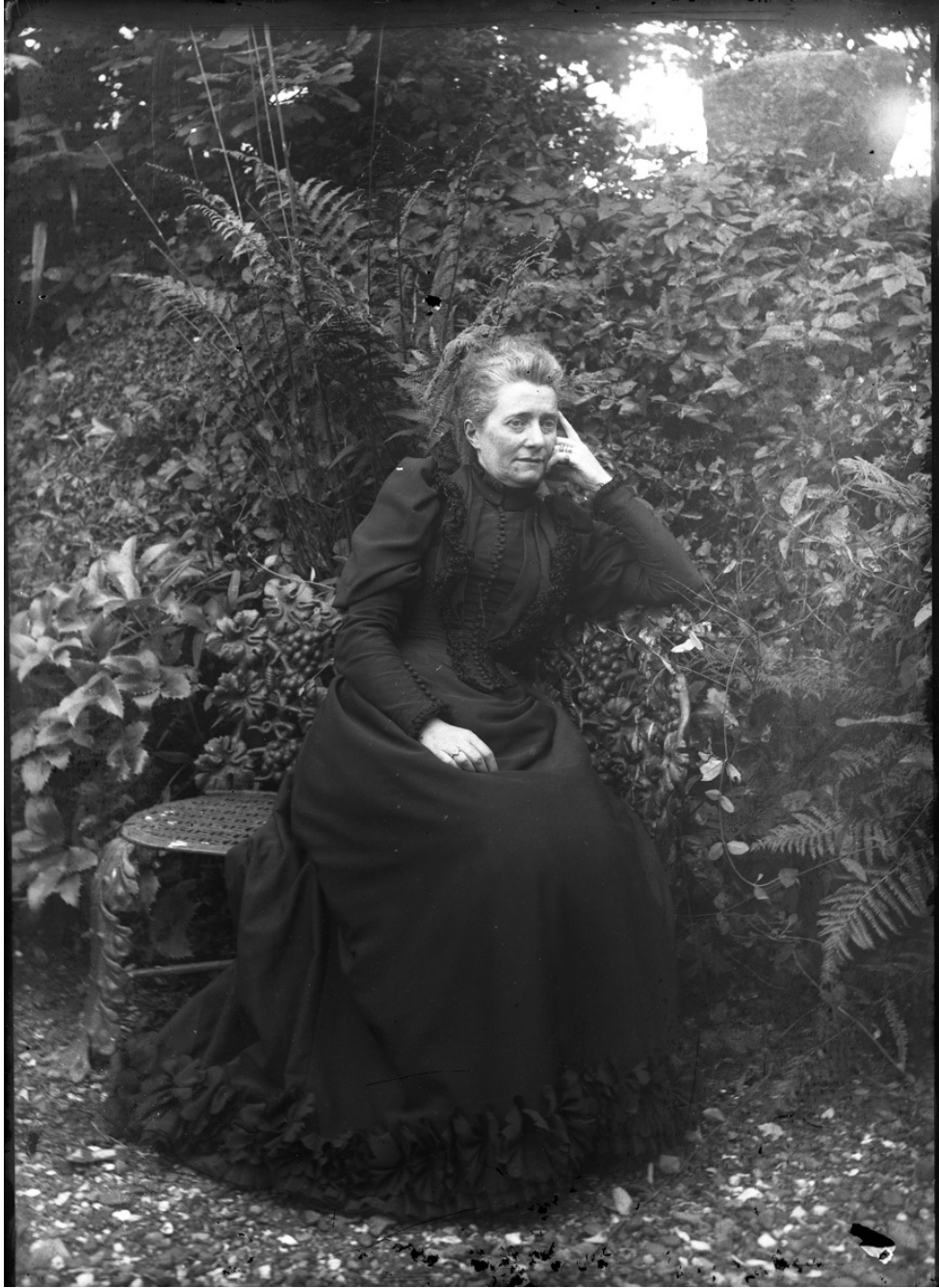
Katherion - Empress of Wrenchly