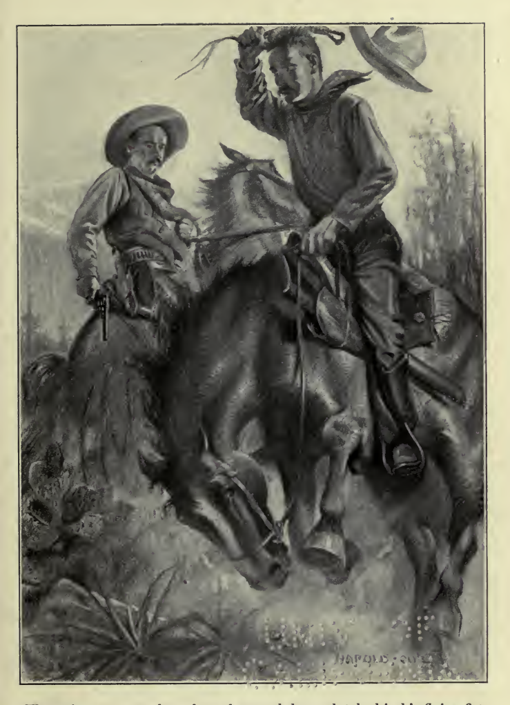
The quirt, wrong end to, danced up and down clutched in his flying fist