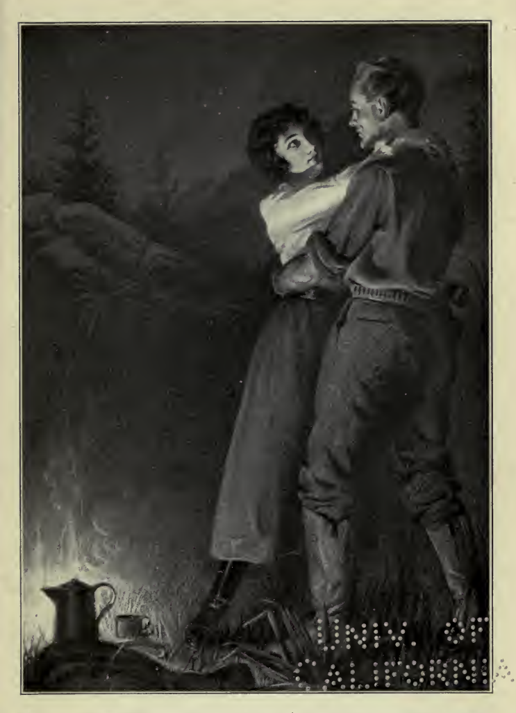
With a gesture wholly savage and feminine her firm arms crept about his neck and fastened there