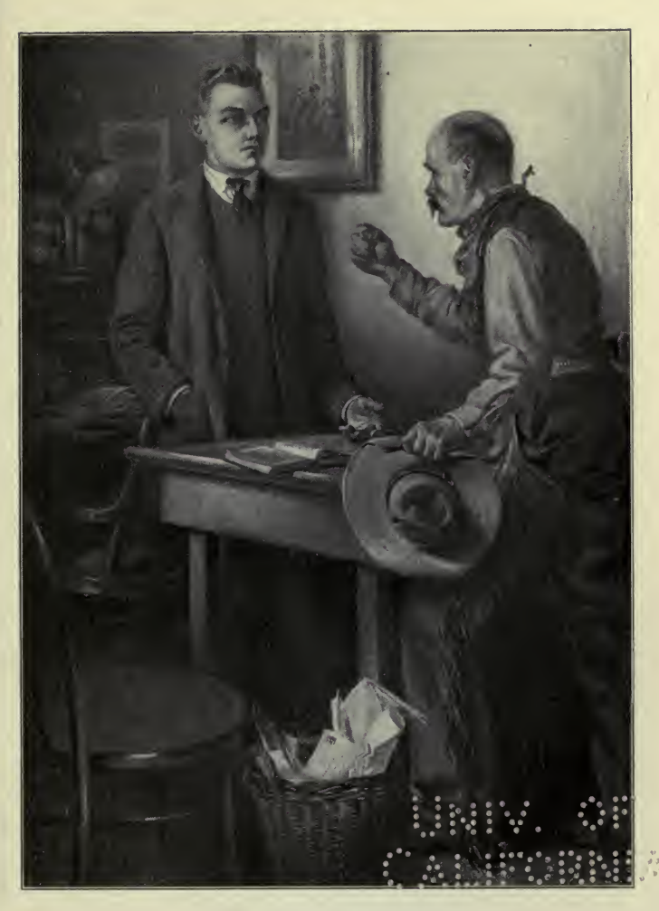
"Then sit here, damn ye!"