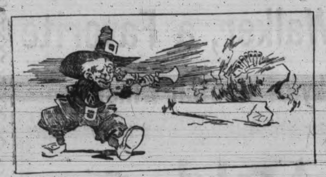
Back in ye olde Colonial dayes, Squire Windethorpe tooke a fowling piece When turkles were not tame, To shoote his Christmas game,