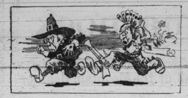
Whose drumsticks he did crave; But when he snapped ye olde flint-locke It proved a Pequod brave.