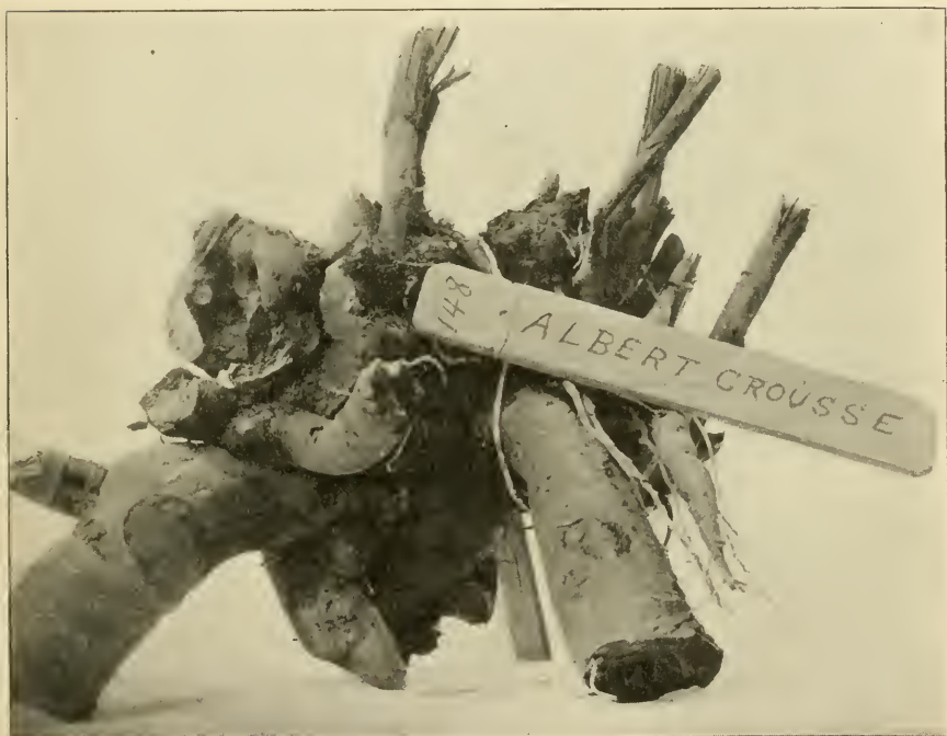
A Better and much more Satisfactory Way of Attaching a Peony Label.

Again, confusion sometimes arises directly in the nursery row itself, and this is often due to the fact that in digging,