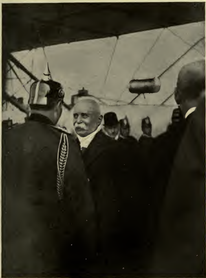
WILLIAM II CONGRATULATING COUNT ZEPPELIN ON THE FIRST VISIT OF HIS AIRSHIP (DESTROYED BY FIRE THREE DAYS LATER) TO BERLIN