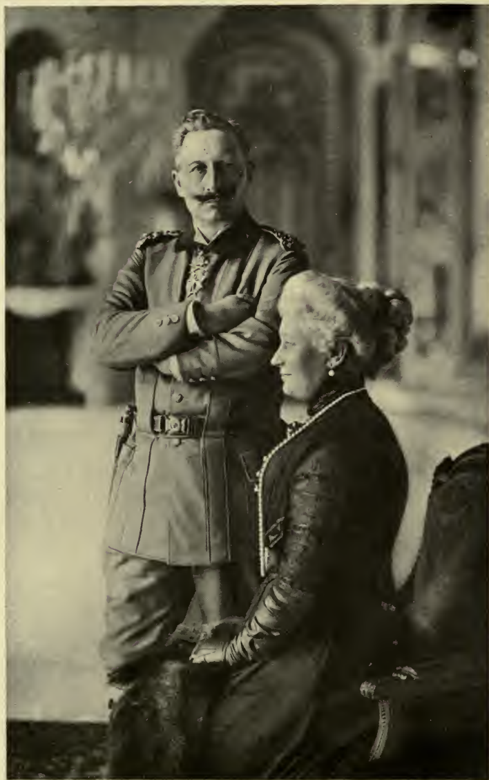
THE GERMAN EMPEROR, WILHELM II, AND THE EMPRESS AUGUSTA VICTORIA