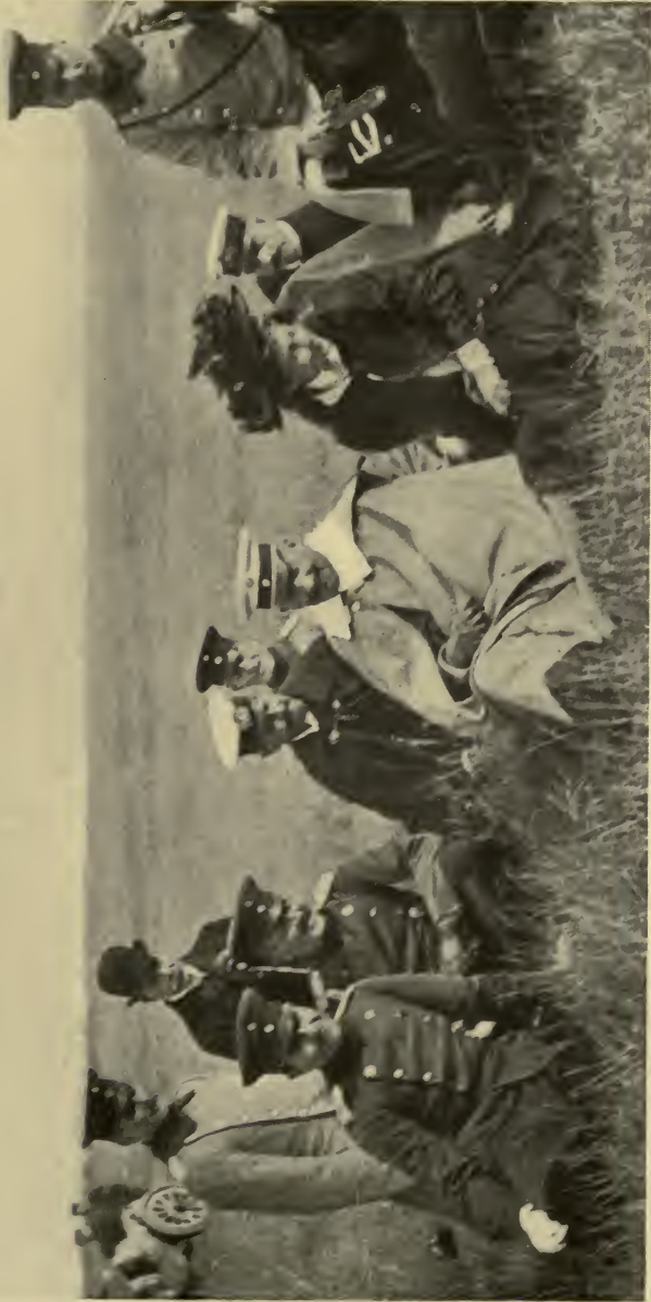
WILLIAM II, WAITING IN POTSDAM WITH HIS DAUGHTER AND SUITE, FOR THE ARRIVAL FROM BERLIN OF THE FIRST "PARSEVAL" AIRSHIP, WHICH, HOWEVER, MEETING WITH AN ACCIDENT EN ROUTE , FAILED TO ARRIVE, BEING PRACTICALLY WRECKED ON THE WAY