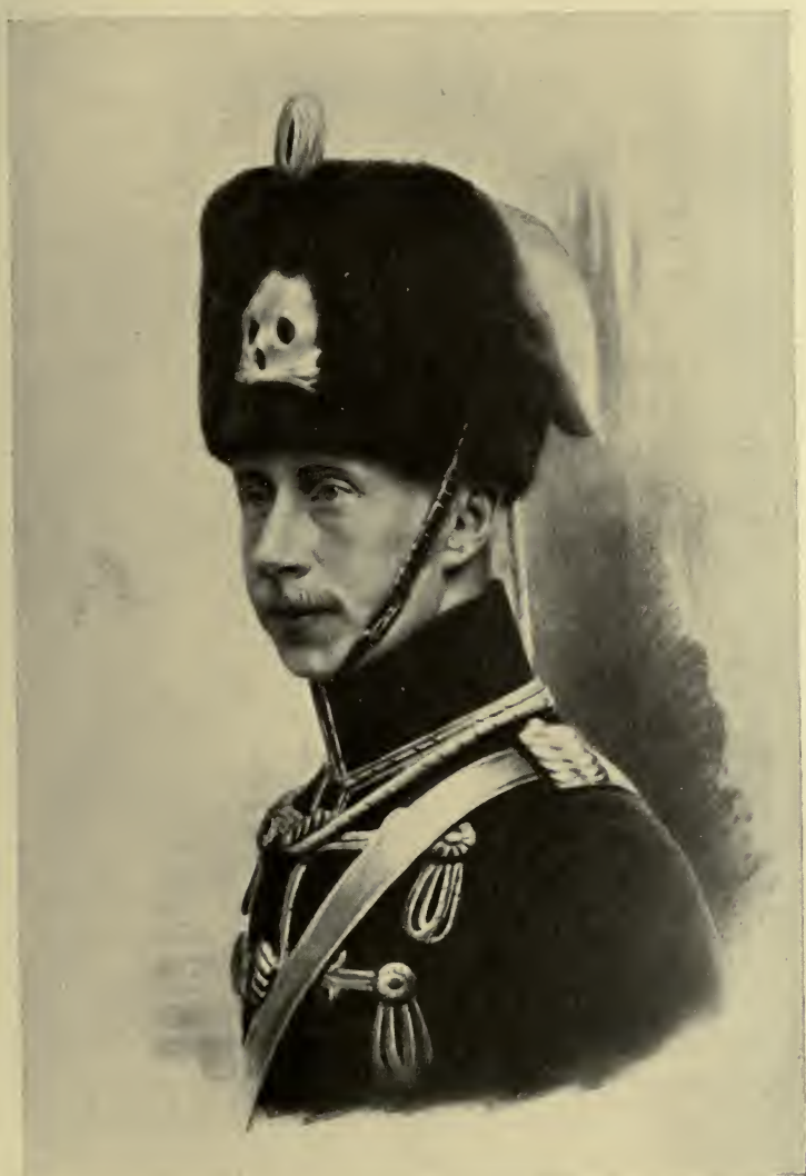
THE GERMAN CROWN PRINCE