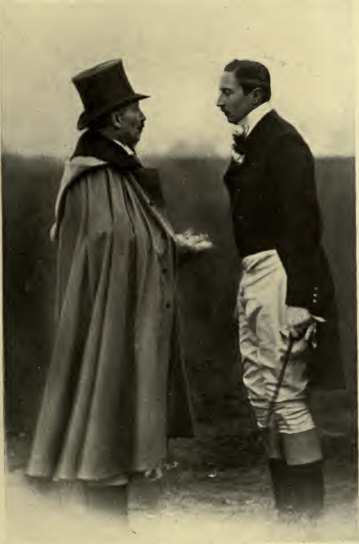
WILLIAM II, ON ST. HUBERT'S DAY, AT THE CLOSE OF THE CUSTOMARY HUNT, TALKING WITH HIS FOURTH SON, PRINCE AUGUSTUS WILLIAM. THE EMPEROR HAS ADDED A MILITARY CLOAK TO HIS HUNT UNIFORM