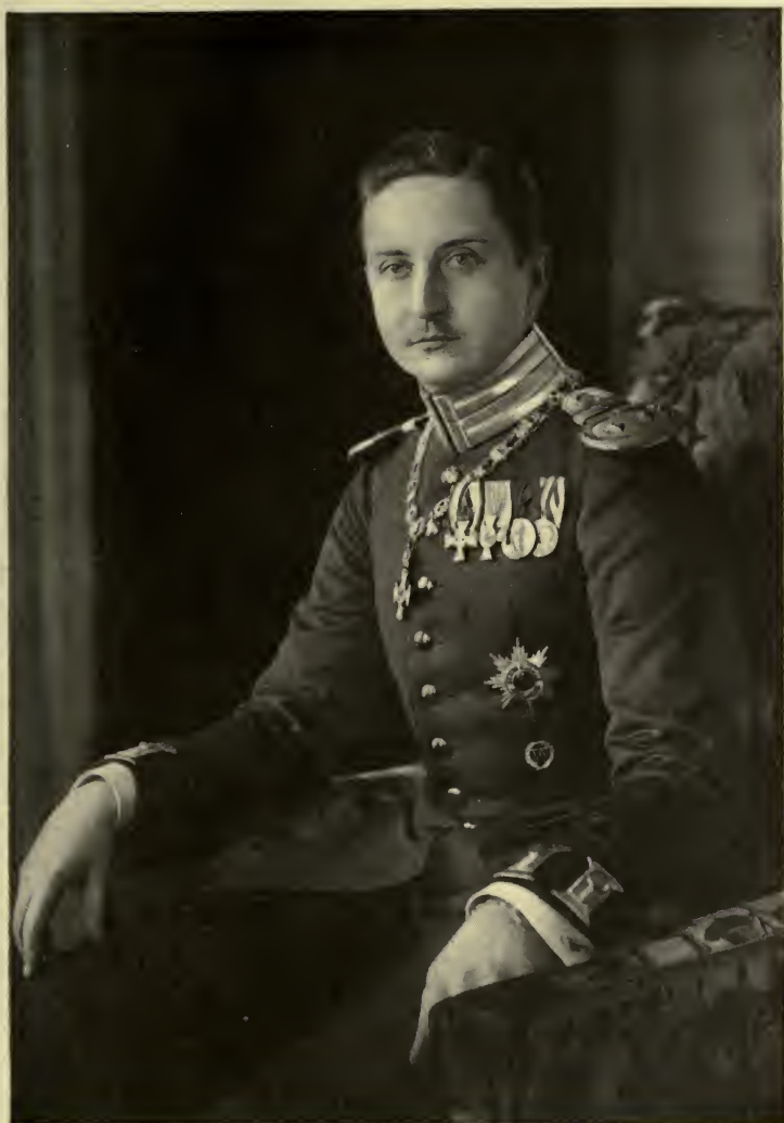
PRINCE AUGUSTUS WILLIAM OF PRUSSIA, FOURTH SON OF THE GERMAN EMPEROR