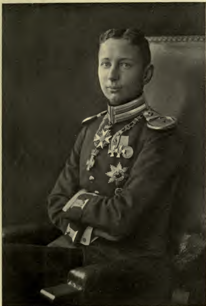
PRINCE JOACHIM OF PRUSSIA, SIXTH SON OF THE GERMAN EMPEROR