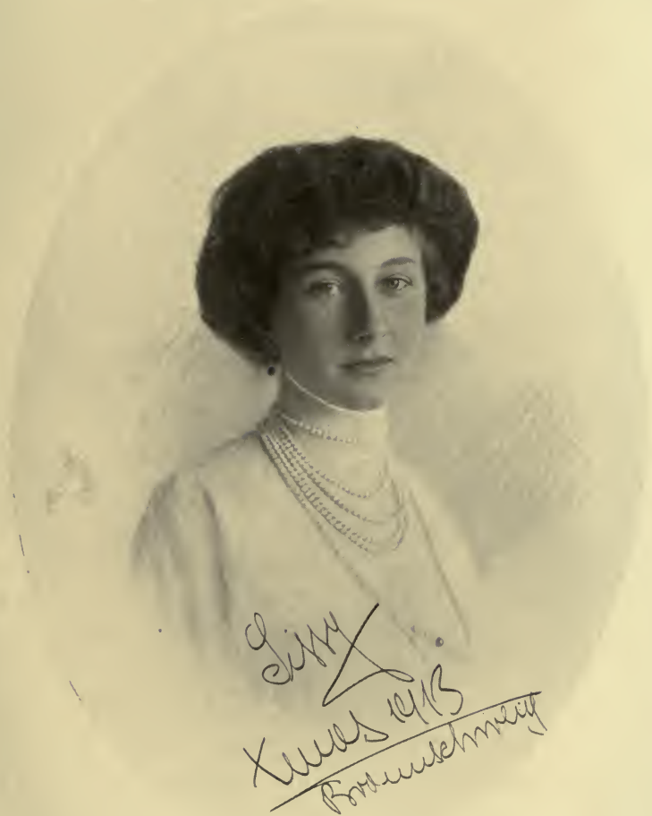
THE DUCHESS OF BRUNSWICK (PRINCESS VICTORIA LOUISE OF PRUSSIA) YOUNGEST CHILD AND ONLY DAUGHTER OF THE GERMAN EMPEROR