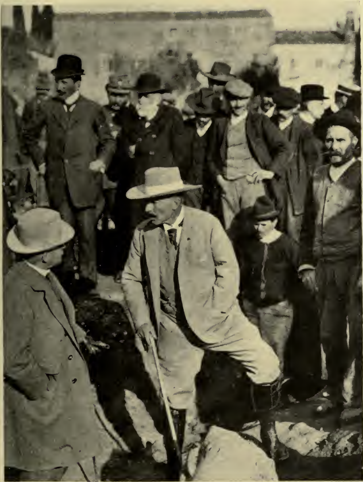
WILLIAM II IN CORFU, SHOWING COUNT BULOW THE REMAINS OF A RECENTLY-DISCOVERED ANCIENT GREEK TEMPLE