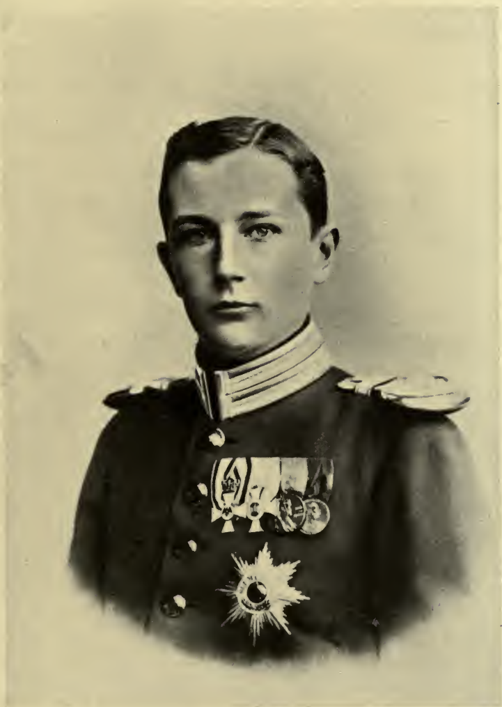
PRINCE EITEL FRIEDRICH ("PRINCE FRITZ"), SECOND SON OF THE GERMAN EMPEROR