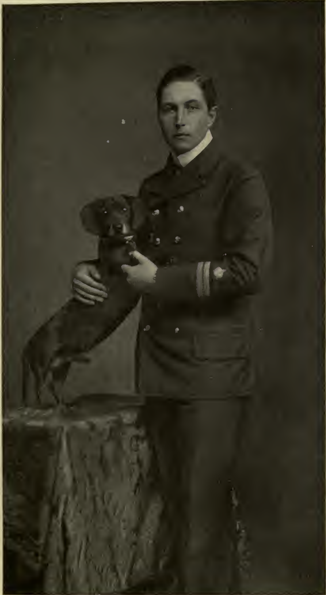
PRINCE ADALBERT OF PRUSSIA, THIRD SON OF THE GERMAN EMPEROR