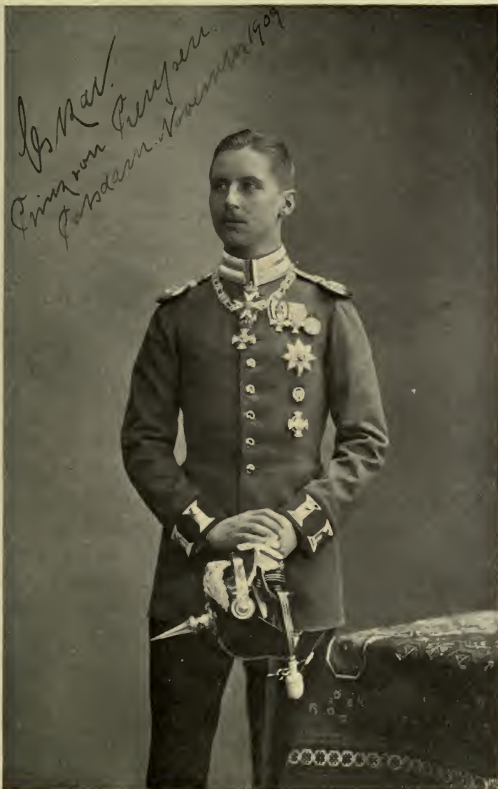
PRINCE OSCAR OF PRUSSIA, FIFTH SON OF THE GERMAN EMPEROR