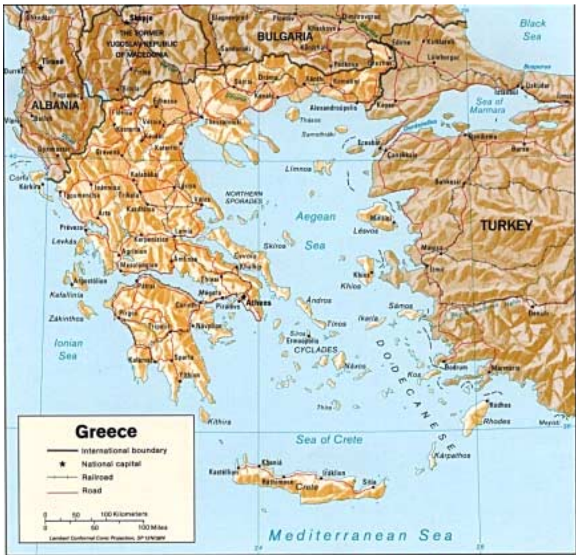
Figure 1. The Aegean Sea.

Dodecanese islands (a group of 12 islands off the southwestern Anatolian coast owned at this time by Italy), to Greece. [See Figure 1.] It appeased Turkey, though, by ensuring various levels of demilitarization of the Greek islands near the Turkish coastline. The Treaty also tried to resolve the controversial and painful issue of Greek and Turkish