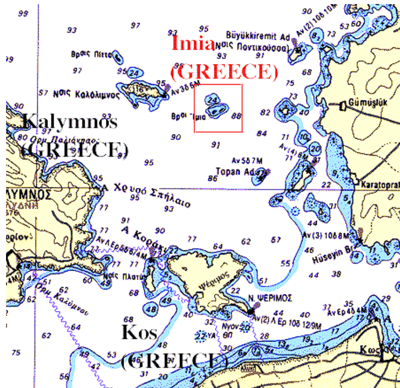
Figure 6. Imia/Kardak. From Ministry of Foreign Affairs of Greece, http://www.mfa.gr/foreign/bilateral/imiamap.htm .

hold little significance, but to the Greeks and Turks they are much more important and tie in to the larger overall Aegean dispute.