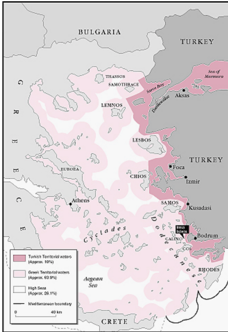
Figure 4. Possible Distribution of Territorial Seas in the Aegean (12 nm).

Such an extension would turn the Aegean into a de facto Greek sea, fragmenting the areas of high seas due to the scattering of the Greek islands. This would in essence confine Turkish vessels in their own territorial waters as well as block them from entering Turkish territorial waters from the Mediterranean Sea; in reality they would not actually be confined nor blocked because of the right of innocent passage, but Turkey feels that Greece would be able to control them and impose guidelines and restrictions to such