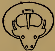
Ordinary Brave or Squaw.

The ordinary brave or squaw as soon as admitted wears the simple badge, so—