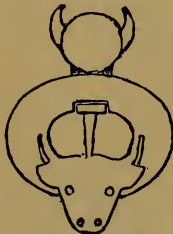
Head War Chief.

The Head Chief wears, in addition to the beard, a horned shield. On the circle of the shield is engraved the totem of the Tribe.