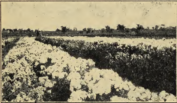
A SECTION OF OUR HARDY PHLOX FIELD

HERBACEOUS PERENNIALS PEONIES, ROSES, FORCING STOCK GLADIOLI AND DAHLIAS