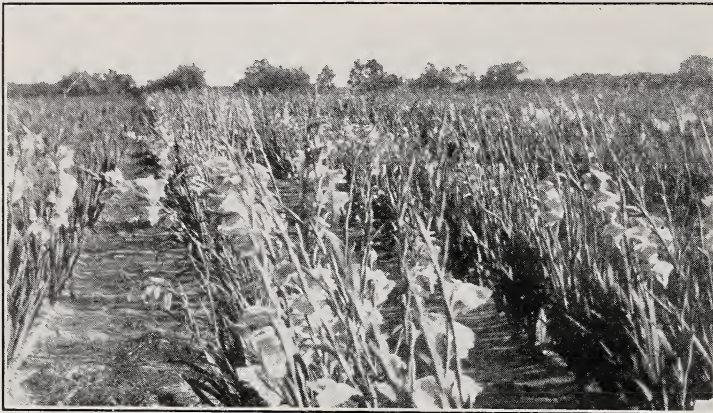
A SECTION OF OUR GLADIOLI FIELD