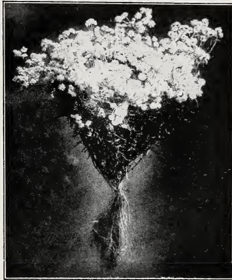
ACHILLEA THE PEARL