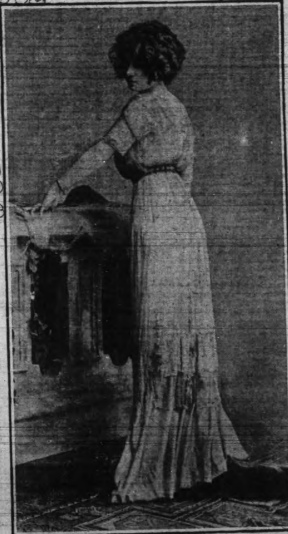
Pink Liberty Satin Gown with Gold Embroidered Tunic Maison Ney

There is a most extraordinary change in the appearance of all restaurants now from even five years ago. Low gowns are fashionable and the majority of women do not wear hats. If hats are worn they are either of enormous size and of the most costly description or are small, eccentric, but very smart, on the head dress order, and incidentally very expensive also. At first glance there is not any marked difference between the theatre and the ball gown, but a closer inspection reveals there is a decided difference in the cut of the waist. It is not so low in the neck; in fact, is much more on the order of what in our grandmother's day were known as V shapes and square necks. The shoulders are more covered, veiled as are the upper arms with folds of the material of the gown—voile de soie, chiffon or some semi-transparent material of the same color, outlined with a fold of black or white, preferably the latter if not becoming. At the back the V shape