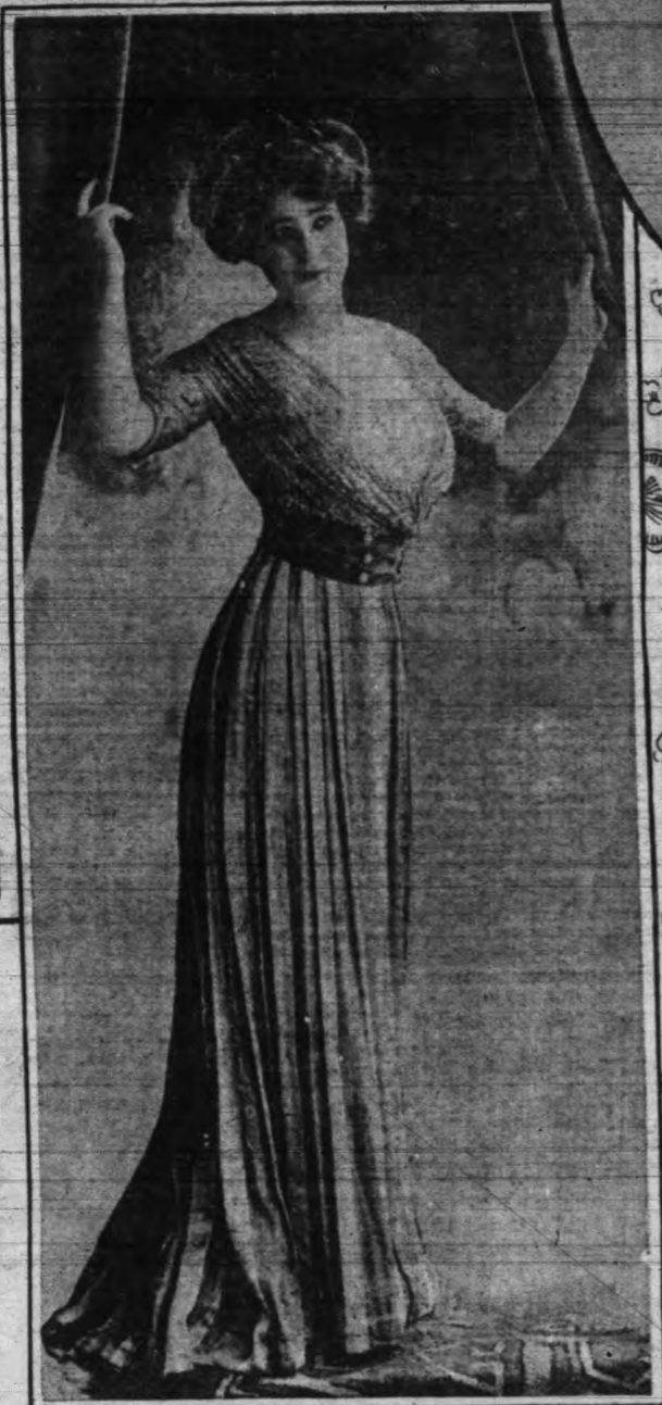
Gray Silk Gown with Silver Embroidered Trimming Maison Ney

To begin with, the waist cut low at the neck is much cooler and more comfortable; then nothing injures a heavy gown of velvet, or indeed any material, more than to wear it at the theatre, when it gets so crushed in the limited space allowed for each individual. It makes possible the wearing of the most inexpensive