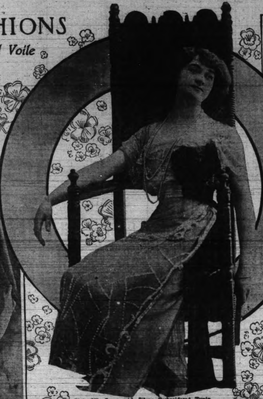
Pink Silk Gown with Silver Embroidered Tunic

This applies only to what is worn at the theatre, for there is no place where all the details of a costume show more distinctly than at a restaurant.