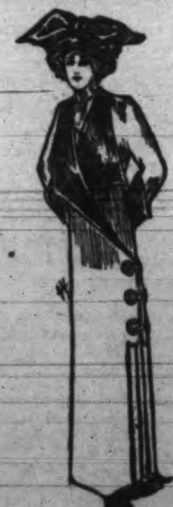
Long Cloth Coat with Satin Revers and Collar.

Asbes of roses was years and years ago a most fashionable color. In the winter just past and now again this spring it is in style, and for a theatre gown combined with black lace is very smart. It is not to be worn by a young girl and is one of the few colors most becoming to older women. With a touch of soft cream white lace, jewelled trimmings, in which are pink amethysts, a color scheme can be worked out most effectively. There is a smart combination sometimes attempted of a touch of blue with the shades of roses, but this can only be satisfactorily worked out by some one who is an artist in colors as well as clothes.