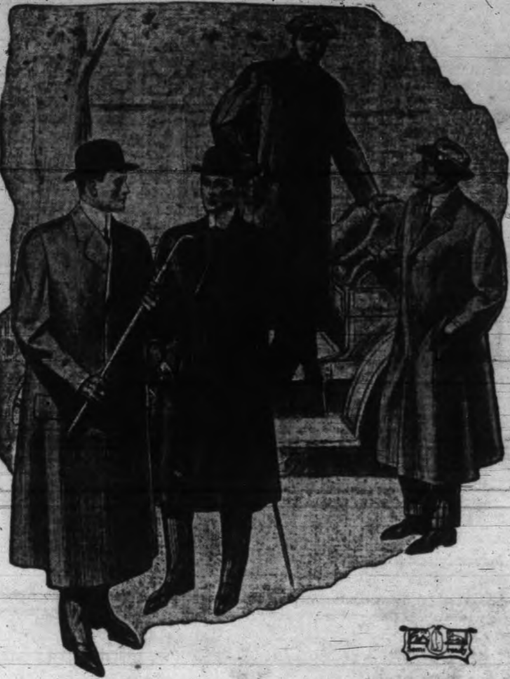
The Correct Style in Spring Overcoats

A VISIT to the Semi-ready tailor shops is most interesting at this season of the year, when all the new style creations are being shown in patterns and weaves which are the pride of the English woolen mills.