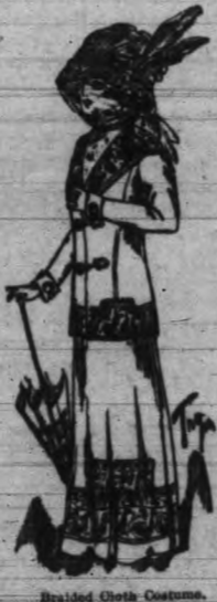
Straited Cloth Costume.

more fanciful coat is the more appropriate. Straight lines for coat and skirt are to