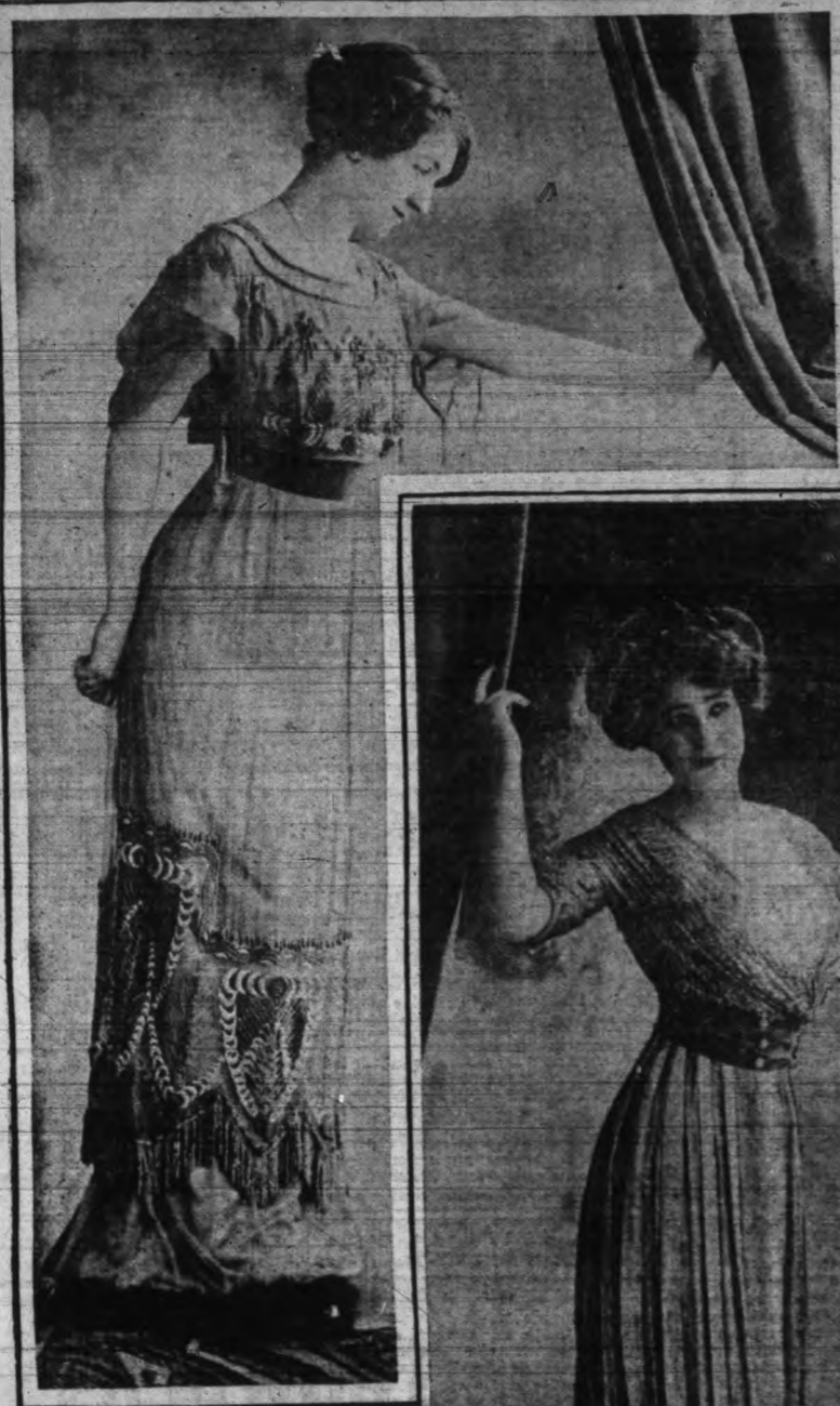
Nattier Blue Silk Voile Gown Maison Drevoll