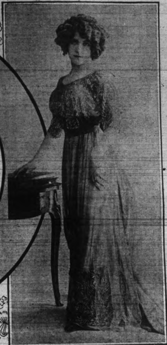
Gray Silk Voile Gown with Silver Embroidery Maison Ney