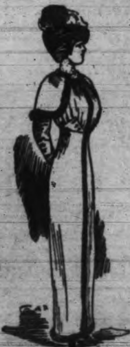
The Clock Costume.

be the rule, and, while the achieving of just the right effect is difficult at first, the fashion is not an impossible one to copy if it is realized that the finish must be perfect and that there must be sufficient width across the shoulders to give that straight loose appearance that is required.